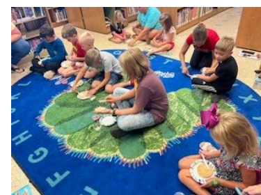
Figure 2 Sabine Library Nutrition Lesson