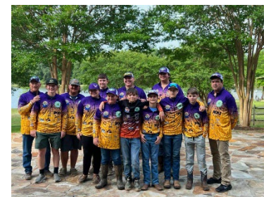
Figure 1 Sabine Shooting Sports members

Citizenship/Leadership Science, Engineering, & Technology