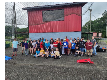
Figure 3 Junior Leaders