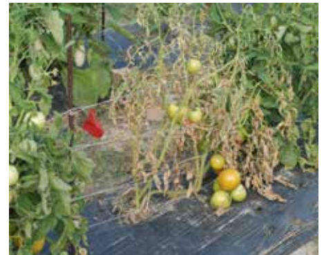
Figure 5. Tomato southern blight