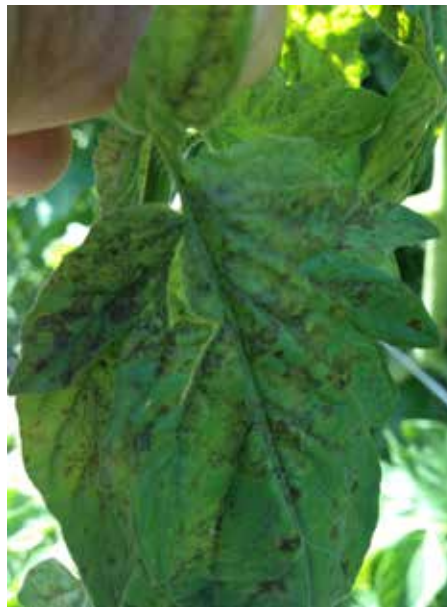
Figure 7. Tomato spotted wilt disease.