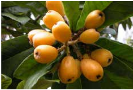
Loquats flower in the fall and fruit matures in the spring.