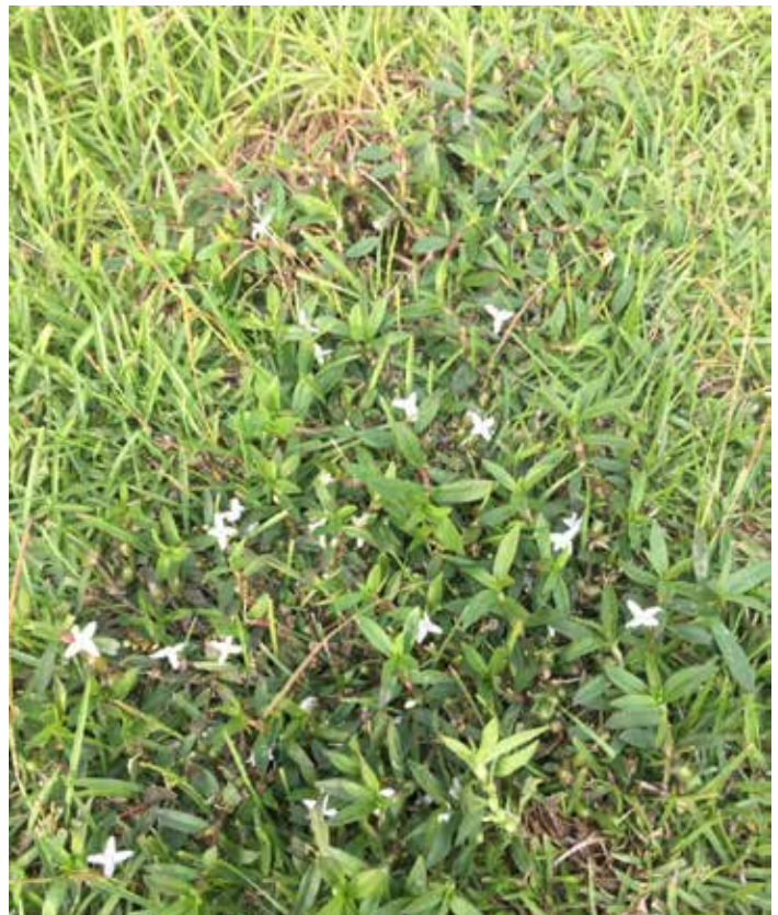
Virginia buttonweed begins flowering in mid-summer.