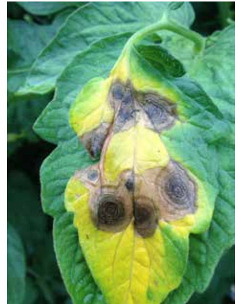
Figure 1. Tomato early blight.

Phytophthora root rot. Root and crown rots commonly affect plants in the home garden, particularly those in poorly drained sites with compacted soils. The first noticeable above-ground symptoms generally include wilting of the leaves, especially during the heat of the day, and stunting of the plants. Additional