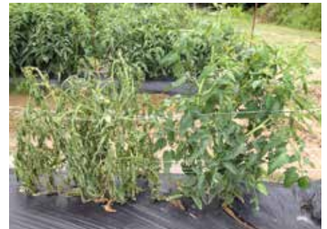
Figure 6. Tomato southern bacterial wilt.