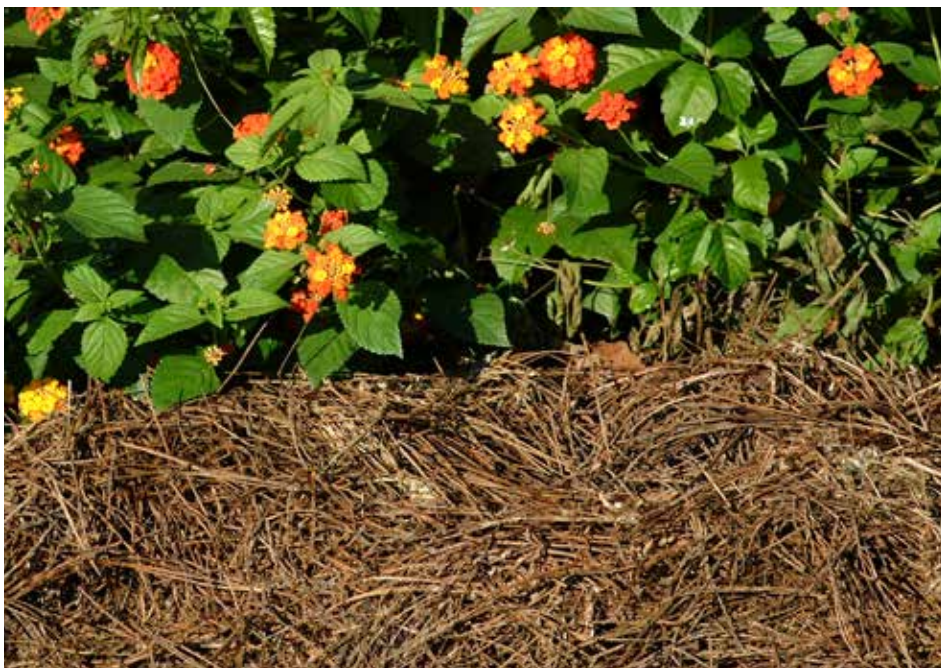
Pine straw is an excellent natural mulch.