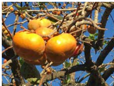
Persimmon fruit hangs on the trees in fall even after leaves have dropped.

Be sure you think about the mature size of the plants you select. Trees will require much more room and may need watering when rain is scarce. Some trees to consider for Louisiana are figs, persimmons, pecans, satsumas, mayhaws, pawpaws, date palms, olives, pomegranates, lemons, kumquats, loquats, and some peaches, apples and pears in the more northern parts of the state. Consult the LSU AgCenter website for a list of varieties suitable for your