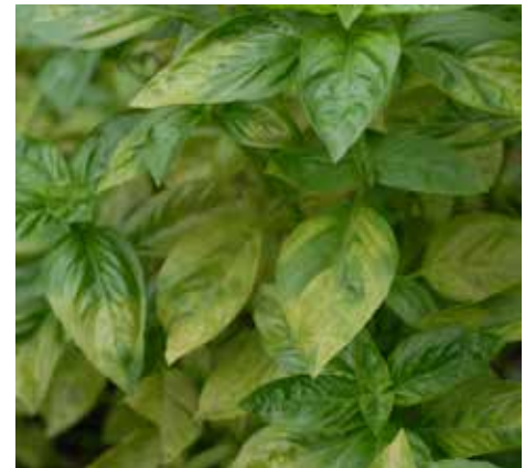
Figure 2. Sweet basil downy mildew.