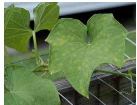
Figure 3. Chayote powdery mildew.