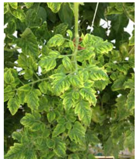
Figure 8. Tomato yellow leaf curl disease.