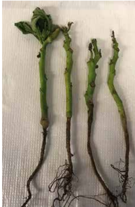
Figure 4. Okra Phytophthora root rot.