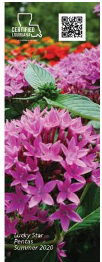
Lucky Star Pentas Summer 2020