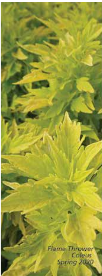
Flame Thrower Coleus Spring 2020