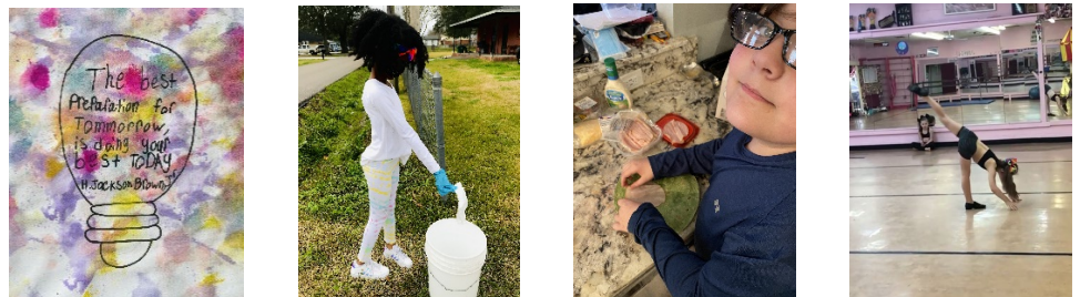
Encouraging healthier living • Building healthier communities • Eating healthier snacks • Dancing to healthier fun

Check out some of our 4-H'ers who participated in the 4-H Color Me Healthy Week!