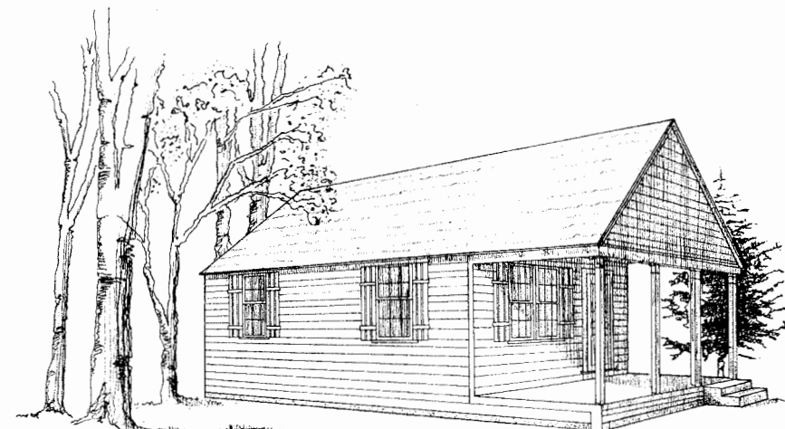
PERSPECTIVE (NO SCALE)