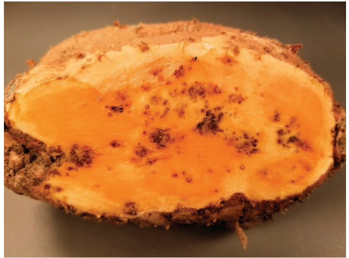
Figure 5. Egg masses of the guava root-knot nematode visible inside storage roots of sweet potatoes.

400 to 600 eggs, and the life cycle can be completed in just four weeks during warm weather. Large numbers of egg masses may be visible on small roots (Figure 4) or found within storage roots of sweet potatoes (Figure 5). Although the nematode itself cannot move very far in the soil, it can easily spread by any outside force that moves soil, such as farm equipment, irrigation or heavy rainfall. The nematode can easily be disseminated on plant materials such as the storage roots of sweet potatoes or ornamental plants.