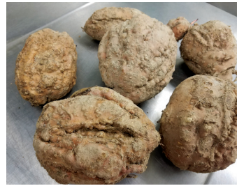
Figure 6. Cracking and large knots or bumps associated with the guava root-knot nematode on unwashed storage roots of a Covington sweet potato.

The guava root-knot nematode is very similar to our common Southern root-knot nematode in the type of damage it causes and its host range and morphology. Both nematodes can cause severe damage to plants, reducing yields and causing early death. Stunting, yellowing of plant foliage and early wilting during drought are also characteristic symptoms of both nematodes. One of the best ways for producers or gardeners to recognize that the guava nematode is present is when crops resistant to the Southern root-knot nematode display serious galling of the root system. Crop varieties that have been developed with resistance to our common root-knot nematode rarely display more than a few small galls, and plants normally do well even in the presence of that nematode. At the present time, the sweet potato is one of the crops with significant problems associated with this nematode in the United States. Sweet potato storage roots are severely deformed, with large cracks and knots and unsightly dark spots in the flesh of the root (Figures 6 and 7). If you peel the skin away from the storage root, you can also see the developing females and egg masses in the tissue below (Figure 8).