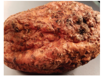
Figure 7. Washed roots showing pronounced bumps and cracking associated with the guava root-knot nematode on a Covington sweet potato.