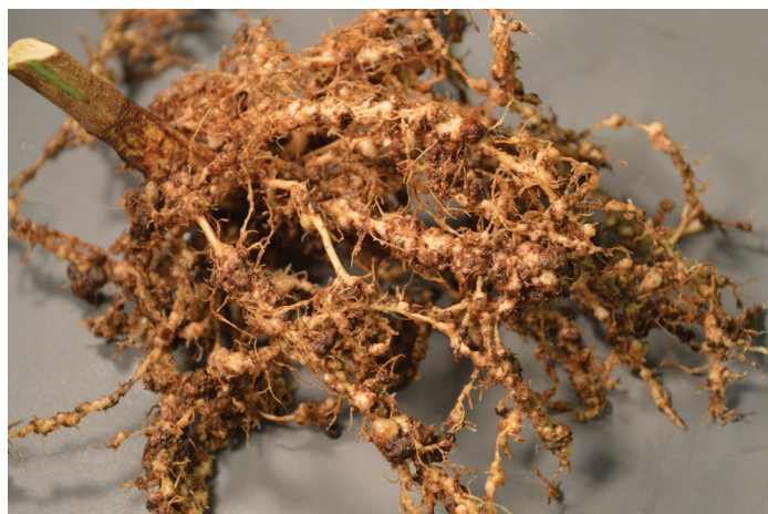
Figure 1. Galling on soybean roots from the Southern root-knot nematode.

The guava root-knot nematode is found in tropical to subtropical areas of the world, including Central and South America, Africa and Asia. It has also been found previously in Florida and North Carolina and very recently in South Carolina. This nematode is similar to other root-knot nematode species in which young juveniles of the nematode hatch from eggs in the soil and migrate toward root tips of susceptible plants. The nematode enters the roots, sets up a permanent feeding site and begins developing into a mature female. During this process, large galls, or swellings, of the root tissue may form in association with the developing female. A single female (Figure 3) will produce as many as