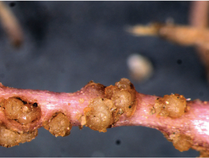
Figure 4. Egg masses of the guava root-knot nematode visible on a sweet potato root.