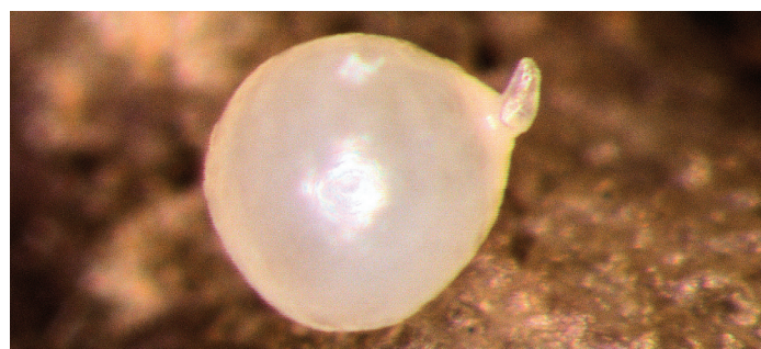
Figure 3. A mature female of the guava root-knot nematode.