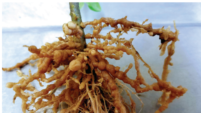
Figure 2. Galling on tomato roots from the guava root-knot nematode.