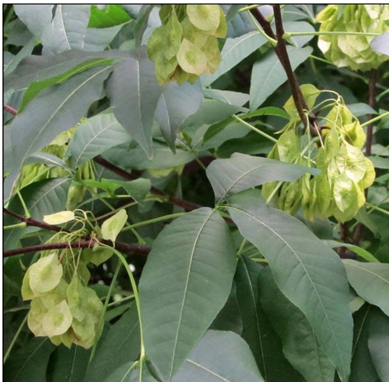
The leaves and namesake seedpods of a wafer ash Ptelea trifoliata .

If you grow wildflowers and native plants in your