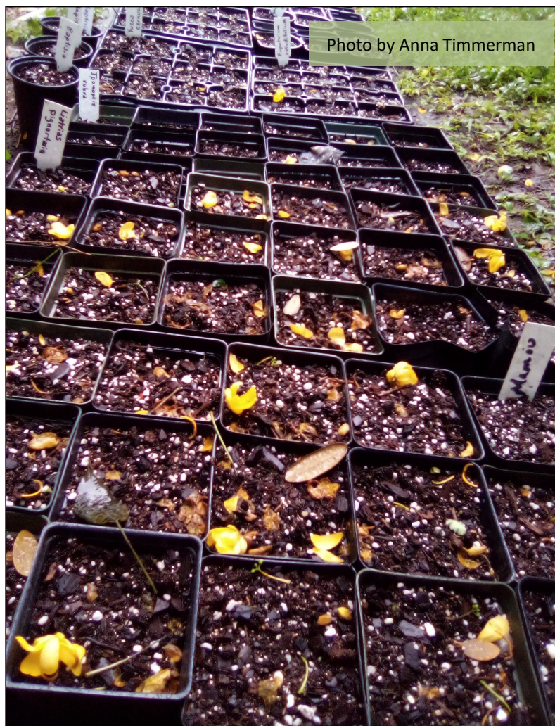
Seeded and labeled starting trays of native plants.

Some seeds require some further processing before they can be planted. Seeds with hard seed coats usually need some sort of damage to take place to that seed coat to ensure good germination. Mamou or Coral Bean