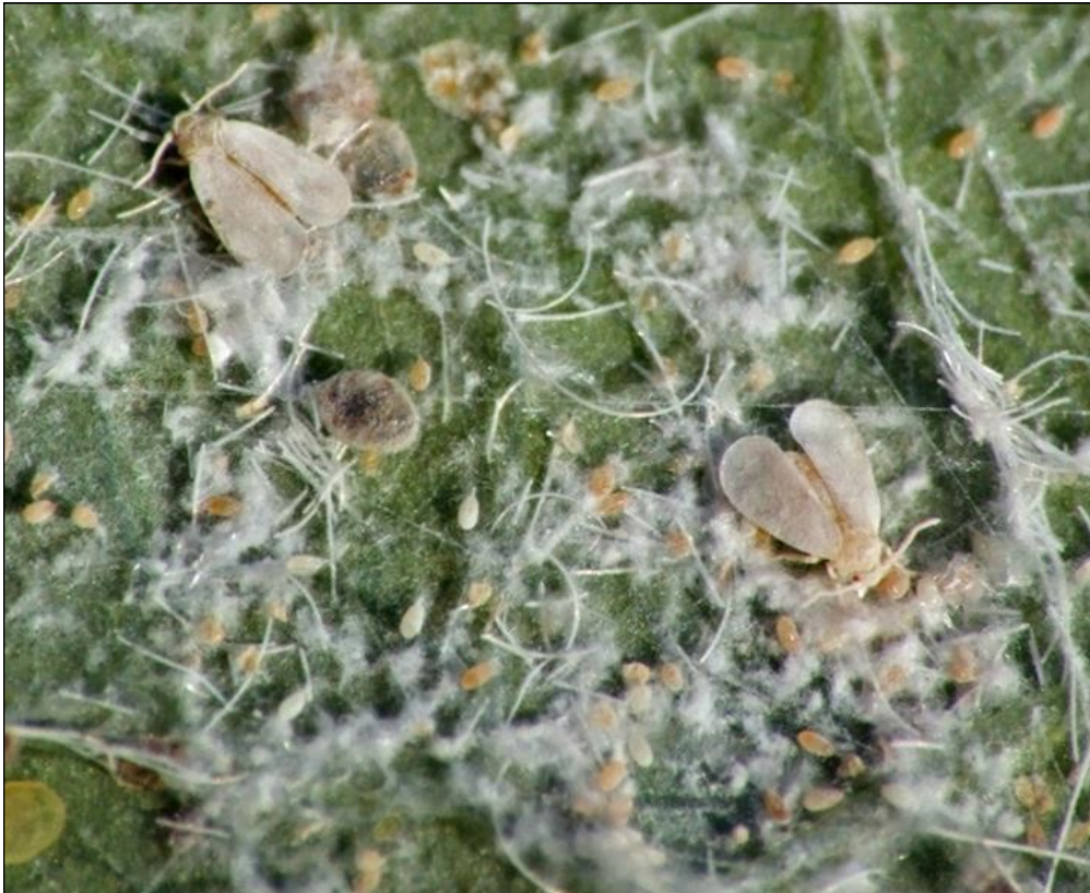
Entomopathogenic fungi being used to control whiteflies.

A high-magnification image of the spores and spore-bearing cells of the same fungus, Beauveria bassiana , taken from a Diabrotica beetle in Oregon.