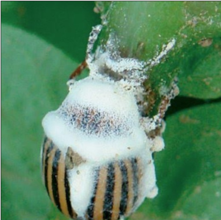
A Colorado potato beetle infected with EPF.

There are several fungal genera that are being studied for use as biological insect control agents. These