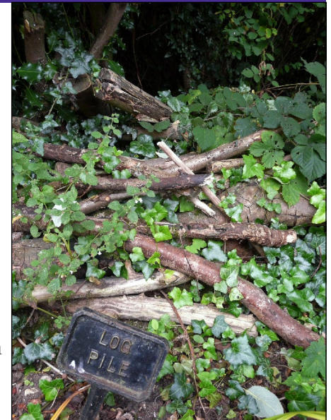
Create habitat with natural materials.

3. PLANT NECTAR FLOWERS. All butterflies, hummingbirds, bees and other beneficial pollinators need large amounts of nectar this time of year. Mallows, swamp sunflowers, ironweed, goldenrod and field asters are well known native nectar plants. Zinnias and snapdragons are popular cultivated nectar flowers.