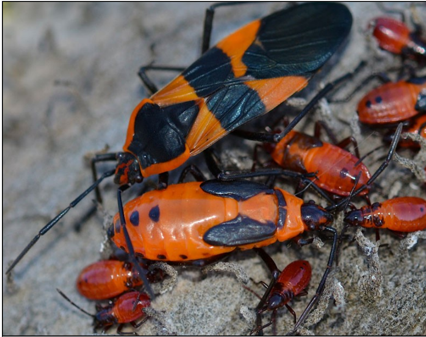
A cluster of adult and juvenile large milkweed bugs in various stages of growth.

eye. In our area, they can breed year-round if the weather stays warm enough. Northern populations are migratory, just like monarchs, and follow the milkweed northward as it grows and matures, moving south again as the cool weather decreases milkweed availability. Migration seems to be triggered by milkweed flowering and temperature.