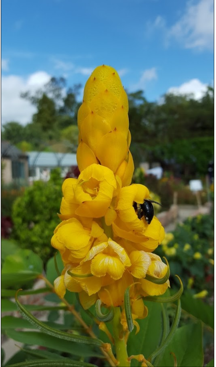
A carpenter bee collects pollen from a candelabra flower.

butterfly larvae on flowers, leaves, and stems. The yellow flowers will attract pollinators looking for nectar. Try planting a Candelabra plant and see what visitors it will bring to your garden!