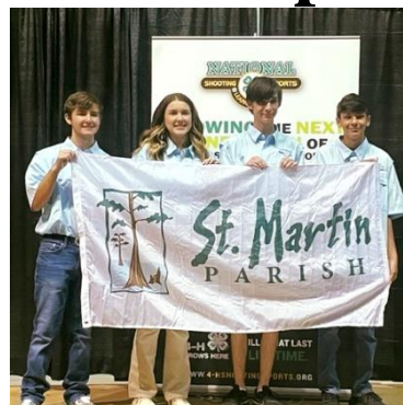
4H Shooting Sports National Competitors