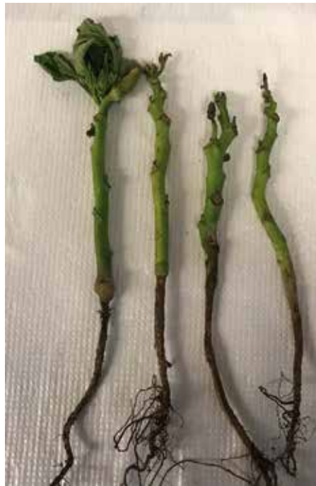
Figure 4. Okra Phytophthora root rot.