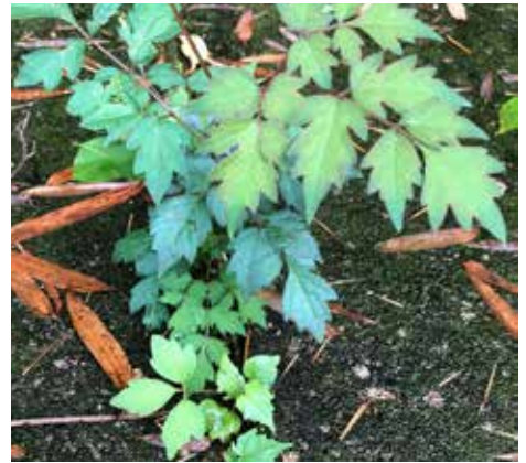
Young leaves of peppervine are often mistaken for poison ivy.