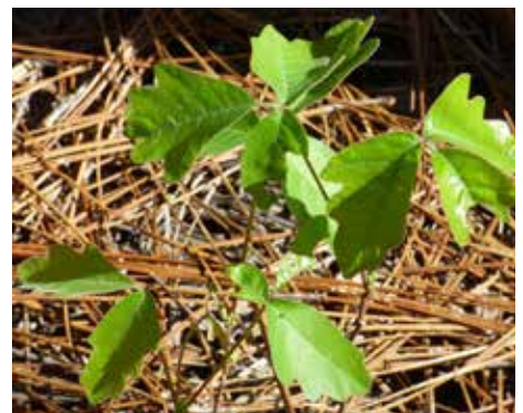
Leaves of poison oak are divided into three leaflets, each of which closely resemble oak leaves.