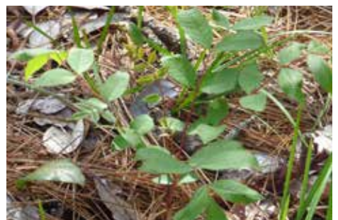
Poison sumac has pinnately compound leaves and is mainly a wetland plant.