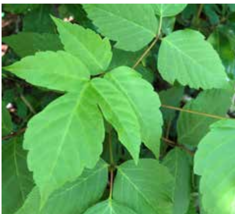
Leaves of poison ivy are divided into three leaflets.