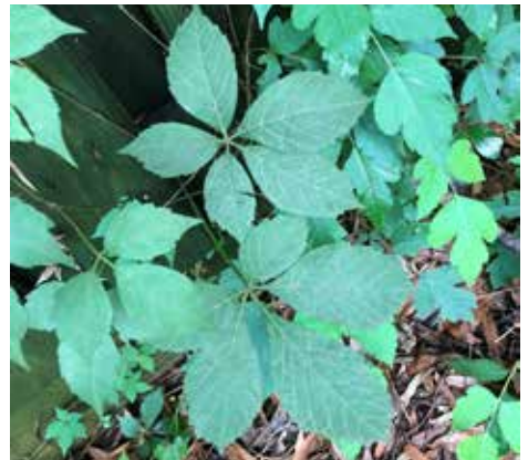
Leaves of Virginia creeper have five leaflets as opposed to three leaflets of poison ivy.