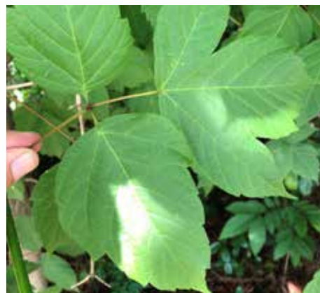
The leaves of box elder, a riparian tree, closely resemble those of poison ivy.