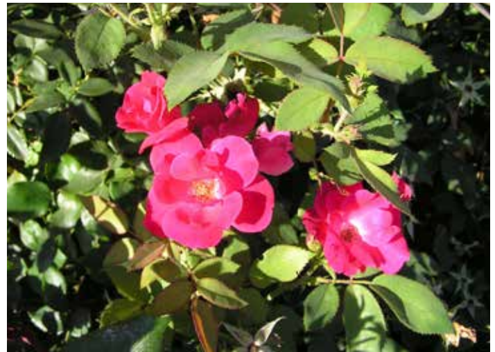
Knock Out Roses provide color throughout the long hot summers of Louisiana's NE Region.