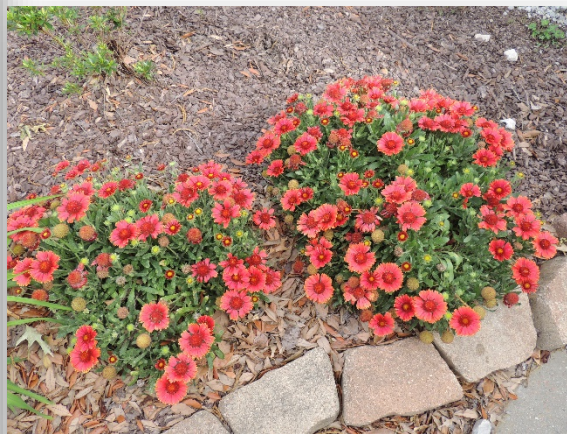
Figure 2. blanket flower