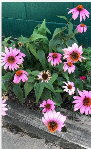
Figure 7. purple coneflower