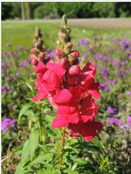
Figure 9. snapdragon