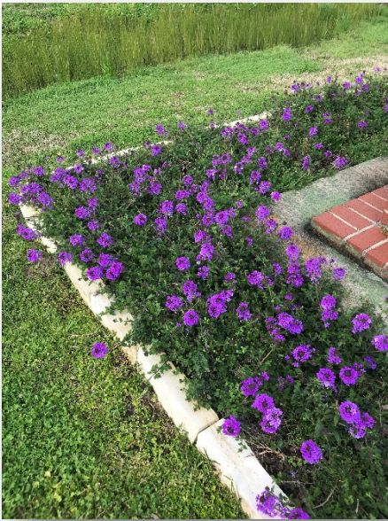
Figure 4. verbena