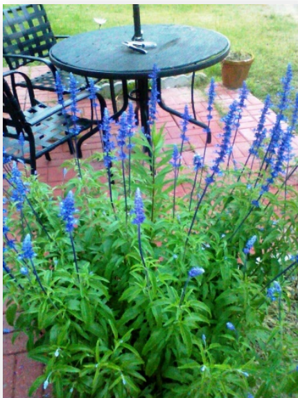
Figure 1. blue salvia

*I will say this about snapdragons & petunias: although they are technically annuals in our region, when planted in the right microclimate, they will act as short-lived perennials. So, if you have one or two that are performing exceptionally well at the start of the summer, and you just cannot bear to pull them up, just leave them. Dead head old blooms, fertilize lightly, water heavily, and if it survives the intensity of the summer, it will most definitely survive the winter. Enjoy watching it spring back to life when everything else is going into dormancy.