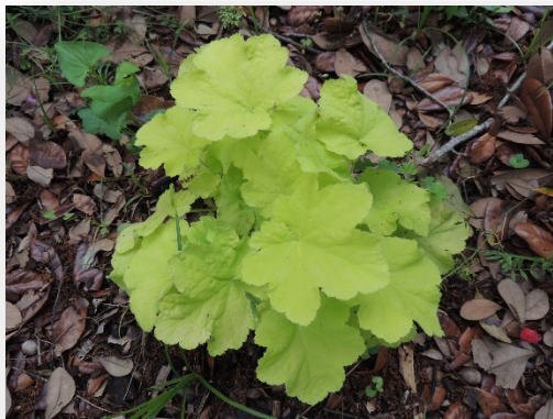
Figure 6. coral bell