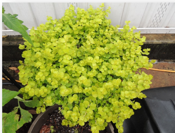
Figure 10. creeping jenny