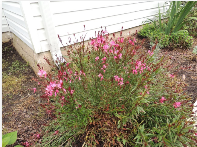
Figure 5. pink gura