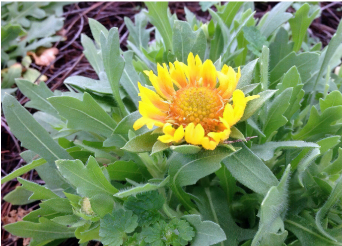
Mesa gaillardia is a perennial and usually withstands typical Louisiana winters.