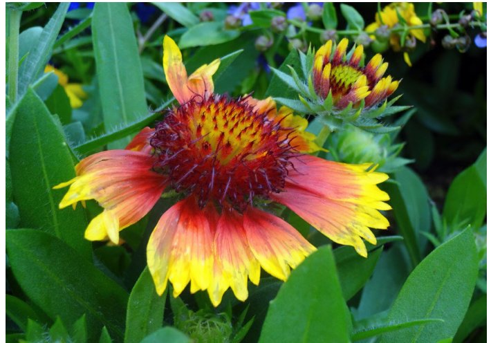
Bicolor varieties of the Mesa series gaillardia can add a splash of color to any landscape.