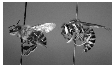
Honeybee and Yellow Jacket

Many people, in the excitement of being stung, do not carefully observe the attacker.