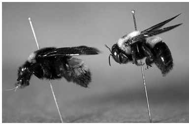
Bumble bee and Carpenter