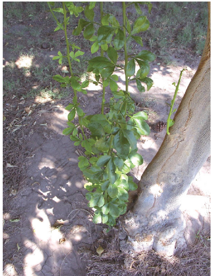
Figure 3. Rootstock suckers. Note trifoliate leaves.

When sprouts originate from the trunk below the bud union, they are part of the rootstock, and can sometimes be identified by their leaf shape which is often, but not always, different than that of the variety (Figure 3). Sprouts with trifoliate leaves are always part of the rootstock. Rootstock sprouts, when allowed to grow, have excessive thorns, grow fruit that are often unpalatable, tend to flourish at the expense of the variety, and make harvest of the desirable