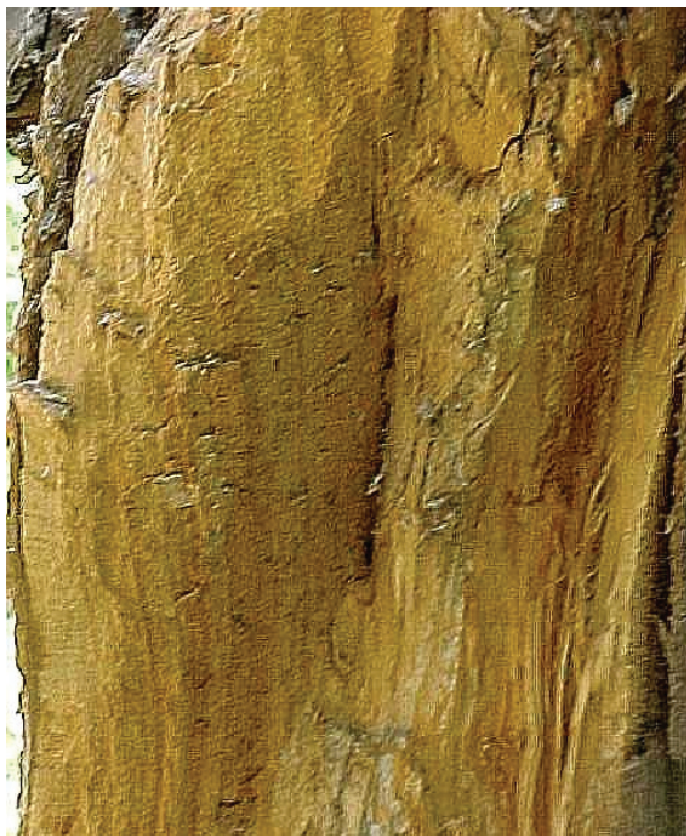
Figure 6. Diseased citrus wood with dark staining.

Diseased branches should be cut back or removed completely. If the affected branch is to be cut back, be sure that the cut is made into healthy wood. Healthy wood is whitish-yellow, the color of a manila folder. Any darker wood visible at the cut is an indication that disease still exists (Figure 6).