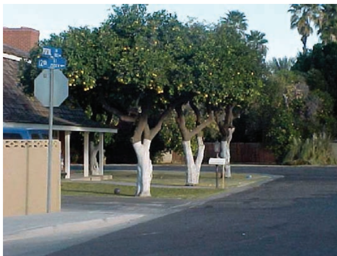
Figure 4. Skirted trees.

When cutting branches over 1½ inch in diameter, use a 3-part cut. (Figure 5) For the first cut, choose a location 6 to 12 inches out from the collar. Saw through about 1/3 of the branch starting from the underside. This is called the undercut, and will keep the bark from tearing. Then, remove the weight of the branch by making a second cut about 3