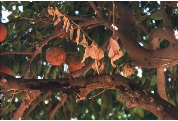
Figure 1. Hendersonula damage to citrus limbs.

to the harsh summer sun. It is not generally recommended to prune citrus from May through the middle of October since exposed limbs and trunks can be damaged by intense sunlight, possibly leading to sunscald or an infestation of Hendersonula bark rot (sooty mold); a disease for which there is no cure other than limb removal (Figure 1). We recommend summer removal of large limbs and large sprouts only in cases where damage is present, and where further delay would lead to additional injury. Whenever and wherever trunk or limbs are exposed to the sun, they should be protected with white paint (See Protecting the Tree on page 4).