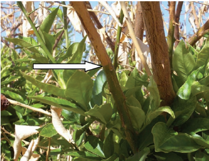
Figure 2. Freeze-damaged lemon branches. Note the delineation between live and dead wood at the arrow.

If trees have been damaged by a freeze, it is best not to prune them immediately. Loose, split bark and oozing are immediate signs of injury, but damage may be more extensive. Freeze-damaged trees will sometimes put out a growth flush which will die off in the late spring. New