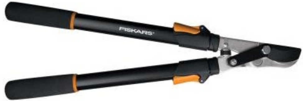
Loppers – Bypass best. Telescoping.