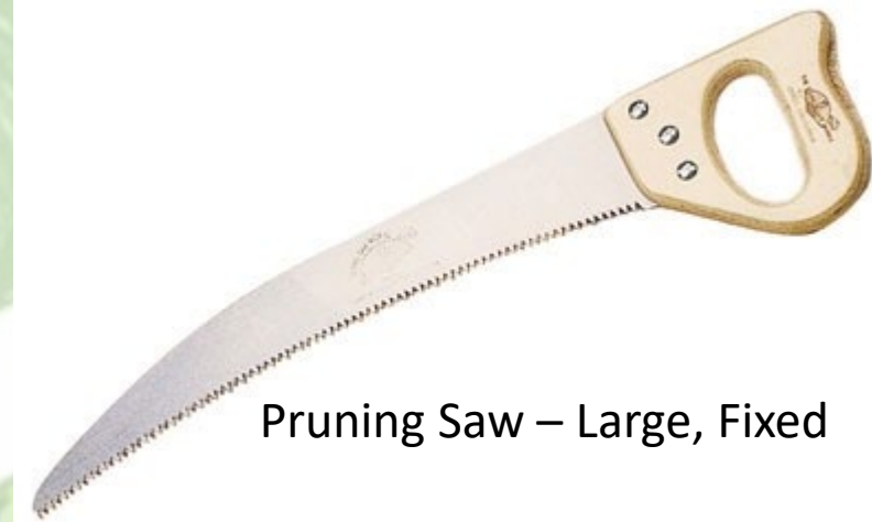
Pruning Saw – Large, Fixed