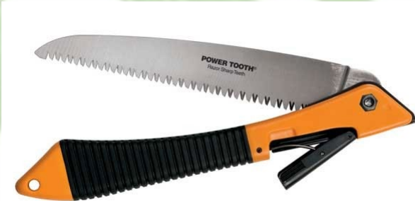
Pruning Saw - Folding