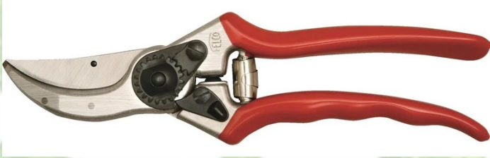
Hand Pruners – Bypass Best