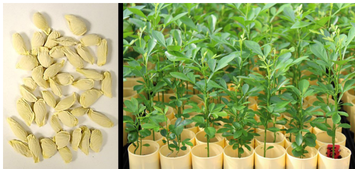
Figure 1. Citrus rootstock seeds and seedlings.

Seeds can be purchased or extracted from mature citrus fruit. To avoid introduction of any potential disease agent, fruit should be rinsed prior to seed extraction in diluted (20%) sodium hypochlorite (bleach). In addition, seeds should be disinfected, followed by a thorough rinse with water. A short treatment in dilute potassium hydroxide or overnight incubation of the seeds with the enzyme pectinase will remove any fruit tissue adhering to the seeds after extraction. After rinsing the seeds, they should be spread out evenly on non-stick paper or aluminum foil and completely dried without direct exposure to sunlight. Seeds can be planted directly, but this is not recommended as a drying period is generally required for optimal germination. Dried seeds should be placed in polyethylene bags and stored at 40–45°F (4–10°C). For long-term storage seeds should be treated with a fungicide. Seeds should be planted at a depth of ¼ to ½ inch in suitable pots or flats containing sterile potting medium. Removing the seed coats, or soaking seeds in aerated water for about eight hours just prior to planting, can reduce the time required for germination and seedling emergence. Under ideal conditions (sunlight, warm soil, and sufficient moisture), emergence will occur within 2–3 weeks after planting (Figure 1). Plants should be trained to a single stem (no branches within 6–8 inches of the soil).