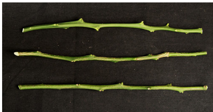
Figure 3. Budwood.

After budwood is cut from the tree, the undesirable wood and/or growth flush should be discarded and the remaining budwood trimmed to 8 to 10-inch lengths (Figure 3). Leaves should be cut off, leaving a stub of the petiole about ⅛ inch long to protect the bud. Trimmed budsticks should be labelled as to cultivar, date, and budwood source. Although budwood can be stored in the refrigerator for 1–2 weeks after placement in polyethylene bags, it should be used as soon as possible.