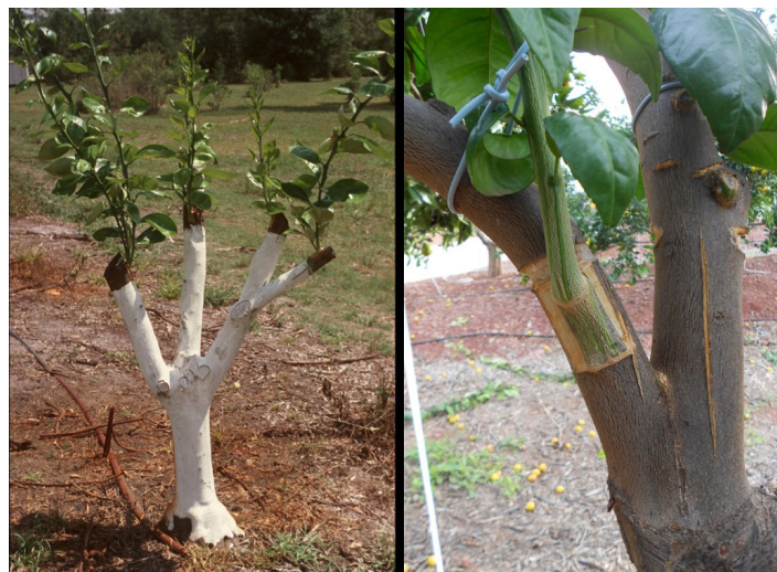
Figure 11. Top-worked trees.

the T bud method. Remove unwanted buds and sprouts to insure that only the desired scion buds grow. If limbs are so large that budding would be difficult, prune back to major scaffold limbs, removing the entire top (caution: severely pruned trees should be whitewashed to prevent sunscald). After limbs sprout back and mature a bit (6 months or so), the sprouts can be budded as initially described, using 4–6 of the stronger sprouts on each limb (Figure 11).