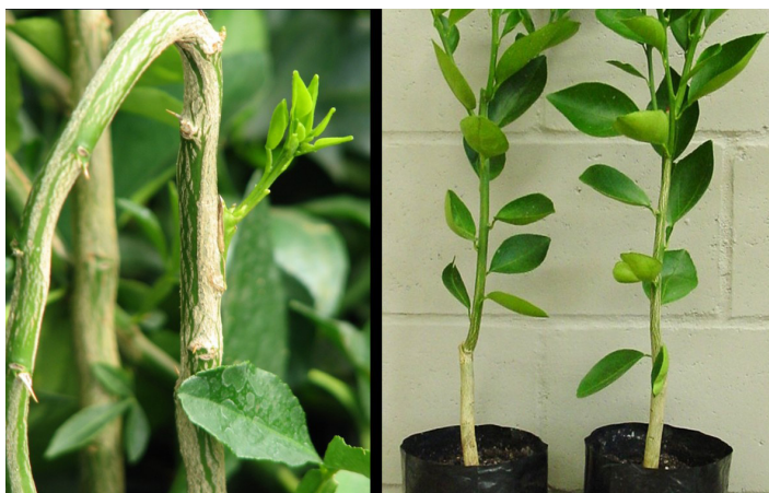
Figure 9. Buds beginning to grow (left) and finished trees (right).