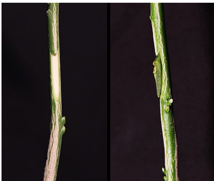
Figure 7. Chip budding.

Chip budding requires slightly more skill than T budding and is usually done whenever the bark of the rootstock plant is not slipping or has become too thick to T bud. The chip bud is cut while holding the budstick with the apical end toward the budder. A thin slice of wood with a scion bud is removed by making a smooth upward cut about 1 inch long and just into the wood. A second cut is made at the top of the first cut, forming a notch. A chip is removed from the rootstock in a similar manner (Figure 7) and the scion bud is placed on the cut to match the cambium. Cambial tissue is a thin layer between the bark and the wood of a tree. This is an area of active cellular growth of a tree. Because only two thin lines of cambial tissue are available for healing on both the scion bud and rootstock, it is important that matching on both sides occurs whenever possible. The scion should be wrapped as described for T budding so that all cut edges are completely covered.