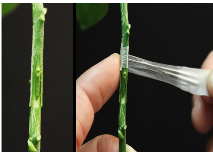
Figure 6. Inserting the bud (left) and wrapping the bud (right).

The bud should be immediately inserted into the stock; the cut surface of the bud should not be allowed to dry. Slide the bud shield (the bud with associated bark and wood) under the bark flaps of the rootstock with the cut surface flat against the wood of the rootstock plant. The bud shield should be completely enclosed in the T incision (Figure 6).