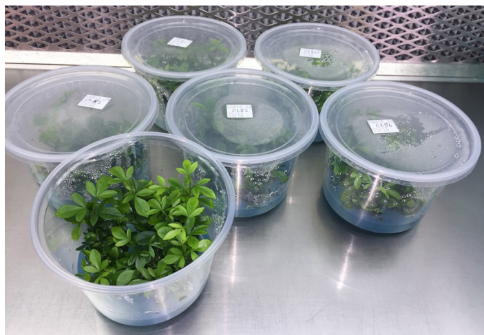
Figure 13. Micropropagated rootstocks.

Advances in methods for vegetative propagation of citrus rootstocks through tissue culture (micropropagation) have now made it possible to economically produce large numbers of genetically identical plants from rootstock selections. The starting material for establishing micropropagated plants varies depending on the preference of the nursery, and can consist of nucellar embryos or buds, both of which must be derived from disease-free foundation trees. The explants are placed in an agar-nutrient medium which may contain a small amount of growth regulators to accelerate plant regeneration. Once plants are regenerated, they are subcultured every few weeks on a fresh agar-nutrient medium to generate multiple shoot clusters (Figure 13). After an elongation phase, clusters are separated into individual shoots. Depending on the preference of the nursery, individual plants are then either rooted on agar medium before transplanting or directly rooted into potting medium. After an acclimatization period under high-humidity conditions, young plants can be managed using the same procedures applied for seedlings. Use of tissue culture allows the rapid propagation of large numbers of identical and disease-free plants, and has become routine for many fruit crop systems.