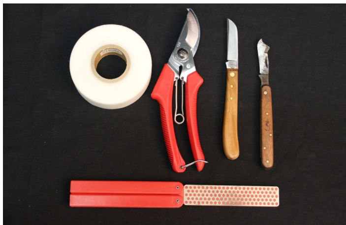
Figure 4. Budding tools. From left to right: budding tape, hand pruner, budding knives. Bottom: sharpening stone.

The most important tool for successful budding is a razor-sharp budding knife, which can be purchased at specialty stores or at garden supply stores (Figure 4). A smooth, clean cut is necessary to allow for a smooth contact between the scion and rootstock during the healing process. In addition, a sharpening stone and honing oil are needed to prevent the blade from becoming dull with use. The purchase of a diamond sharpening stone will eliminate the need for use of oil. Polyethylene budding tape (available in clear or green) is used to wrap buds to prevent drying and promote bud union formation. Using clear tape allows for observation of the bud union during the healing process.