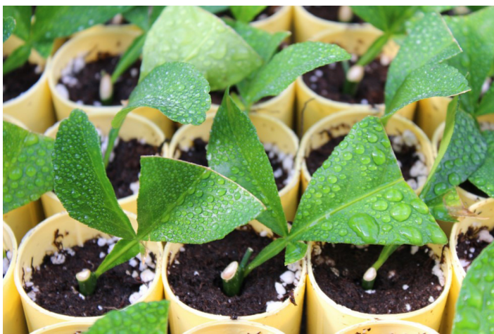
Figure 12. Rootstock cuttings.