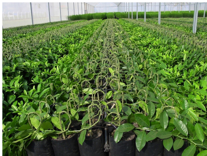
Figure 8. Bending of rootstock liners to force buds.