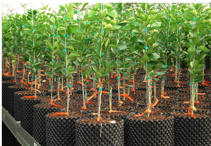
Figure 10. Field-ready trees.