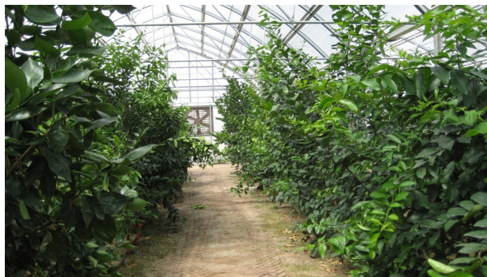
Figure 2. Budwood trees.

budded should be pruned clean of thorns and twigs. The preferred budding height is 6–8 inches above the base of the stem.