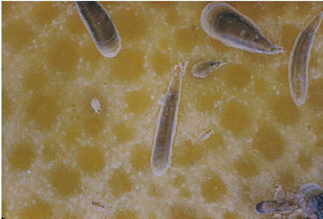
Figure 2. Glover scale, upper right corner contains a purple scale for comparison.

Glover scale is sometimes referred to as long scale. The scale covering is brown, elongated, narrow in width and about 3 mm in length (Fig. 2). The glover scale is similar to the purple scale and can be found in mixed populations. Glover scales infest leaves, twigs, woody bark, and fruit. When found on woody bark, they orient with the grain of the bark and parallel to one another and are frequently difficult to detect (Fig. 3). Glover scales are usually kept under biological control by Aphytis parasitic wasps.