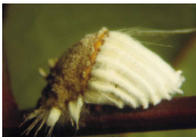
Figure 10. Cottoncushion scale.

Early immature stages of the scale cause the greatest damage on citrus while extracting plant sap during feeding along the leaf midrib and on green twigs. Later stages migrate to the larger twigs, where they feed and secrete honeydew from which sooty mold grows. Heavy infestations may result in defoliation, twig dieback, and fruit drop. Cottoncushion scale can be found on many species of ornamental plants as well as on citrus.