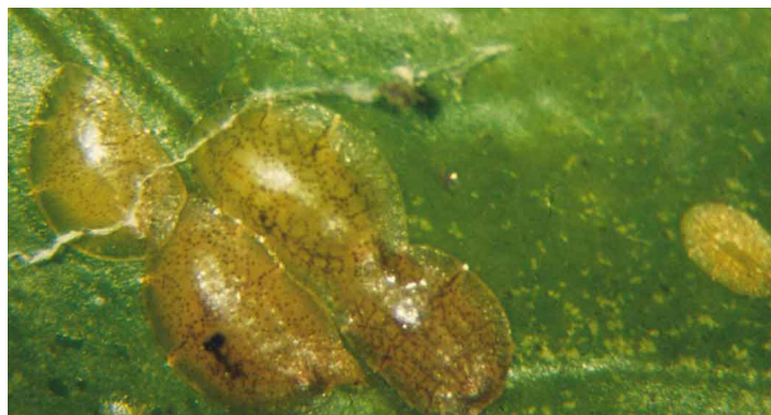
Figure 11. Soft brown scale.

The scale is heavily parasitized by several different species of parasitic wasps.