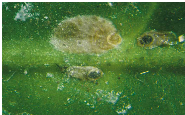
Figure 8. Chaff scale.

the shape of the area where it begins development and will develop successive layers resembling grain chaff. The color is brownish to grayish. The female body, eggs, and crawlers are purple in color. Immature and male scales resemble the female but are smaller in size. Chaff scale is found on bark, leaves, and fruit. When fruit is infested, the areas around the scale remains green at maturity. Chaff scale can also be found under the calyx of the fruit. When found on the leaves, the midrib is a favored site for settling. Chaff scales are difficult to remove from the fruit surface in normal packinghouse operations. Effective biological control is provided by the parasitic wasp, Aphytis hispanicus (Mercet).