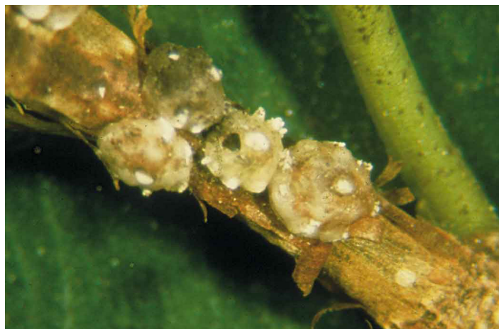
Figure 12. Florida wax scale.

The adult female is covered with a thick layer of soft wax, about 2 to 4 mm in length and 1 to 3.5 mm in width. Males are unknown in this species. Florida wax scale is highly convex, somewhat angular, and oval. The color is white, sometimes with a pinkish cast, becoming dirty white with age (Fig 12). Eggs are pink to dark red and are found under the scale's wax covering. Crawlers are pink, migrate away from under the female's wax covering, settle, and begin to extract sap from leaves or twigs. Young scales have a similar wax covering. Large amounts of honeydew are secreted by this species. Immature stages of Florida wax scales are found on the leaves and twigs with older stages frequently found on twigs and branches. Leaf populations are aligned with the leaf midrib. Florida wax scales are seldom found in large numbers due to presence of effective natural enemies.