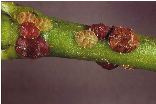
Figure 9. Caribbean black scale (various stages).

two months in cooler weather. Newly hatched nymphs are bright red with dark antennae. Total length of the scale, including the egg sac, is 10 to 15 mm.