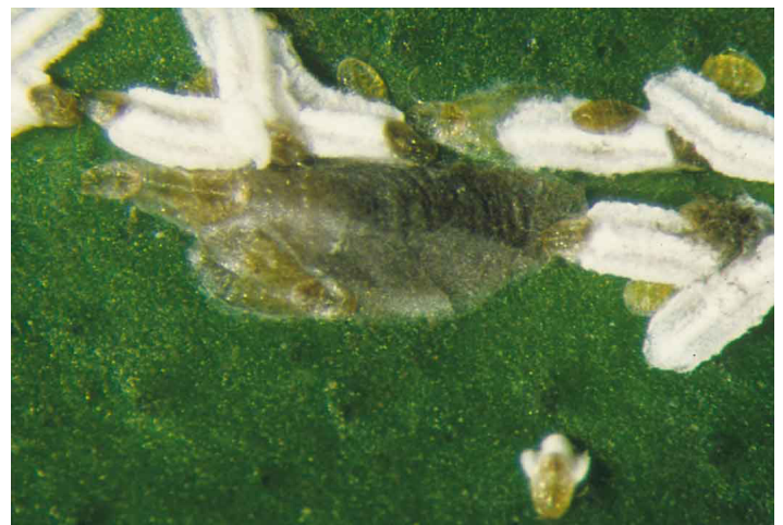
Figure 5. Snow scale, male and females.

The adult female is 1.5 to 2.25 mm long. The female armor is shaped like an oyster shell, with a central longitudinal ridge. It is brownish purple to black, with a grey border. Beneath the outer covering is an elongated orange-yellow membranous scale body. The immature male scale armor is white with parallel sides and three longitudinal sections, one central with two marginal ridges (Fig. 5). The adult male is winged and light yellow. The crawlers are oblong and light orange to reddish in color.