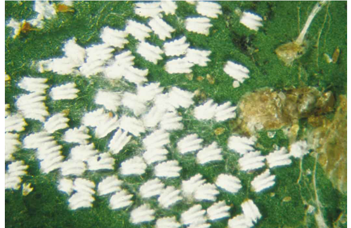
Figure 4. Fern scale.

but not on large limbs or trunks. This scale has a wide host range and is found throughout Florida, but never causes economic damage to citrus.