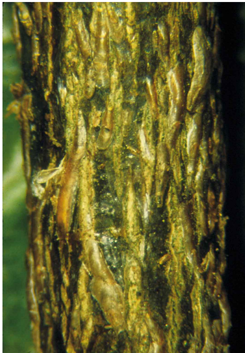
Figure 3. Glover scales on bark.