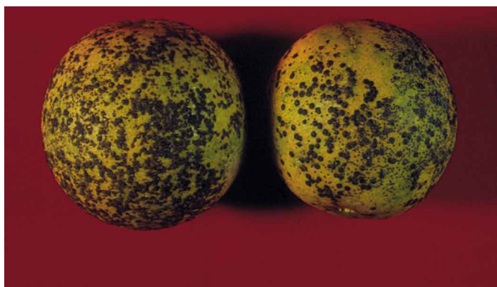
Figure 7. Florida red scale on fruit.

Florida red scale is under biological control by the introduced parasite, Aphytis holoxanthus (DeBach). Some additional insect predators feed on Florida red scale.