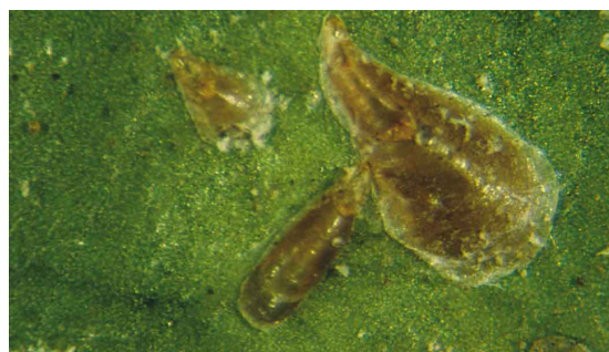
Figure 1. Purple scale.

The armor of the adult female scale is 2 to 3 mm long, purple to dark brown, elongated, and usually curved (Fig. 1). The armor of the male is much shorter and more slender than the female. The eggs are found under the scale cover and after hatching, the pearl white crawlers are less than 0.25 mm in length. Infestations may occur at any time, but are usually highest during the spring. Purple scales prefer a tree with a dense canopy and are found on leaves, twigs, and fruit. In most cases chemical control is not required as biological control by a parasitic wasp, Aphytis lepidosaphes Compere and the ladybeetle, Chilocorus stigma Say, provide adequate control. Other predators and parasitic fungi have also been found attacking the purple scales in Florida.