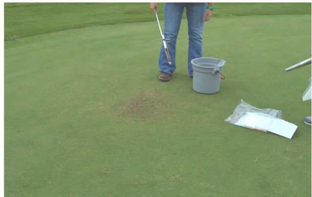
Collecting soil samples in plastic bag.