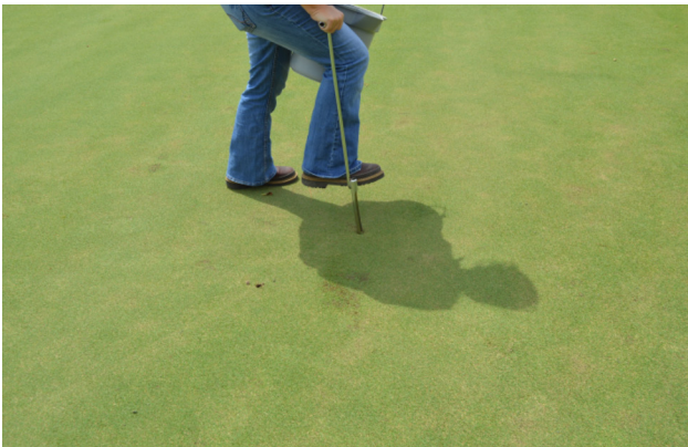
Using soil probe for sampling.