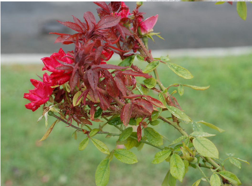
Figure 4. Abnormal discoloration and distortion of new foliage caused by Rose rosette disease.