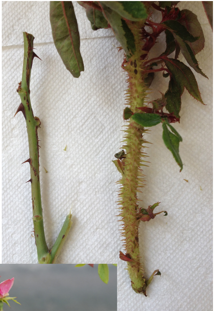
Figure 3. Canes infected with Rose rosette disease are thicker than parent cane (parent cane on left and infected cane on right).

Although Rose rosette disease produces unique symptoms on roses, those symptoms can be easily confused with symptoms caused by other diseases, pests, stresses and other factors. Improper use of herbicide such as glyphosate (Roundup and many other products), may result in distortion and clustering of new growth that looks like “witch’s broom” (Figure 5). Abnormal discoloration and distortion of new foliage has been constantly associated with Rose rosette disease, but feeding injury from chili thrips (Figure 6), which is a very significant rose growing issue in