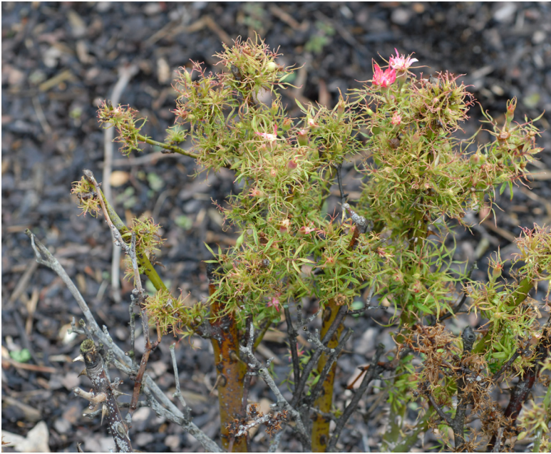
Figure 5. Distortion of new growth caused by glyphosate injury.

Louisiana, also cause similar symptoms (Figure 7). Similarly, excessive reddening of new growth is a normal character of some rose cultivars (Figure 8).