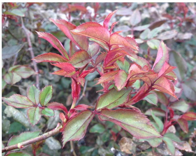
Figure 8. New growth with normal red pigmentation.