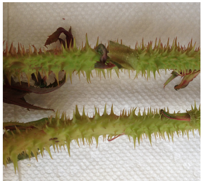
Figure 1. “Witch’s broom” symptoms caused by Rose rosette disease.

Infected roses produce a cluster of new shoots from a single point on the parent canes. The new shoots elongate rapidly and appears like “witch’s broom” (Figure 1). Infected canes produce excessive thorns that are green or red and soft in the beginning but later harden off as the disease progresses (Figure 2). Presence