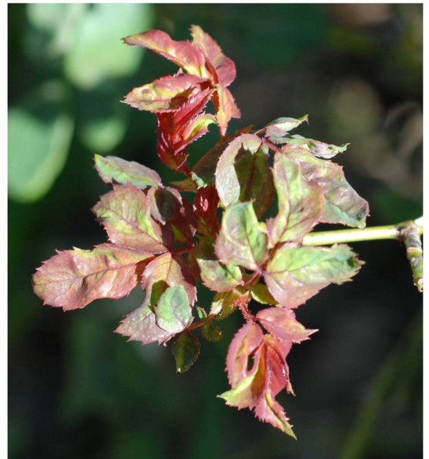
Figure 7. Distortion of new growth caused by feeding injury from chili thrips.

Rose rosette disease is transmitted by a tiny eriophyid mite, Phyllocoptes fructiphilus (Figure 9), or by grafting. The eriophyid mites crawl from plant to plant or move long distances with the wind. The virus is systemic and can persist in the live roots of infected rose bushes, but it is not soilborne. Grafting of virus infected scions on healthy root stock and vice-versa, may also result in the virus transmission.