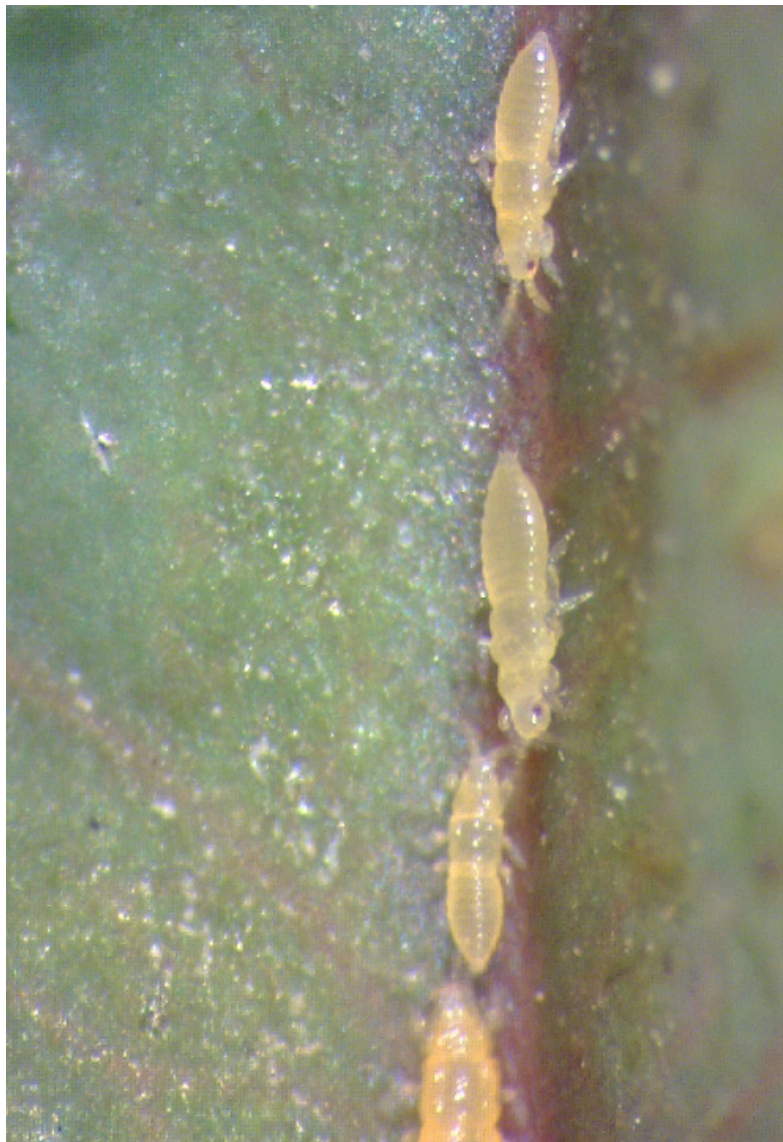
Figure 6. Chili thrips feeding on rose leaves.