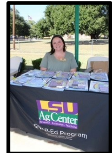
Franklin Parish Head Start Fall Festival & Health Fair