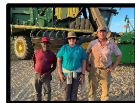
Cotton Core Block On-Farm Demo Harvest Beavers Farms

An Ag Tour for the Louisiana Delta Community College Franklin Parish Leadership Class was organized. We toured the Franklin Cotton Warehouse, the Miller's dairy, Goldman Equipment, the Sweet Potato Research Station, Anderson Grain Elevator and heard about the Franklin Parish catfish industry from Haring's Pride. The class members got an overview of the diversity of agriculture in the parish and the economic impact the industry has in the parish.