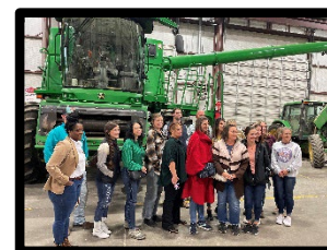
Ag Tour Franklin Parish Leadership Class