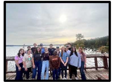
Regional Leadership Board Retreat