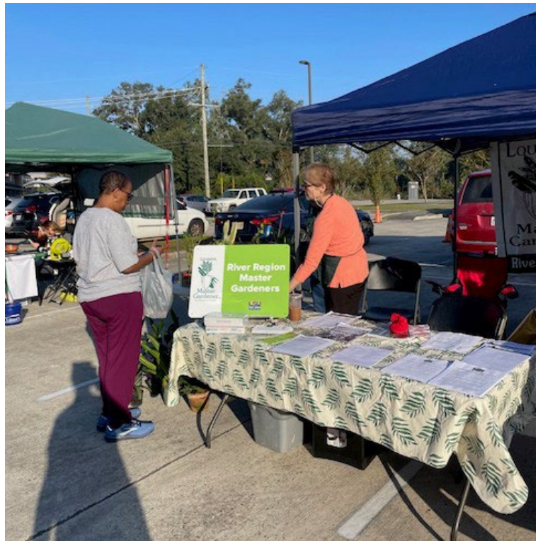
River Region Master Gardeners distributing plants and information at the German Coast Farmers' Market.

Upon successful completion of the training and volunteering for 40 hours, participants will become Certified Louisiana Master Gardeners.