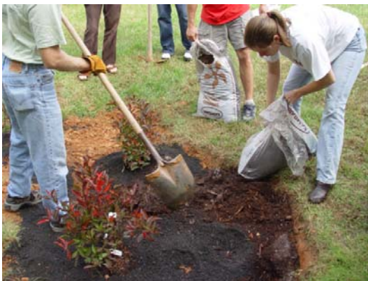
Mulch with 2-3 inches of hardwood mulch

Once the rain garden has been dug, planting can begin. It is important to note that plants in a rain garden will have to tolerate fluctuating levels of soil wetness. To help plants survive extended wet periods, it may help to plant the plants “high” on the edge of the rain garden or on mounds within the rain garden to elevate the roots above the ponded water level. Associated plant lists are available for guidance in plant selection.