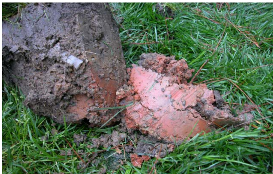
An example of a wetland soil

If you see any of these signs, then your garden will need to be designed as a backyard wetland garden.