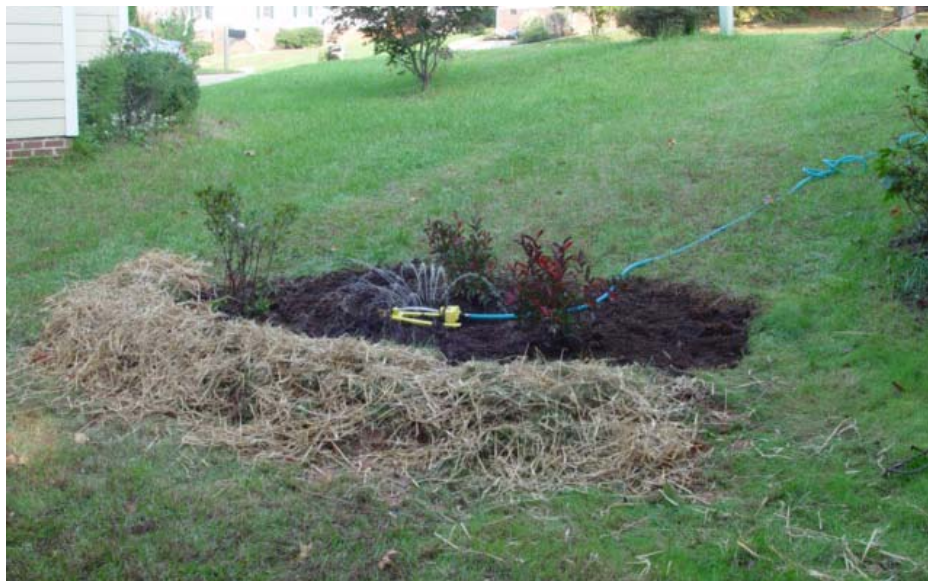
A newly completed rain garden

Finally, the area should be mulched with 2-3 inches of hardwood mulch. Lighter mulches will tend to float, so avoid pine bark and pine straw mulches. Mulch is important in pollution removal, maintaining soil moisture, and in preventing erosion.