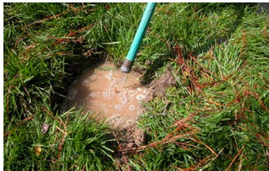
Perform a water (perc) test for impermeable soils. If water does not drain in 2 days time, consider installing a backyard wetland.