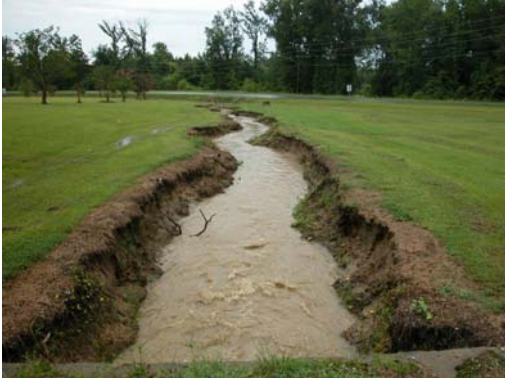
Streambank erosion can be caused by excessive stormwater flow

Backyard rain gardens are a fun and inexpensive way to improve water quality and enhance the beauty of your yard or business. Rain gardens are placed between stormwater runoff sources (roofs, driveways, parking lots) and runoff destinations (storm drains, streets, streams).