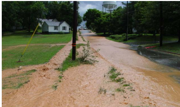
Stormwater runoff containing high sediment loads

In most cities, stormwater runoff does not go to a treatment plant. Instead, water and the pollution in it flow directly into streams and rivers. Upstream from you, stormwater runoff goes into the river from which you get your drinking water. Downstream, other cities use your stormwater runoff for drinking water.