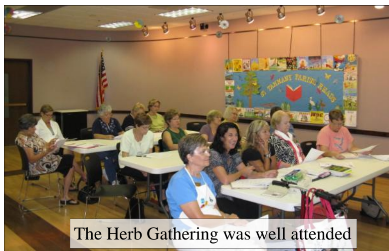
The Herb Gathering was well attended