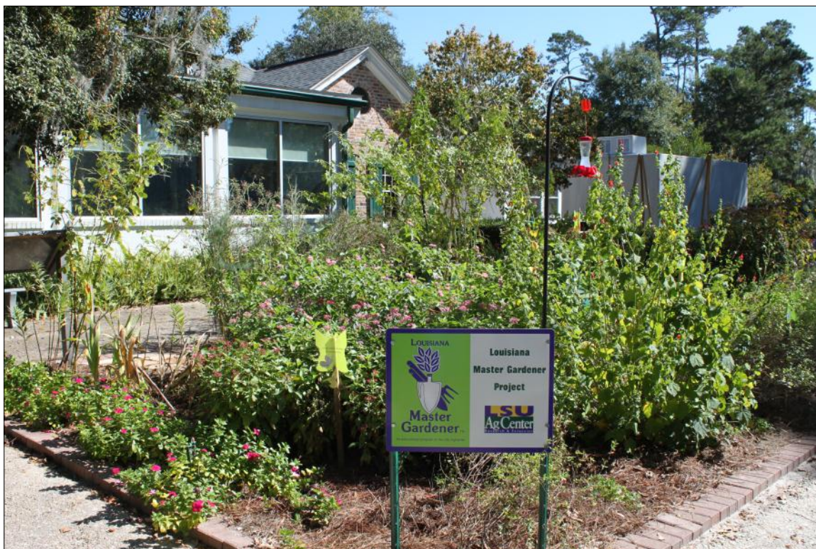
The Lacombe Butterfly Garden is located at SELA NWR on Hwy 434. This is just one of the many projects on the Tour of St. Tammany Parish Master Gardener Projects Tour.