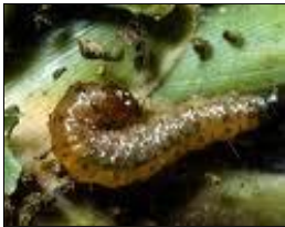
Tropical sod webworm

Keep a close eye for these insects through October. Watch for these insects and any other UFO’s ( U gly, F oreign, O ccupants) before it’s too late.