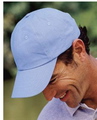
Big Accessories, 6 panel brushed twill unstructured cap, self fabric closure with d ring slider and tuck in strap. Colors available: Stone or Forrest $12.99