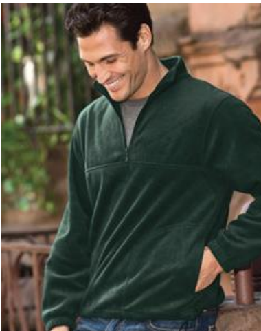
Harriton Men's Quarter Zip Fleece Colors Available: Hunter or Black $28.95 each 2XL & 3XL add $3.00