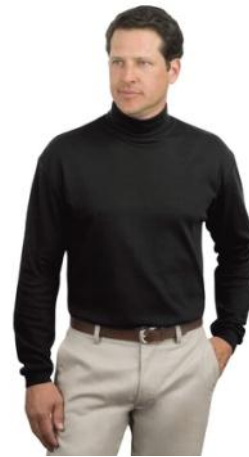
Port Authority Interlock Knit Turtleneck. Colors Availa- ble: White or Black $24.95 2XL & 3XL add $3.00