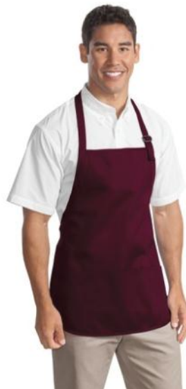
Medium Length Apron with Pouch Pockets Colors available: Hunter Green or Stone $14.99