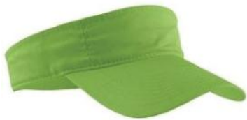
Port & Company Visor Colors Available: Khaki $11.99