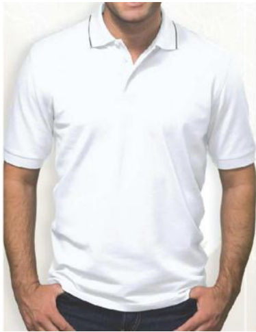
Colorado Timberline Men's Moisture Wicking Microfiber Pique Polo Shirt Antiroll collar, tag less label, vented waist. Colors available: Moss/white trim or Black $27.49 2XL add $2.00, 3XL add $3.00