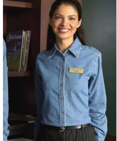
Harriton, Women's Long Sleeve Denim Shirts, 100% Cotton Denim Colors available: Light Denim or Dark Denim $25.99 2XL add $1.50