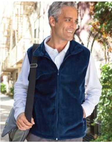
Harriton Fleece Vest Colors available: Hunter or Black. $24.95 each 2XL & 3XL add $3.00