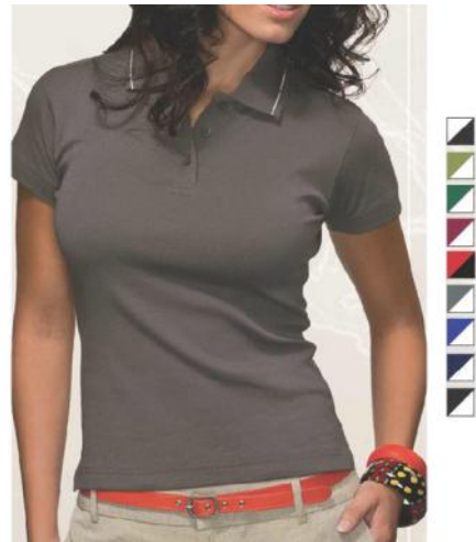
Colorado Timberline Women's Moisture Wicking Microfiber Pique Polo Shirt, Anti-roll collar, tag less label, princess seam for fitted look. Colors available: Moss/white trim or Black $27.49 2XL add $2.00, 3XL add $3.00