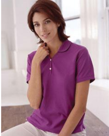
Devon & Jones. Ladies Pima Pique Short Sleeve Y Collar Polo 100% Peruvian Pima Cotton. Colors available: Stone or Forest $25.99 2XL-add $2.00, 3XL-add $3.00