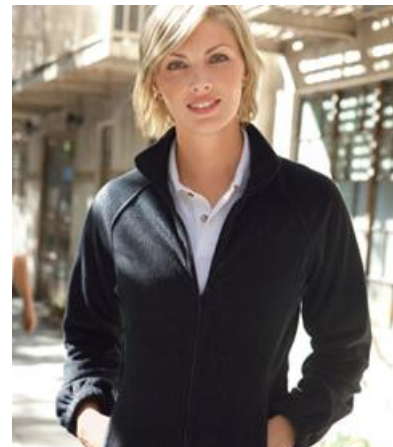
Harriton Women's Full Zip Fleece Colors Available: Hunter or Black $28.95