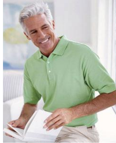
Devon & Jones. Men's Pima Pique Short Sleeve Polo, 100% Peruvian Pima Cotton Colors available: Stone or Forest $25.99 2XL-add $2.00, 3XL-add $3.00