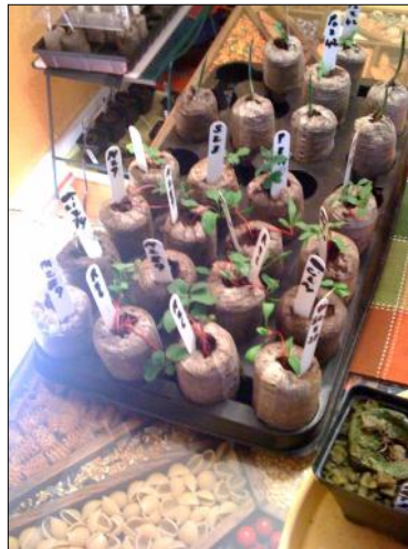
Seed germination in large peat pellets