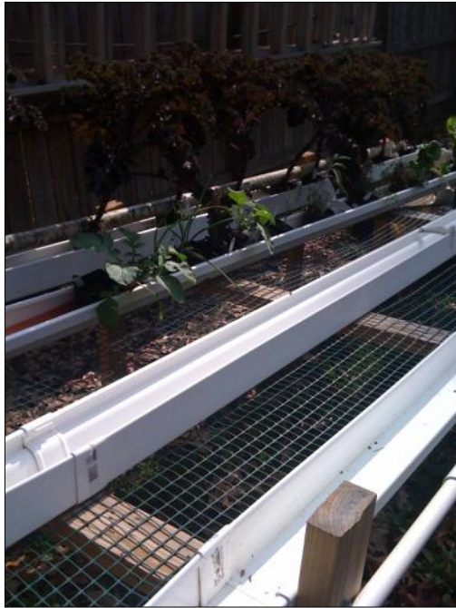
Kale and gutter system