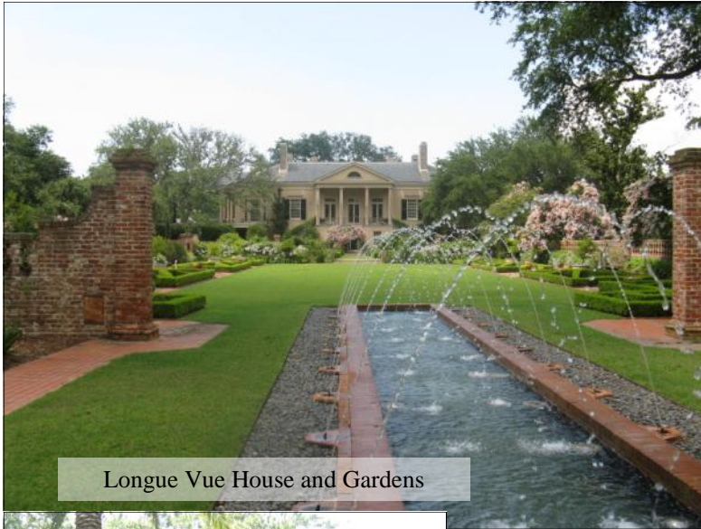
Longue Vue House and Gardens