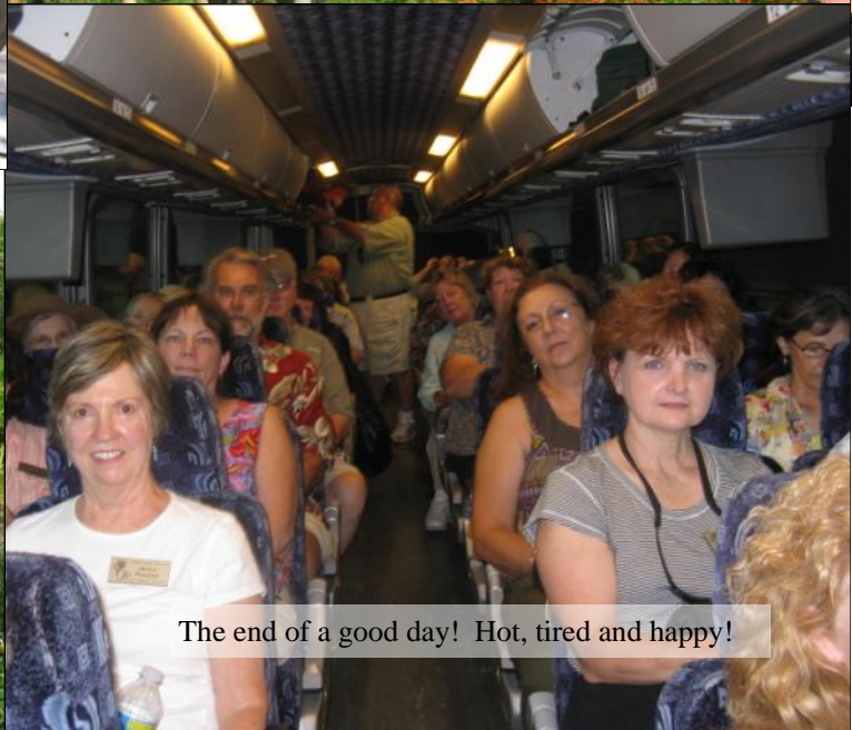
The end of a good day! Hot, tired and happy!