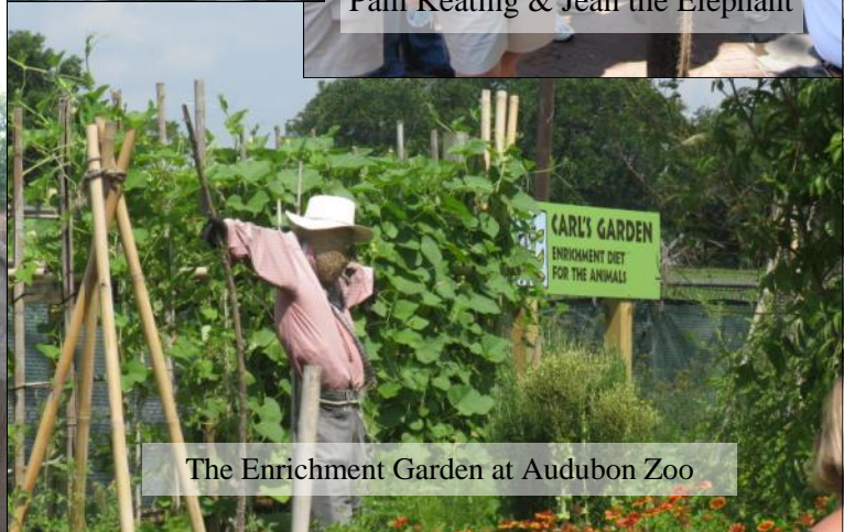
The Enrichment Garden at Audubon Zoo