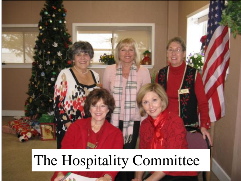
The Hospitality Committee