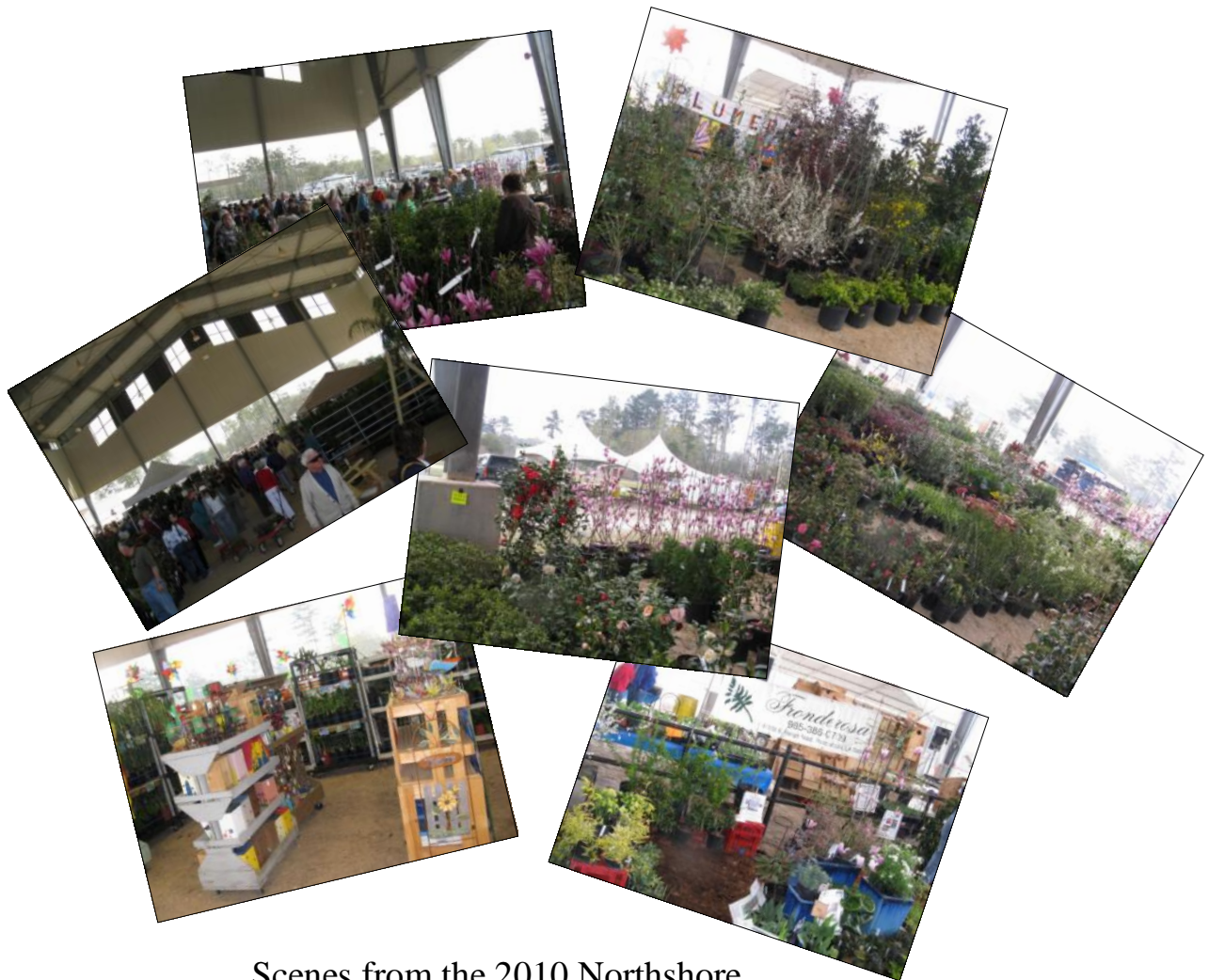
Scenes from the 2010 Northshore Garden Show and Plant Sale