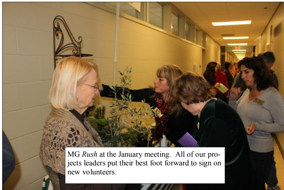
MG Rush at the January meeting. All of our projects leaders put their best foot forward to sign on new volunteers.