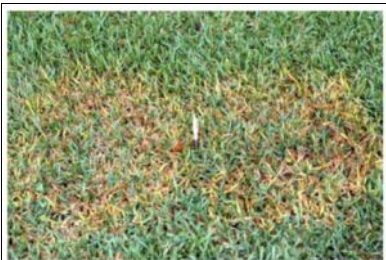
Brown Patch in St. Augustine