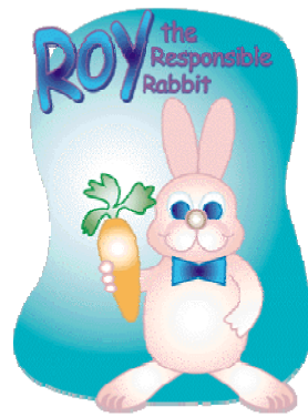
Roy the Responsible Rabbit says