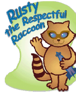
Rusty the Respectful Raccoon says