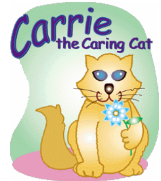
Carrie the Caring Cat says