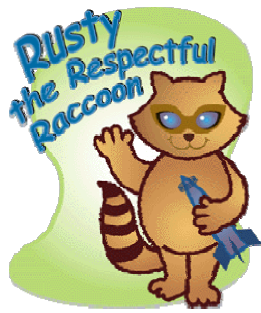
Rusty the Respectful Raccoon says