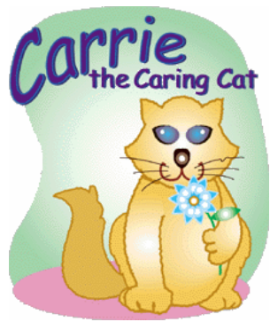
Carrie the Caring Cat says