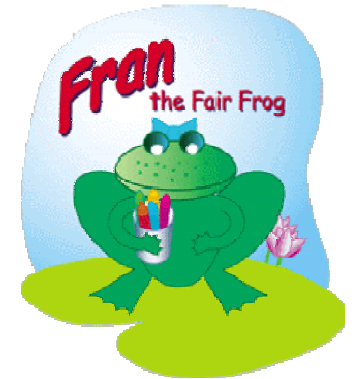
Fran the Fair Frog says