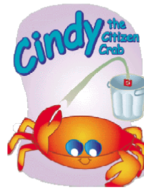
Cindy the Citizen Crab says