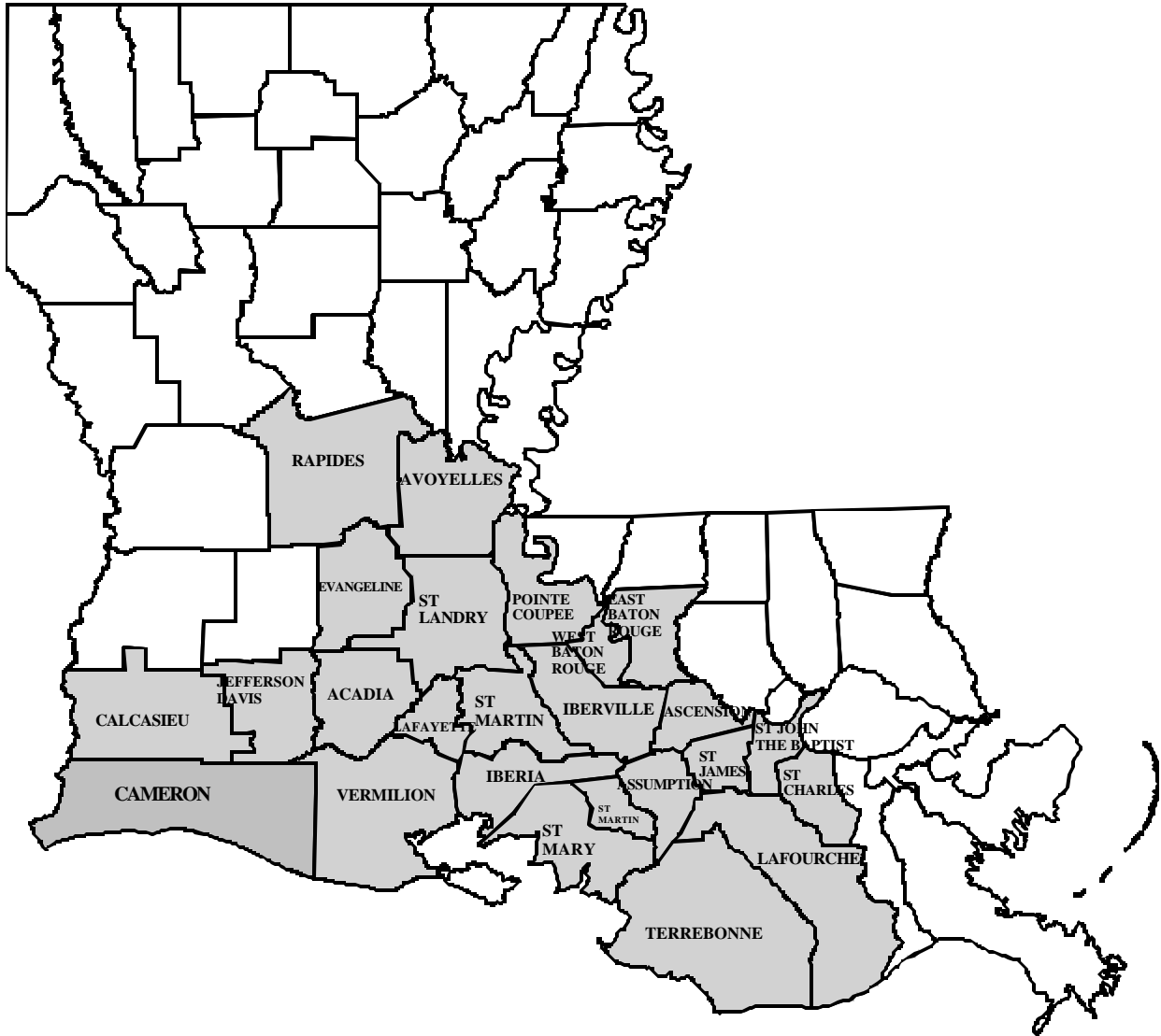
Figure 1. Parishes (counties) in Louisiana where sugarcane is grown.