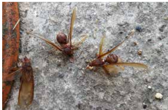
(Left) A recent photo of reproductive winged town ants.