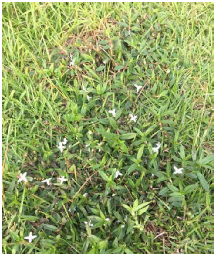
Virginia buttonweed begins flowering in mid-summer.