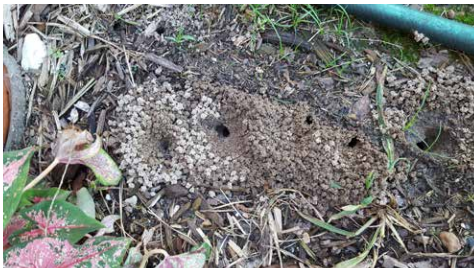
(Top) Entrances to a recent town ant infestation. Note the crater-shaped hills around the entrance hole.

Keith Hawkins Central Region Area Horticulture Agent