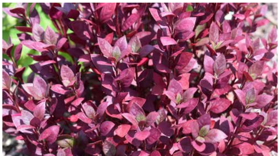
Little Ruby Alternanthera grows in the Louisiana Super Plant demonstration bed.