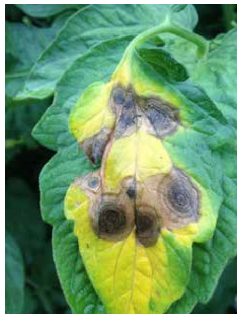
Figure 1. Tomato early blight.

Phytophthora root rot. Root and crown rots commonly affect plants in the home garden, particularly those in poorly drained sites with compacted soils. The first noticeable above-ground symptoms generally include wilting of the leaves, especially during the heat of the day, and stunting of the plants. Additional