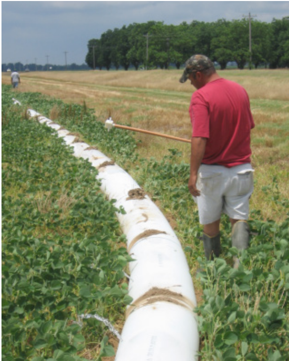
Computerized hole selection

lengths. Down-row uniformity means rows are watered evenly, reducing tail water and conserving water and energy.