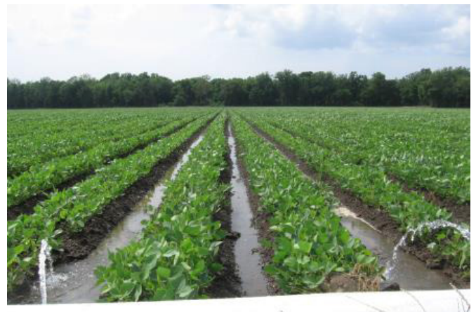
Applying water to alternate middles

Install a tail-water recovery system to increase irrigation efficiency. Capture the runoff water from irrigation and reuse it.