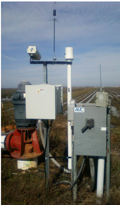
Irrigation pump monitor

Timers can be installed and set to turn wells off. This can help to reduce runoff, especially at times when it is not convenient for the manager to be there. In addition, pump monitors generally allow for remote operation and monitoring of pumps through the Internet and cellular connections.