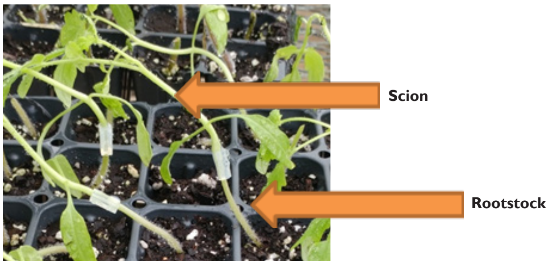
Fig. 1. Rootstock and scion wood.

all the common soil-borne diseases. In Louisiana, the major soil-borne diseases are bacterial wilt, root knot nematode, Southern blight and Fusarium wilt. When selecting a rootstock, other solanaceous crops such as eggplant and pepper can be considered. Eggplant rootstocks are preferred when flooding or waterlogged soils are common, as they can survive for several days under water. However, many types of pepper are incompatible with tomato, thus the graft survival rate will probably be low. Commercially available tomato rootstocks with reported disease resistance are listed in Table 1. Two eggplant varieties, MMI52 and EG203, are resistant to some strains of R. solanacearum from Louisiana that cause bacterial wilt. Additionally, variety EG195 had shown to provide substantive protection from root knot nematode, tomato Fusarium wilt and damage caused by flooding.