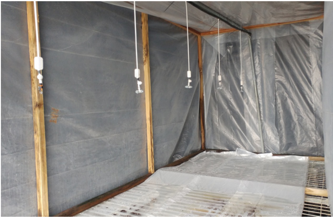
Fig. 3. Automatic irrigation inside the healing chamber, especially on larger models, is essential to maintaining high humidity.