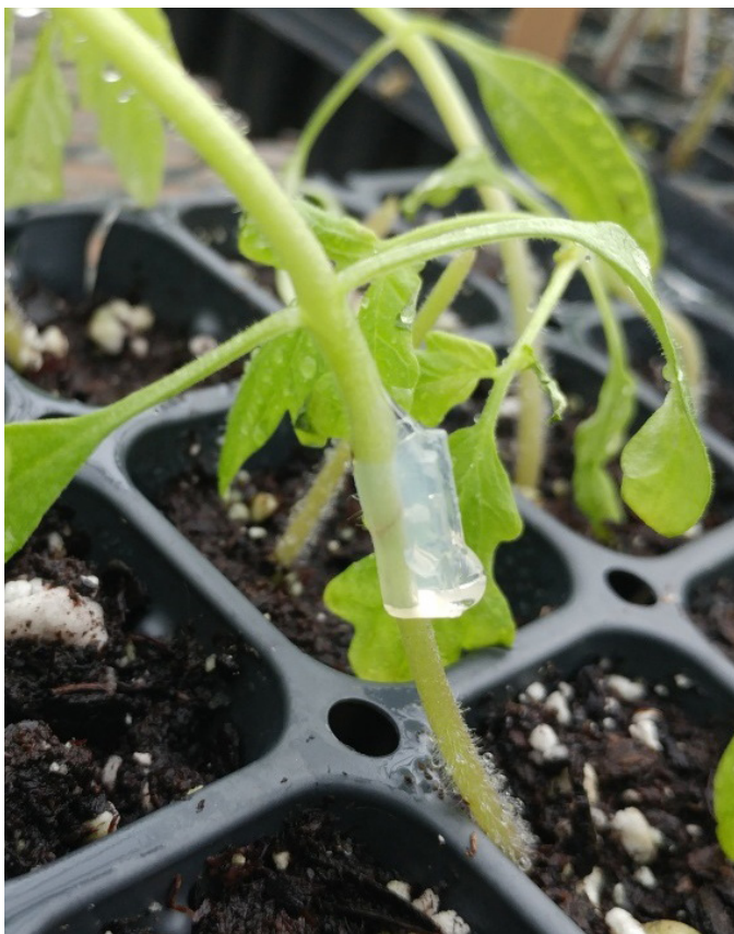
Fig. 2. Japanese tube (or top) grafting.

Grafting is done when the stem diameter of the seedlings is 1.5 to 2 millimeters (for Japanese tube grafting or Japanese top grafting) at the point where the cut will be made, and the seedlings have two to three true leaves. This stage of development usually occurs seven to 10 days after the seeds germinate or 14 to 16 days after sowing. Seedlings should be watered 12 to 24 hours before grafting. Avoid watering the seedlings immediately prior to grafting. Graft early in the morning or just after dark. At these times the seedlings are typically transpiring slowly. Ideally, the grafting process should take place indoors. If conducted outdoors, graft in the shade and when temperatures are moderate (between 50 and 80 degrees Fahrenheit) and it is not windy. If the cut surface of the scion or rootstock dries out, the graft will fail.