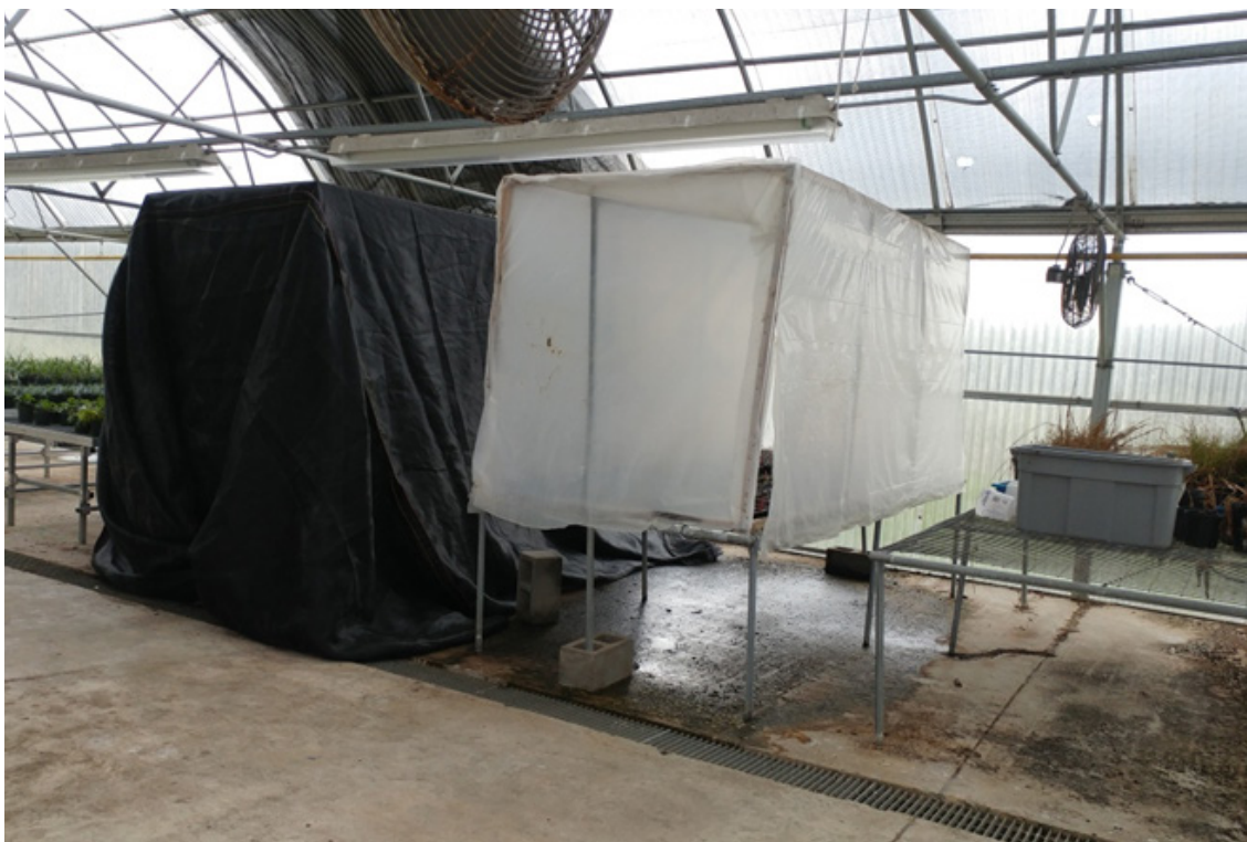
Fig. 4. Larger healing chambers are used in commercial production. Pipes are constructed in a frame above the bench and covered in plastic. Notice the dark shade cloth on the left. Remember the healing process requires a few days without light.

2. The seedlings should not be exposed to any light for the first three to five days. Three to five layers of 30 to 50 percent shade cloth is placed over the clear plastic layer, which is then encased with a solid dark colored tarp. After five days, the dark tarp can be removed along with one or two layers of the shade cloth. The remaining layers of shade cloth should be removed one day at a time. After all cloth is removed, expose seedlings to full sunlight inside the chamber. (Figure 4)