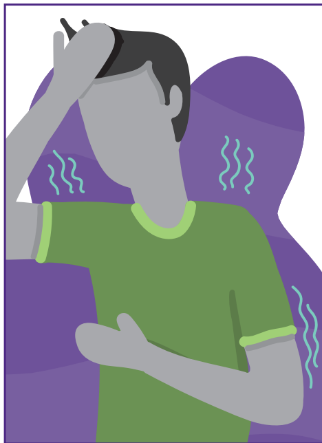
Muscle or body aches