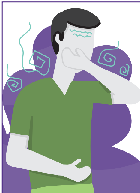
Vomiting or diarrhea