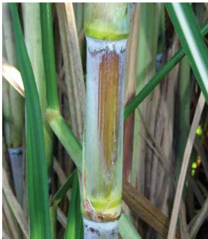
8. Distinguishing Characteristics –Bronzed stalk color with exposure to the sun and pink tinged leaf sheaths; moderate amount of leaf sheath pubescence.