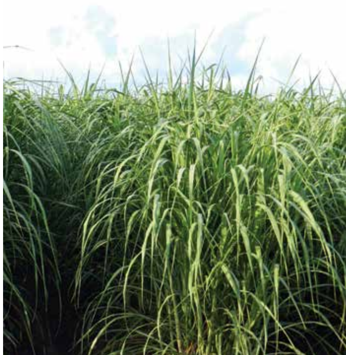
1. Canopy – drooping and spreading with distinct curling of leaf blades that mimics drought stress.