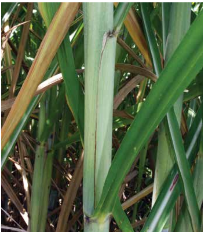
5. Leaf Sheath Margin – green with some thin purple margin edge occasionally.