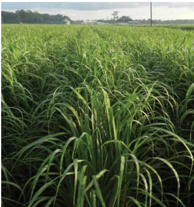
1. Canopy – rounded canopy.