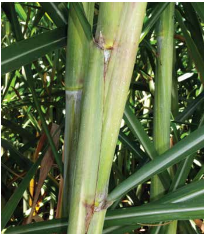
5. Leaf Sheath Margin – non-necrotic with purple edges on occasion.