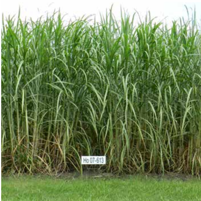
1. Canopy – slightly erect to rounded.