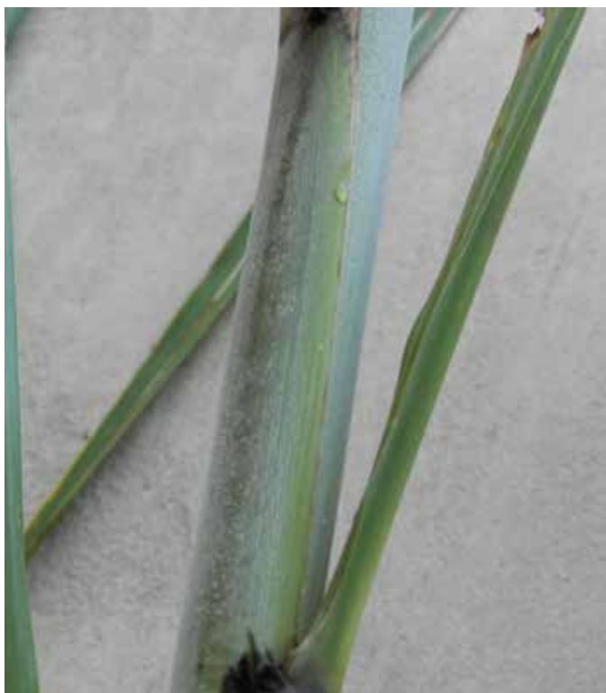
5. Leaf sheath margin – generally green and similar to the leaf sheath.