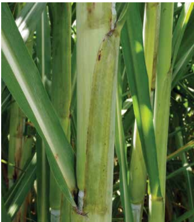
5. Leaf Sheath Margin – green; some with thin purple margins.