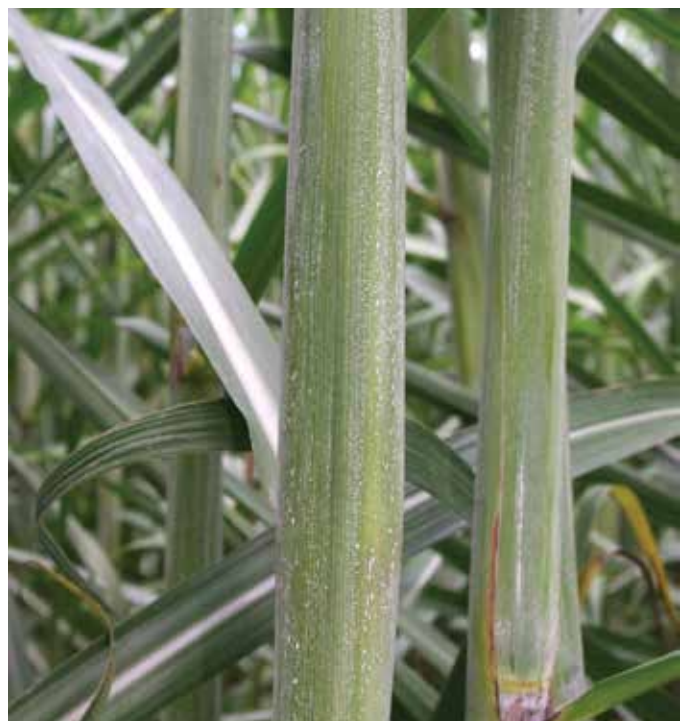
4. Leaf Sheath – heavy wax layer with no pubescence (hair); with prolonged exposure to the sun the leaf sheaths become reddish pink in color.