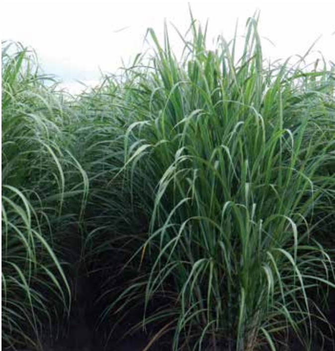
1. Canopy – slightly rounded to erect.