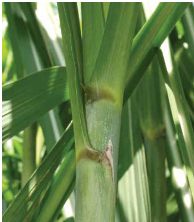
6. Dewlap – olive green.