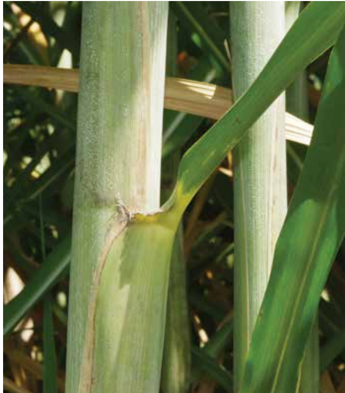
8. Distinguishing Characteristics – necrotic leaf sheath margins; cup shape leaf blade near the dewlap; distinct pointed auricle where present.