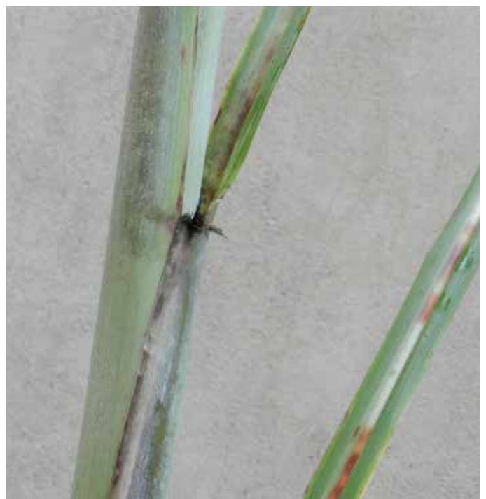
4. Leaf sheath – smooth (no pubescence).