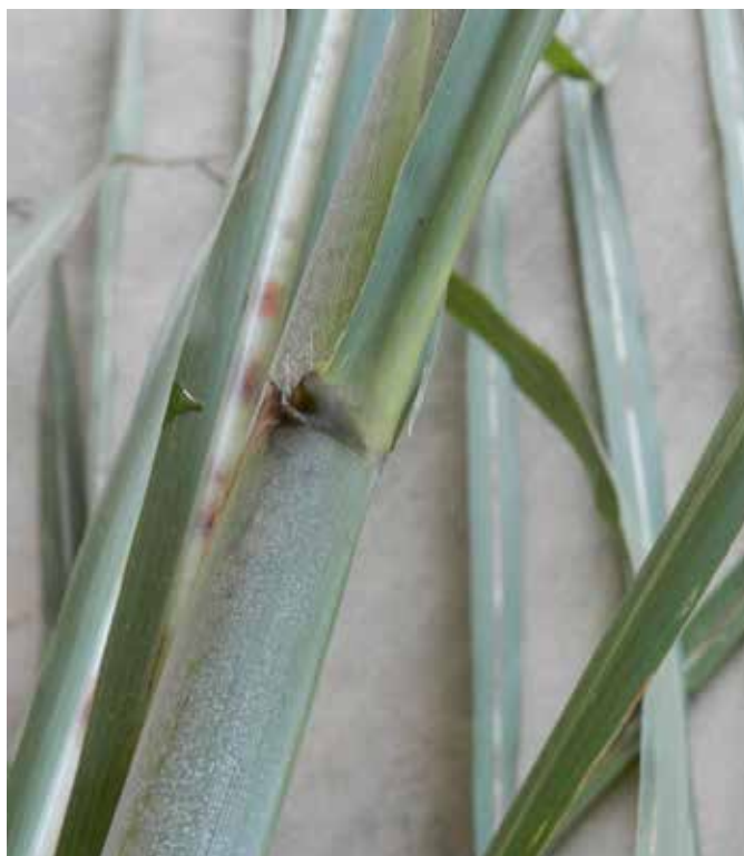
6. Dewlap – dark and becomes green at the base of the mid-rib of the leaf.