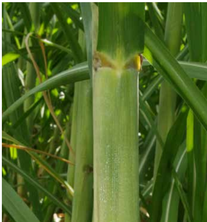
4. Leaf Sheath – very little wax and no pubescence (hairs).