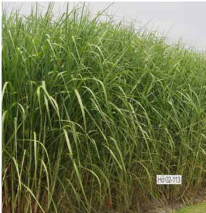
1. Canopy – erect.