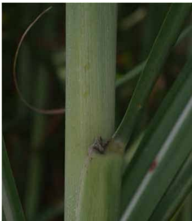
7. Auricle – very slight; some can have high levels of pubescence.