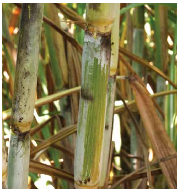
3. Stalk Color under the Wax Layer – green with slight bronzing on the older exposed stalk.