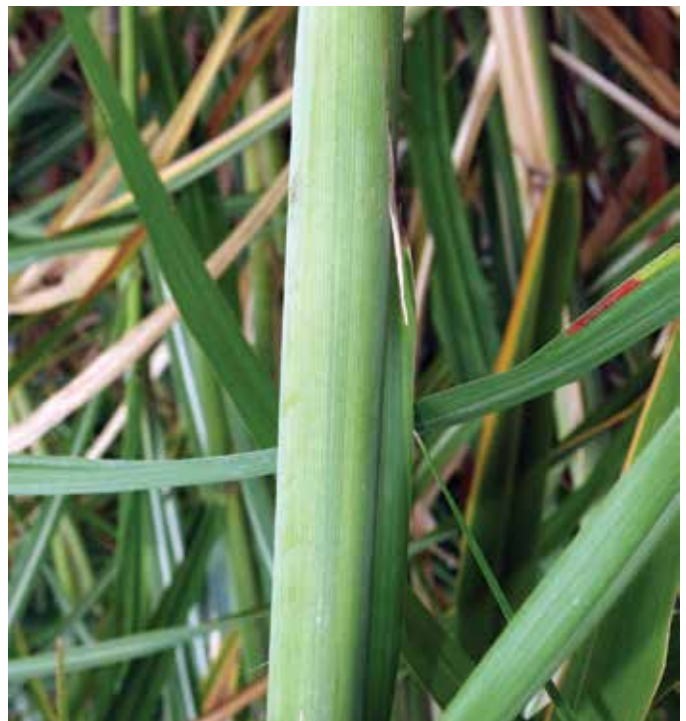
4. Leaf Sheath – very little wax and no pubescence (hair).