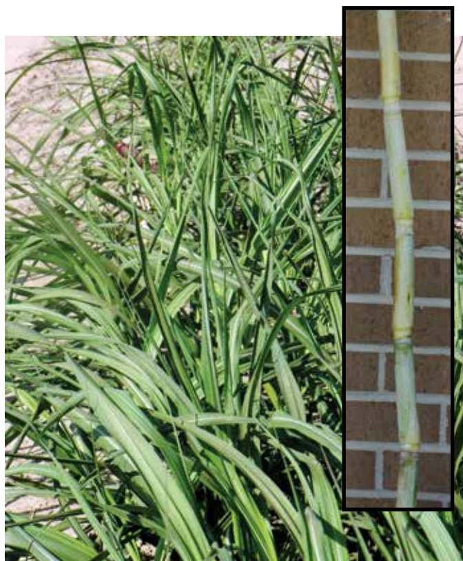
8. Distinguishing Characteristics – Curled leaf blade in early growth; smooth leaf blade when rubbing your fingers on the blade from tip toward the stalk; internodes along the stalk have a zig-zag pattern; internodes are barrel-shaped with very constricted root bands.