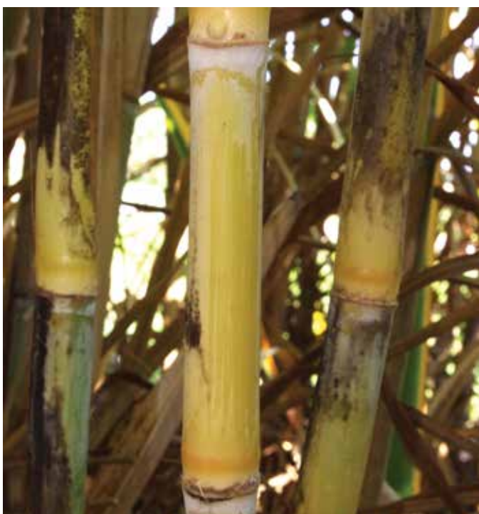
3. Stalk Color under the Wax Layer – greenish yellow that becomes more bronze with exposure to the sun.