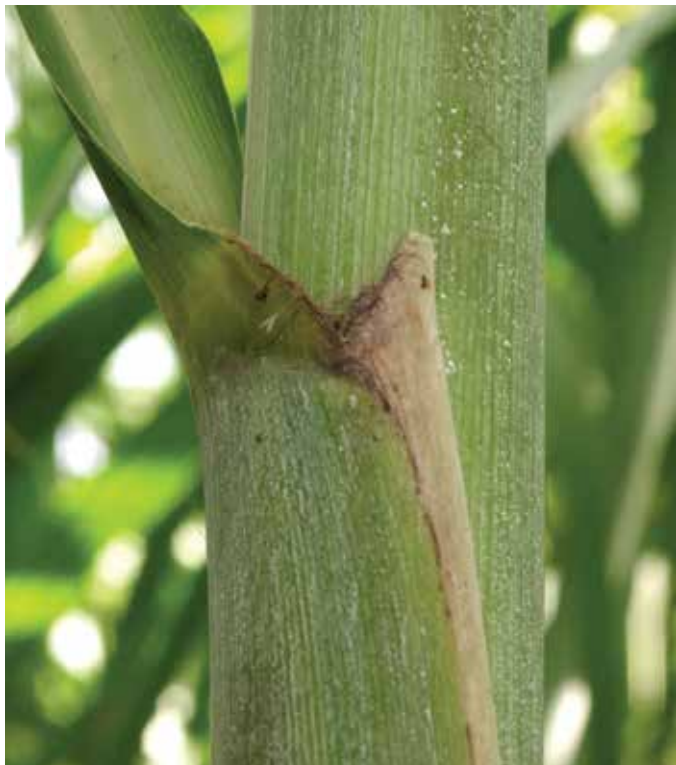
7. Auricle – Slight to moderate in length; necrotic with obvious points; small tufts of hairs may be seen between the auricle and leaf collar.