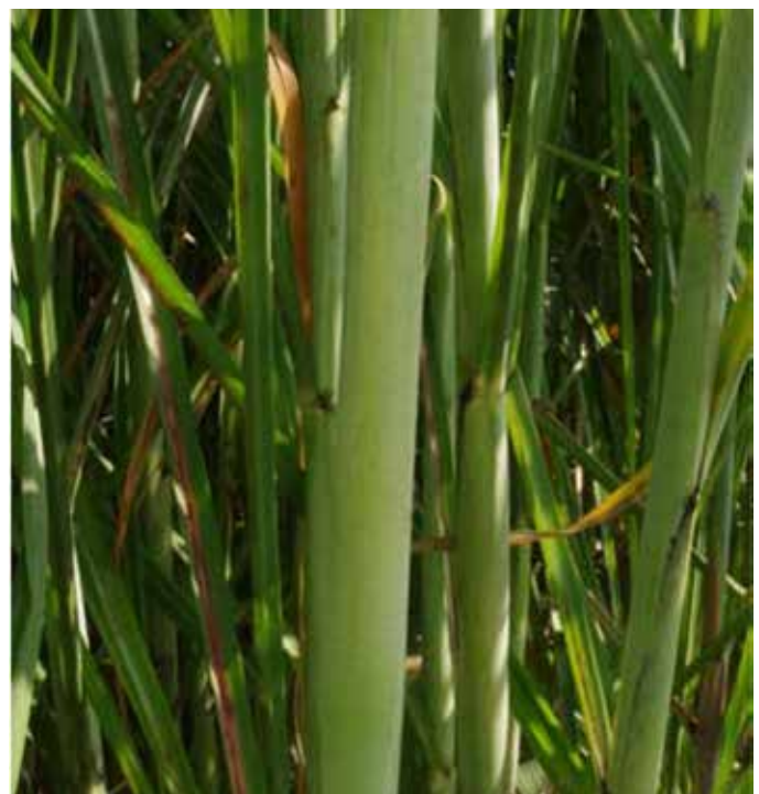
4. Leaf Sheath – no pubescence.