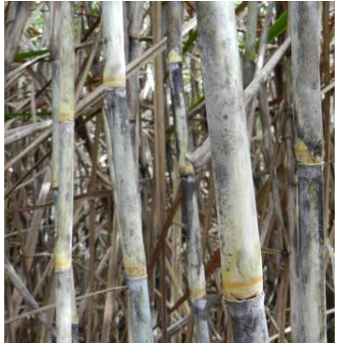
2. Stalk wax – slight to moderate wax; the black color that can be prevalent is sooty mold from fungal growth.