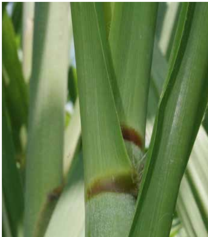
6. Dewlap – dark brown with reddish/purple hue.