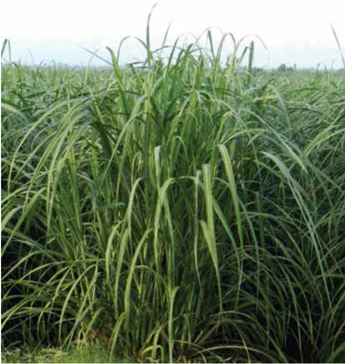
1. Canopy – drooping and spreading.