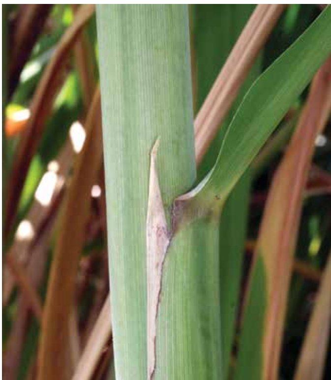
7. Auricle – long, necrotic and prominent.