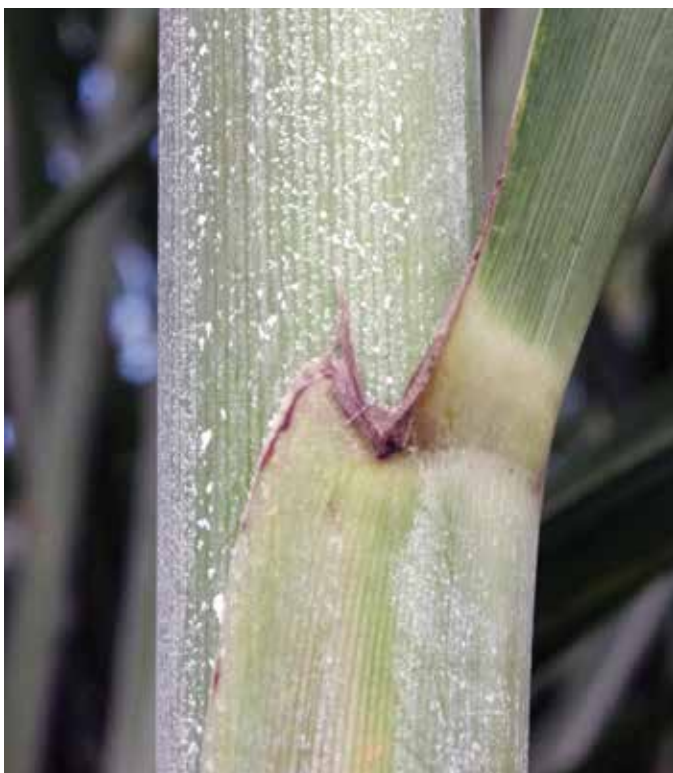
7. Auricle – slight to moderate in length.