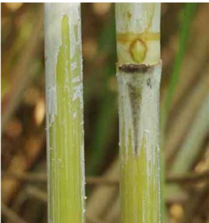
3. Stalk Color under the Wax Layer – predominantly green to some yellow hues.