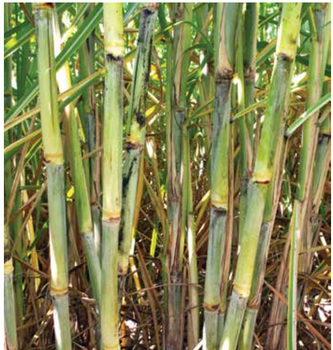
2. Stalk Wax – slight to moderate.