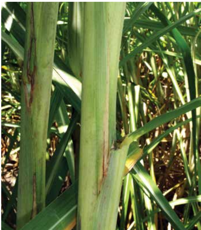
5. Leaf Sheath Margin – slightly necrotic leaf sheath margin.