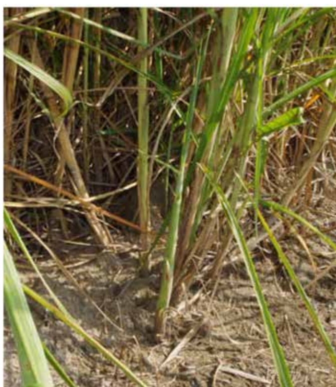
8. Distinguishing Characteristics – a high population of small diameter stalks and erect canopy; the variety can show rhizomatous growth that contributes to profuse tillering.