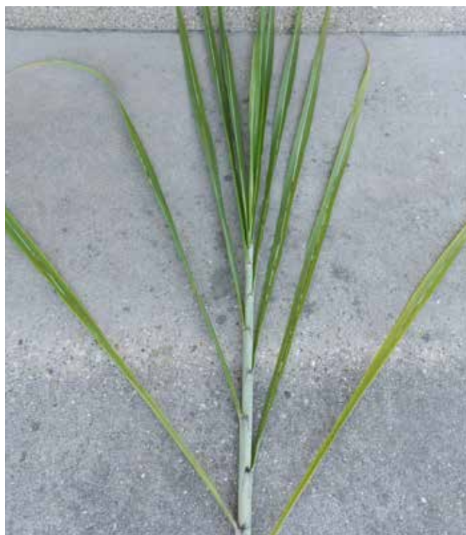
8. Distinguishing characteristics – smooth, rounded canopy and dark dewlaps; stalks have some growth cracks; leaves in the canopy have a high, upright angle.