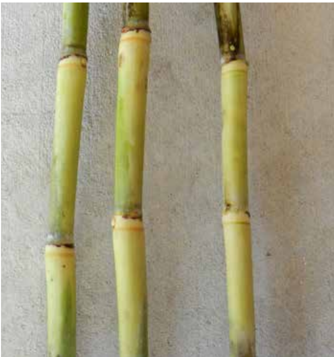
3. Stalk color under the wax layer – Yellowish-green that becomes darker green with exposure to the sun.