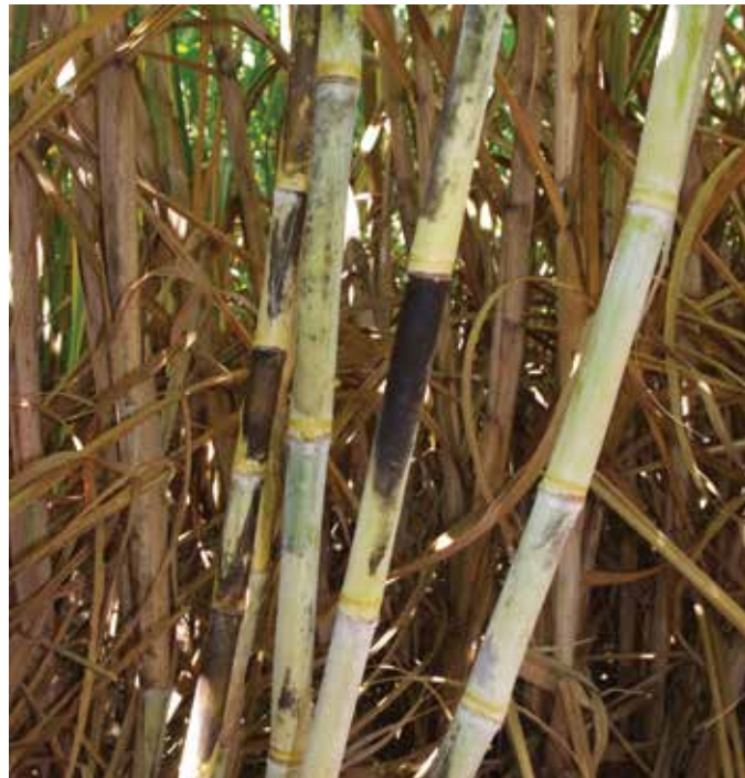
2. Stalk Wax – slight to moderate with overall yellowish to green appearance.