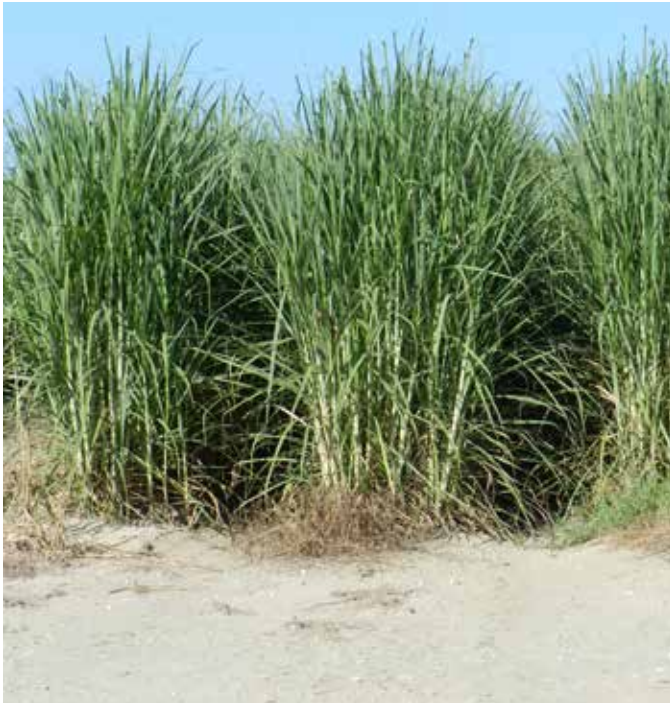
1. Canopy – erect.