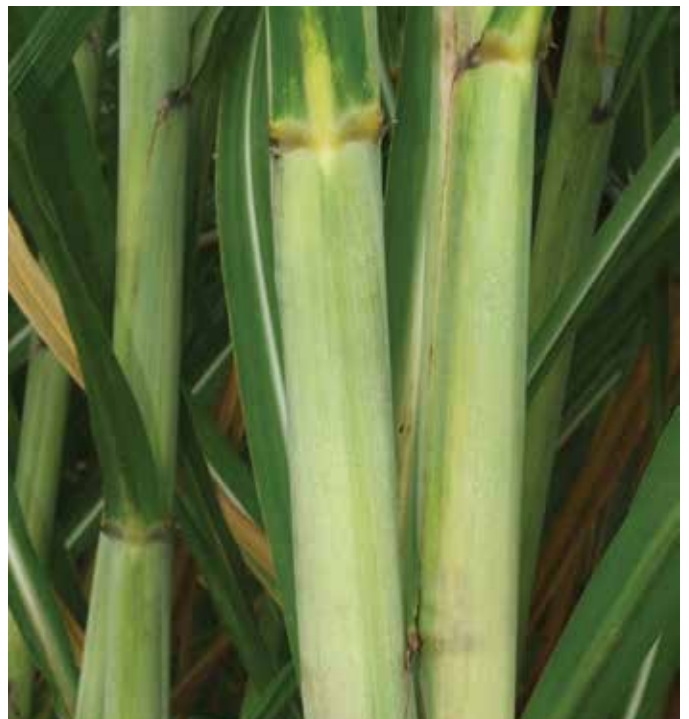
4. Leaf Sheath – no pubescence.