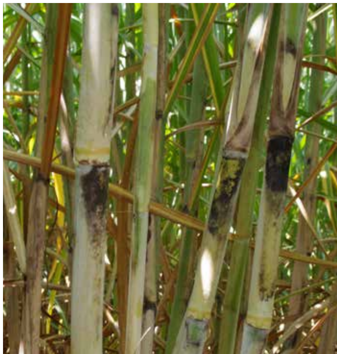
2. Stalk Wax – moderate wax layer.