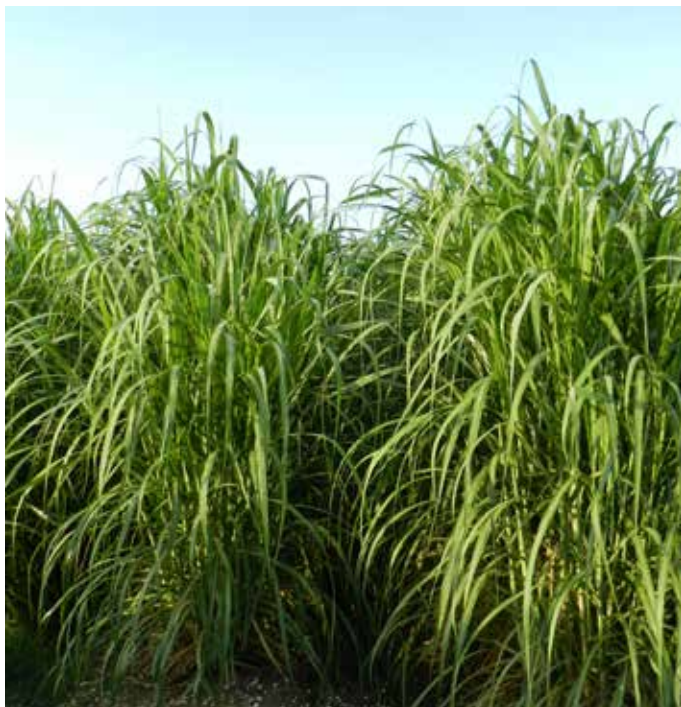
1. Canopy – drooping and spreading (similar to L 99-226).