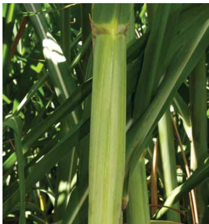
4. Leaf Sheath – no pubescence.