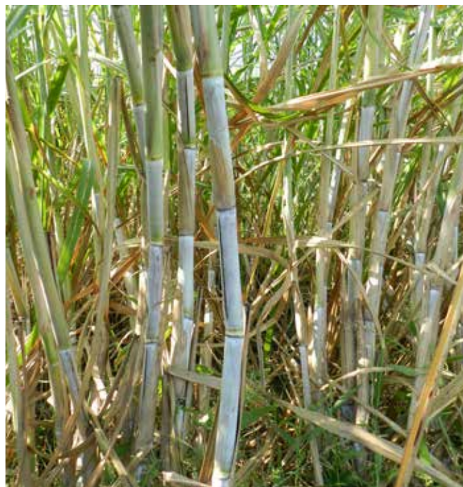
2. Stalk wax – heavy layer of white wax; note occasional growth cracks.