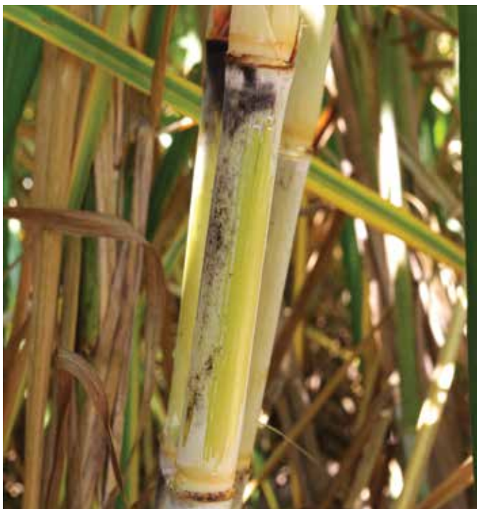
3. Stalk Color under the Wax Layer – greenish yellow; very slight bud groove.