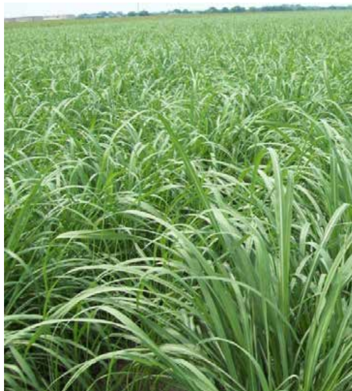
8. Distinguishing Characteristic – young plants have a yellowish hue even though properly fertilized, a spreading canopy and dark dewlaps.