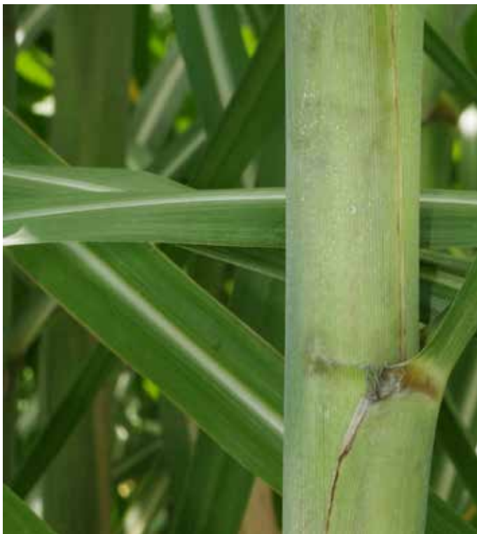
5. Leaf Sheath Margin – reddish purple margins.