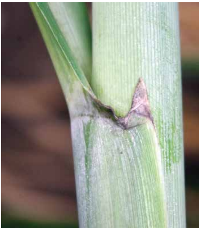
7. Auricle – slight to moderate in length when present.