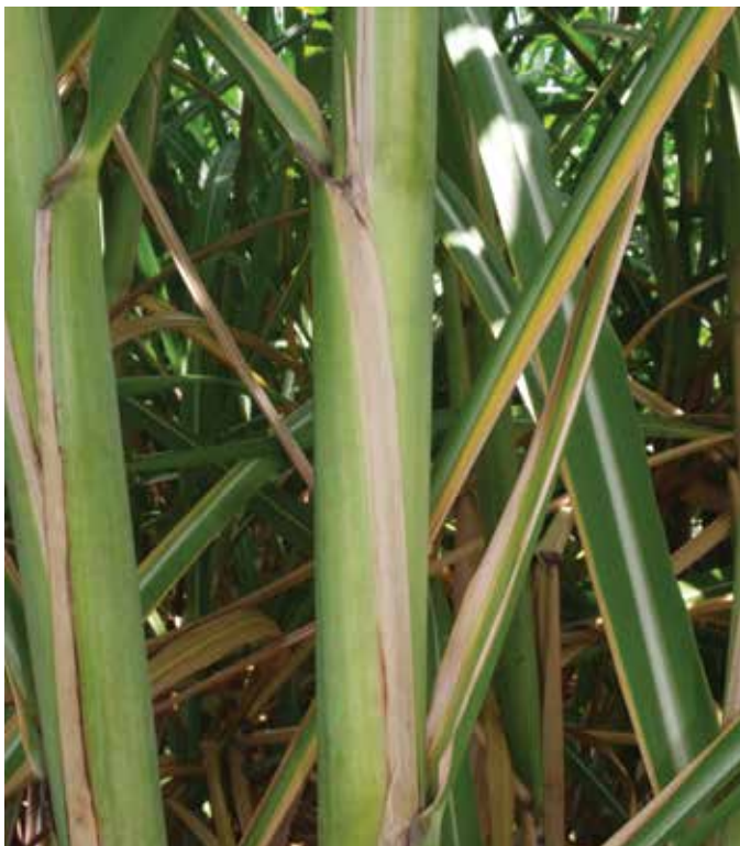
5. Leaf Sheath Margin – very necrotic leaf sheath margin edges that extend into a long auricle.