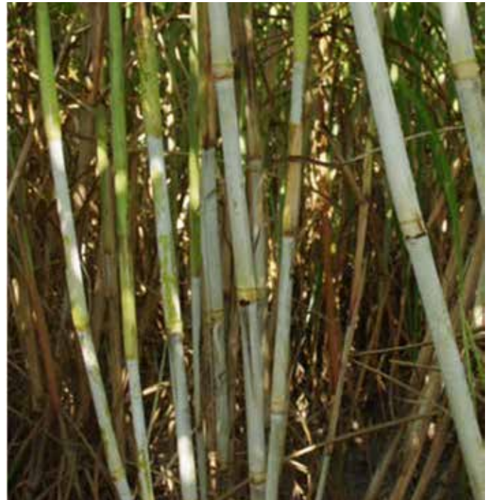
2. Stalk Wax – moderate to high amount of wax.