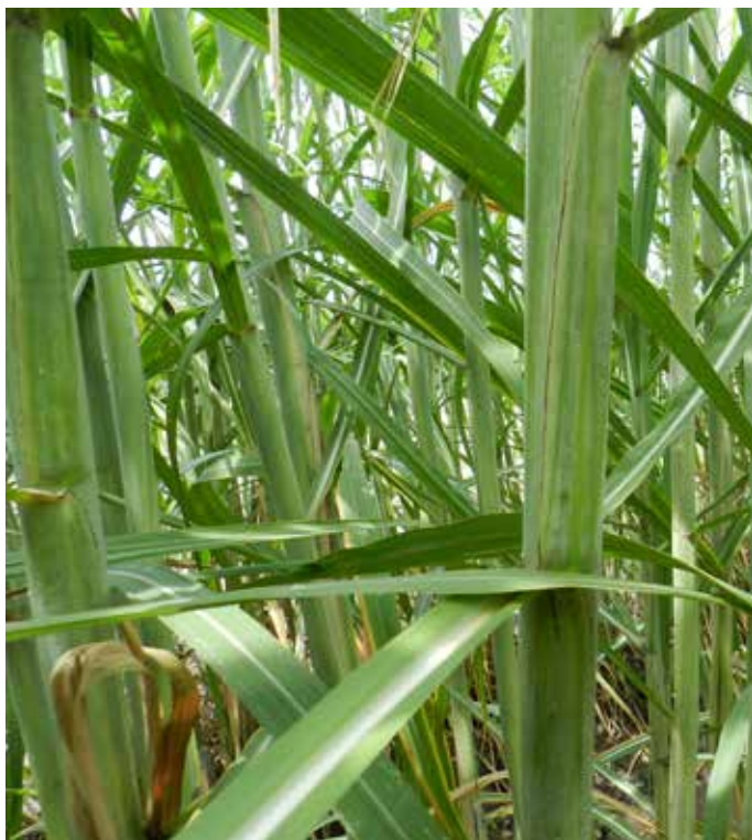
5. Leaf sheath margin – generally darker reddish-purple; margins become necrotic with age.