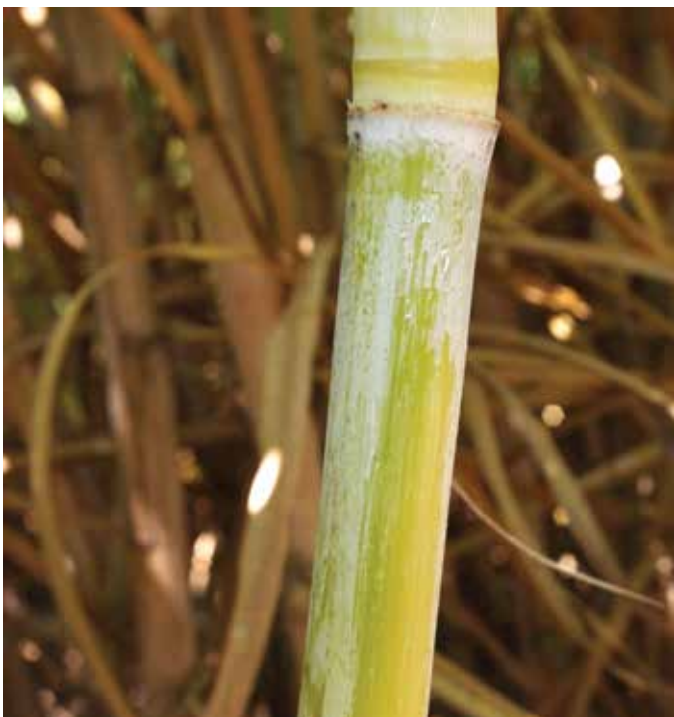
3. Stalk Color under the Wax Layer – yellowish green to green; with age the stalks become slightly more bronze in color than HoCP 96-540.