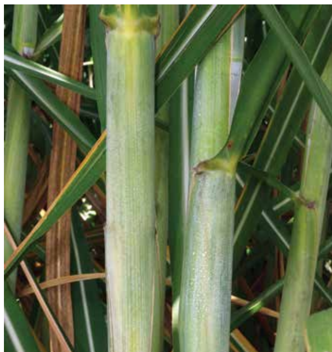
4. Leaf Sheath – no pubescence.