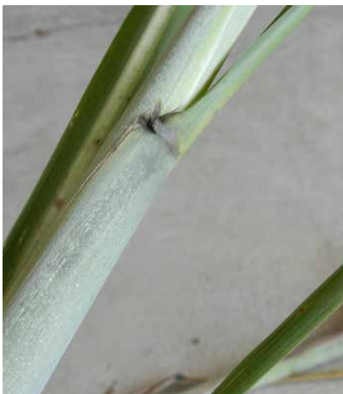
7. Auricle – slight to none.