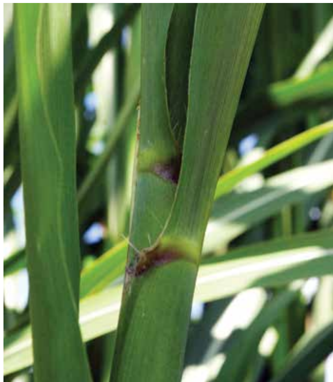
6. Dewlap – light green with light brown segment at each edge.