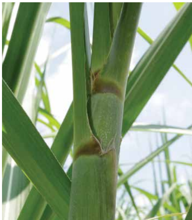
6. Dewlap – dark olive green that become much darker with more mature growth in the fall.