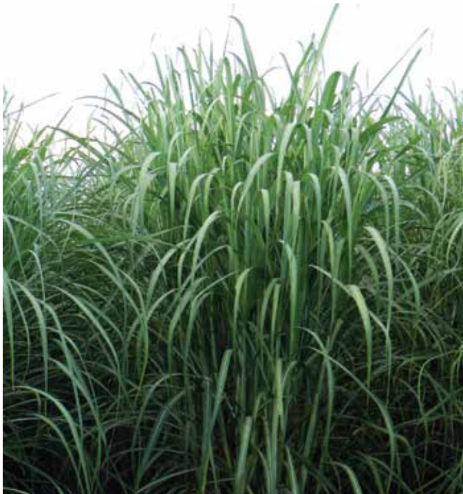
1. Canopy – moderately erect with leaf tips making a right angle at the top.