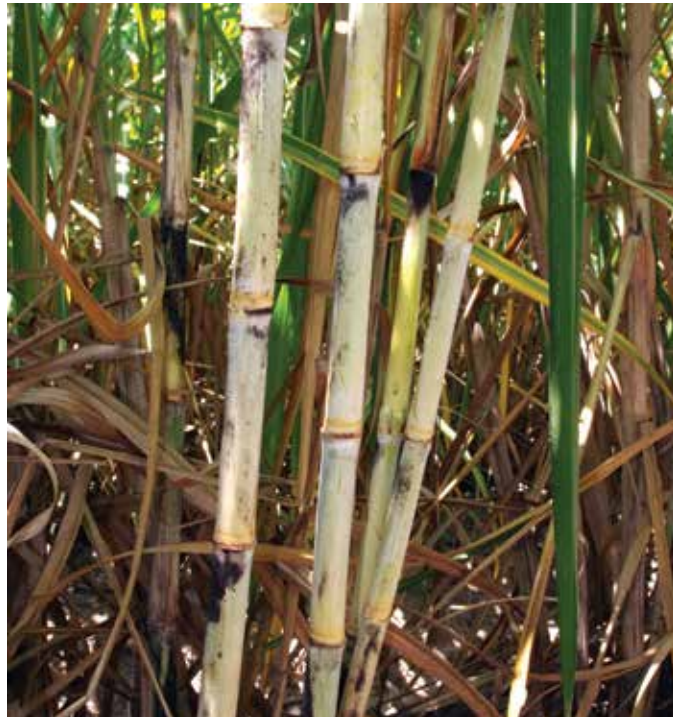
2. Stalk Wax – slight to moderate.