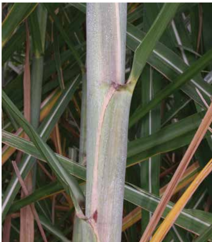
5. Leaf Sheath Margin – distinct necrotic leaf sheath margins.