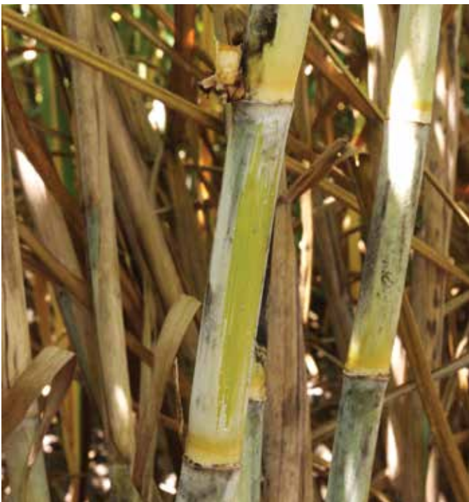
3. Stalk Color under the Wax Layer – greenish yellow that becomes more yellow with age and exposure to the sun.