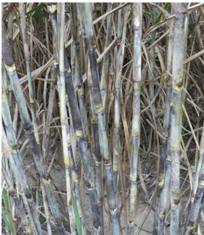
8. Distinguishing characteristics – has the most erect canopy of any variety grown in Louisiana; has a high population of small-diameter stalks.