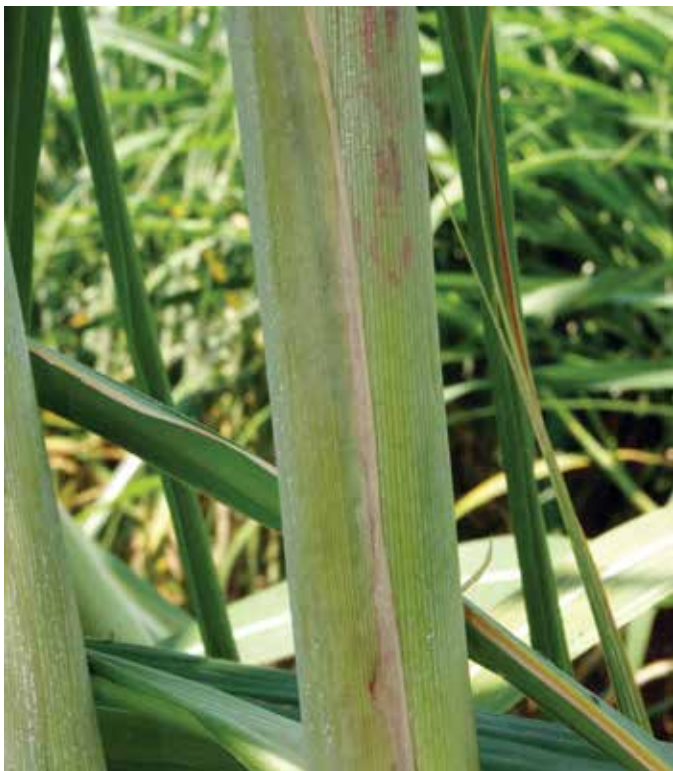
5. Leaf Sheath Margin – necrotic leaf sheath margin.