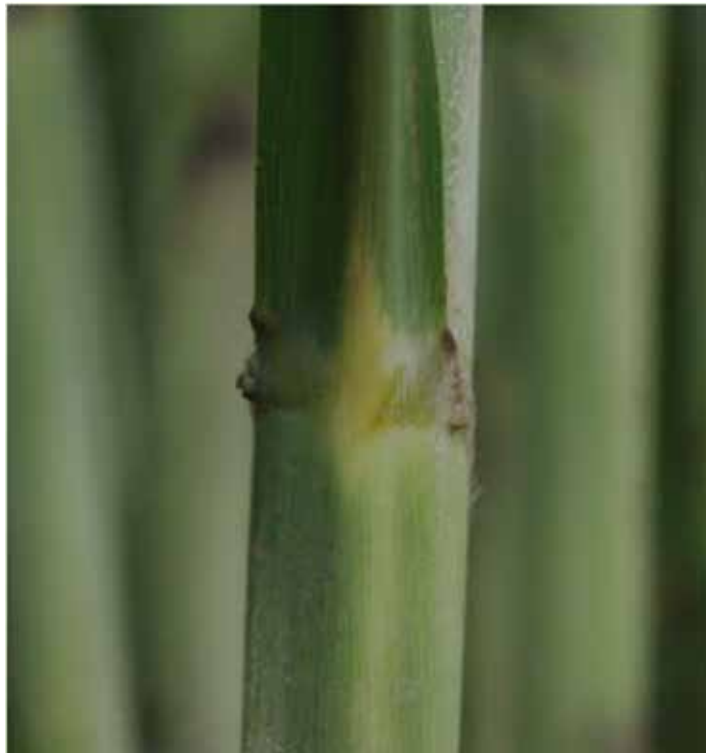
6. Dewlap – light green to yellow.