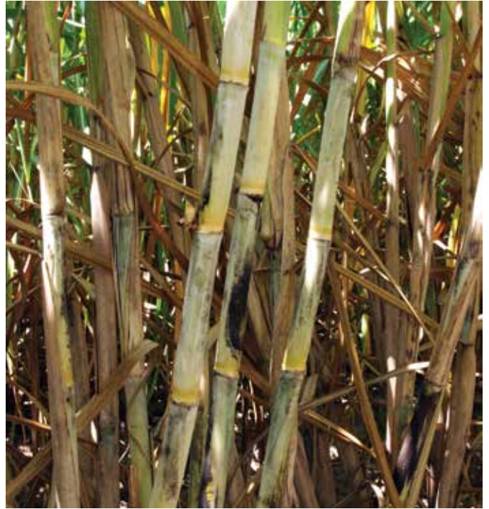
2. Stalk Wax – moderate wax with yellowish appearance.