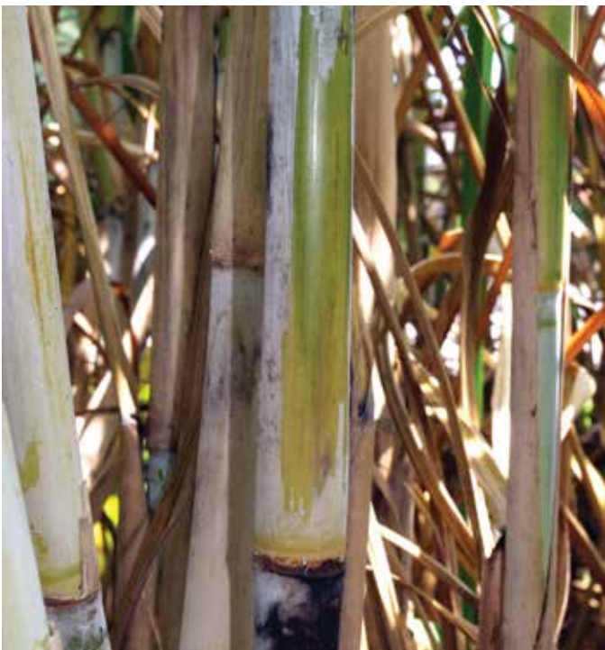
3. Stalk Color under the Wax Layer – dark green with purplish hues that deepen with exposure to the sun; with direct exposure to the sun, the stalk become deep purple.