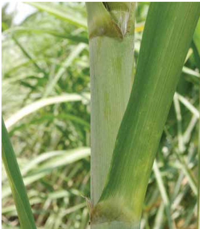
6. Dewlap – olive green.