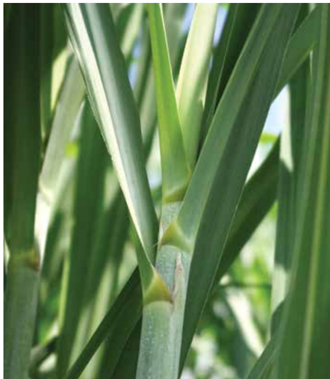
6. Dewlap – light olive green.