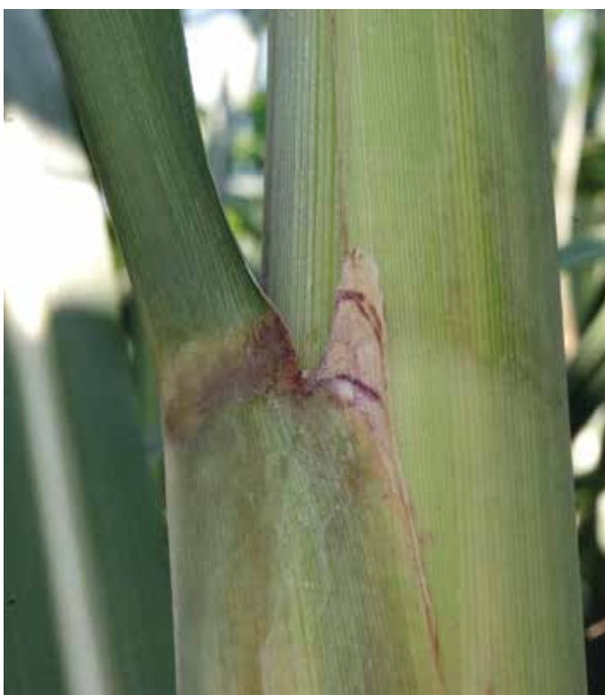
7. Auricle – ranges from none to medium in length (usually green compared to necrotic in L 99-226).