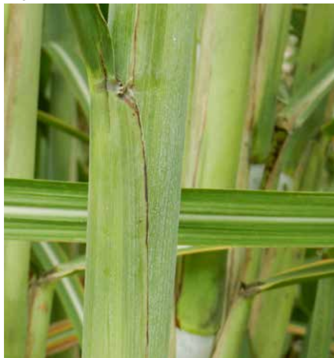
4. Leaf sheath – light wax layer; smooth with a few pubescence hairs just opposite of the dewlap.