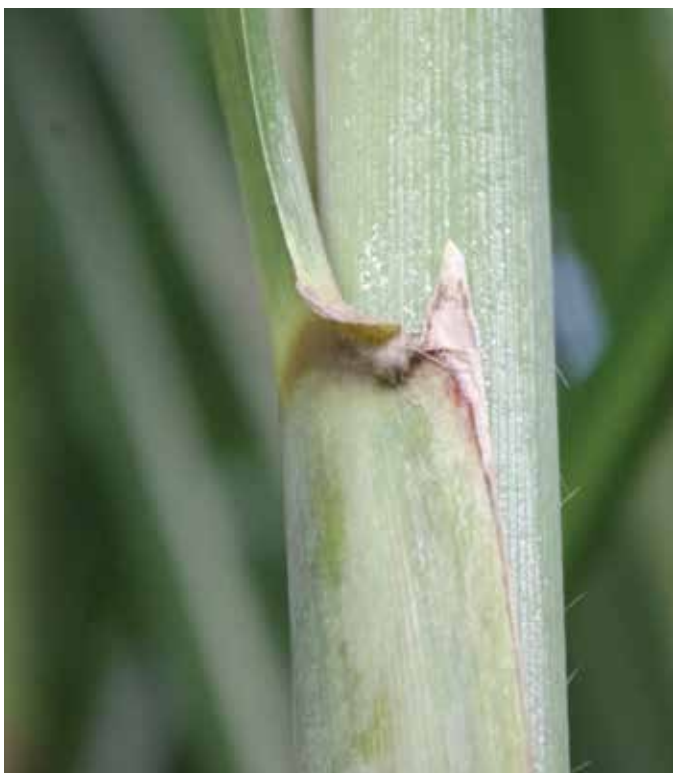
7. Auricle – slight to moderate.