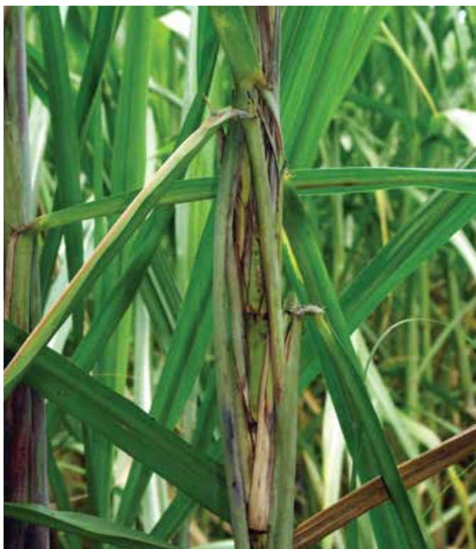
8. Distinguishing Characteristics – Off-types have a split leaf sheath that exposed a green stalk and is often associated with red blotches on the leaf sheath.