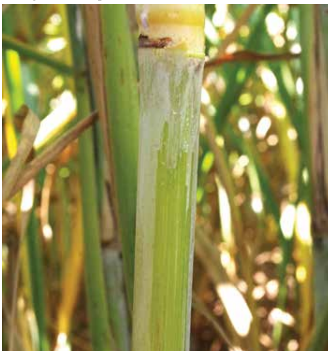
3. Stalk Color under the Wax Layer – green stalks with a yellow color under the leaf sheath.