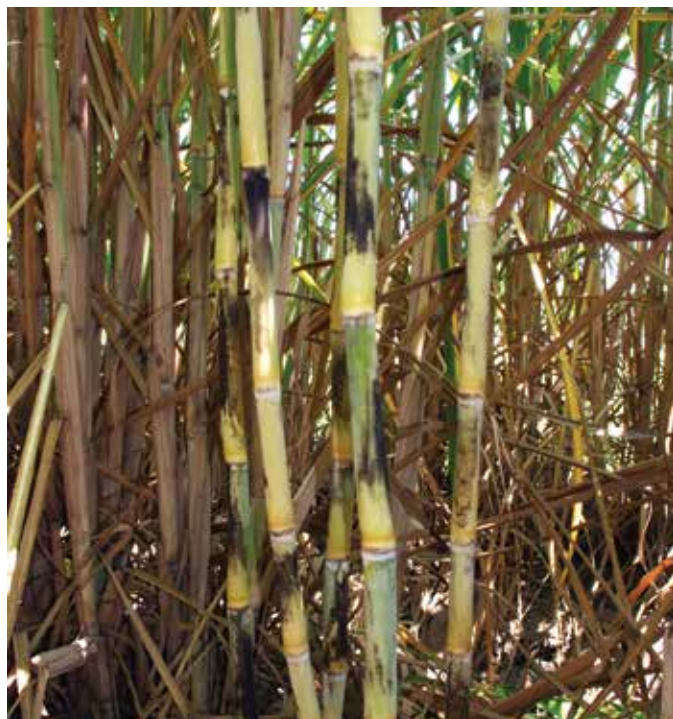
2. Stalk Wax – slight with overall yellowish appearance.