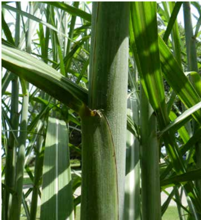
7. Auricle – primarily absent; when present the auricles are slight and necrotic.