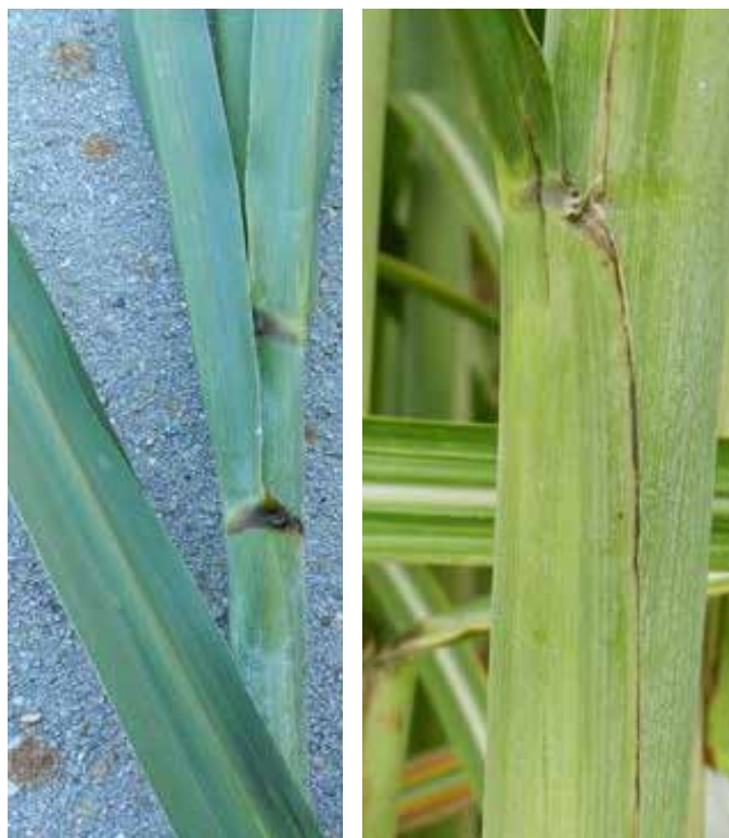
8. Distinguishing characteristics – stalk has a heavy wax bloom; dark dewlap; dark leaf sheath margin; growth cracks; variety has a moderate population of medium-size stalks.