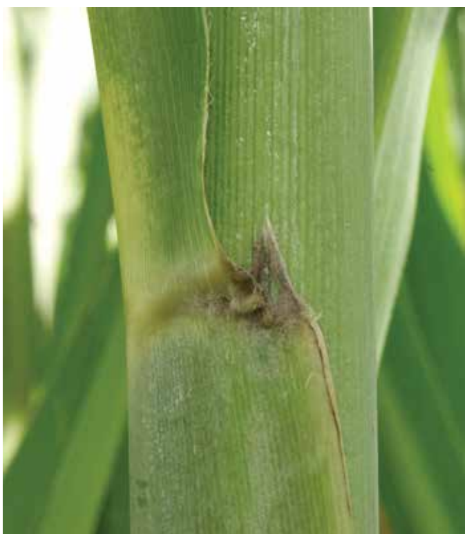
7. Auricle – slight.