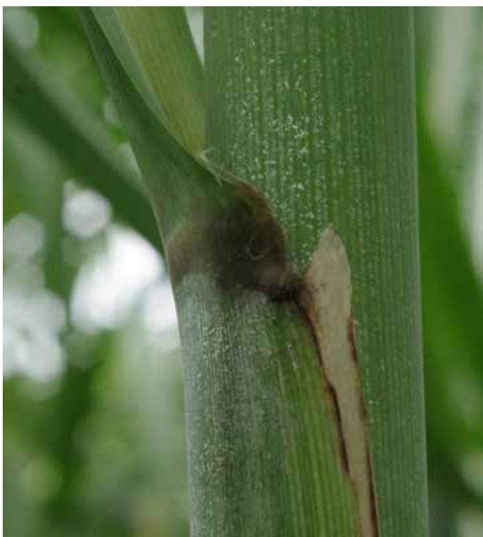
7. Auricle – slight to moderate, necrotic.