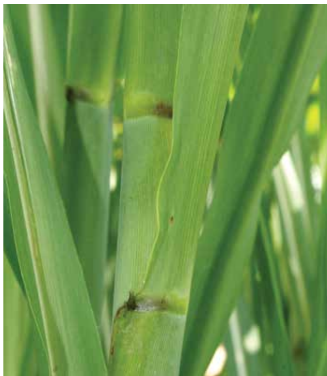
6. Dewlap – light olive green.