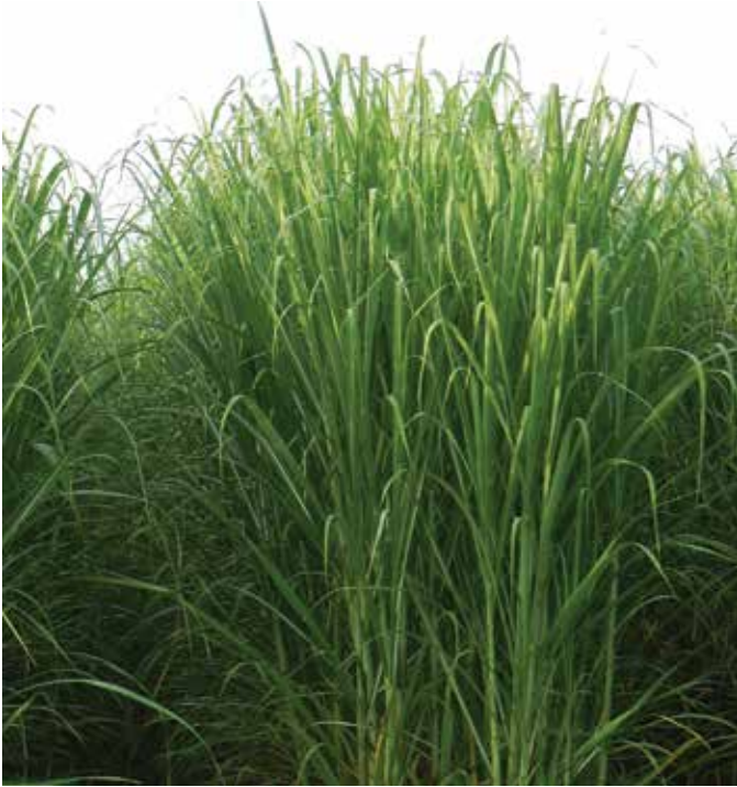
1. Canopy – smooth, rounded canopy.