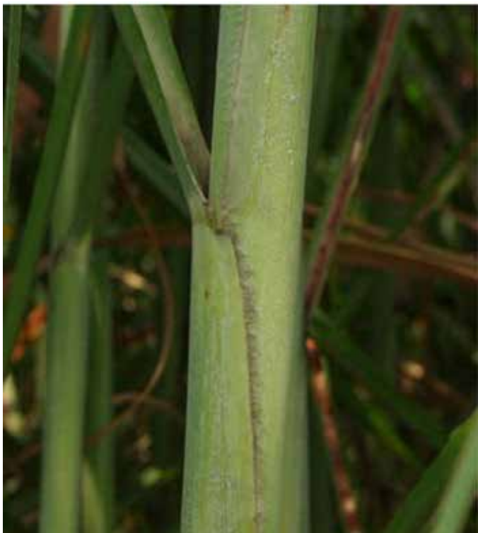
5. Leaf Sheath Margin – many leaf sheath margins have a high amount of pubescence.