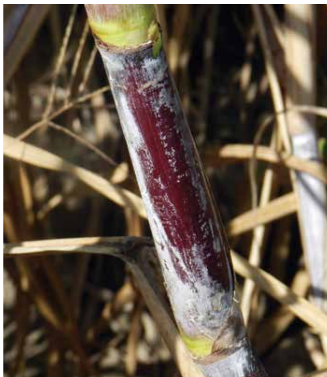
8. Distinguishing Characteristics – deep purple internodes when exposed to the sun; the leaf blade is very pubescent when you rub from the leaf tip back toward the leaf sheath.