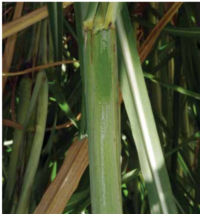
4. Leaf Sheath – no pubescence and less wax than HoCP 96-540.