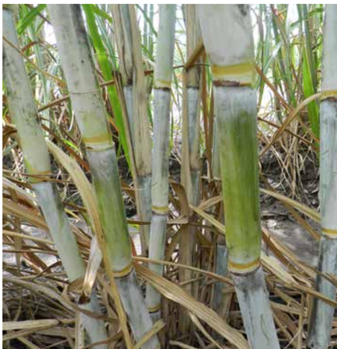
3. Stalk color under the wax layer – green that becomes darker with exposure to the sun.