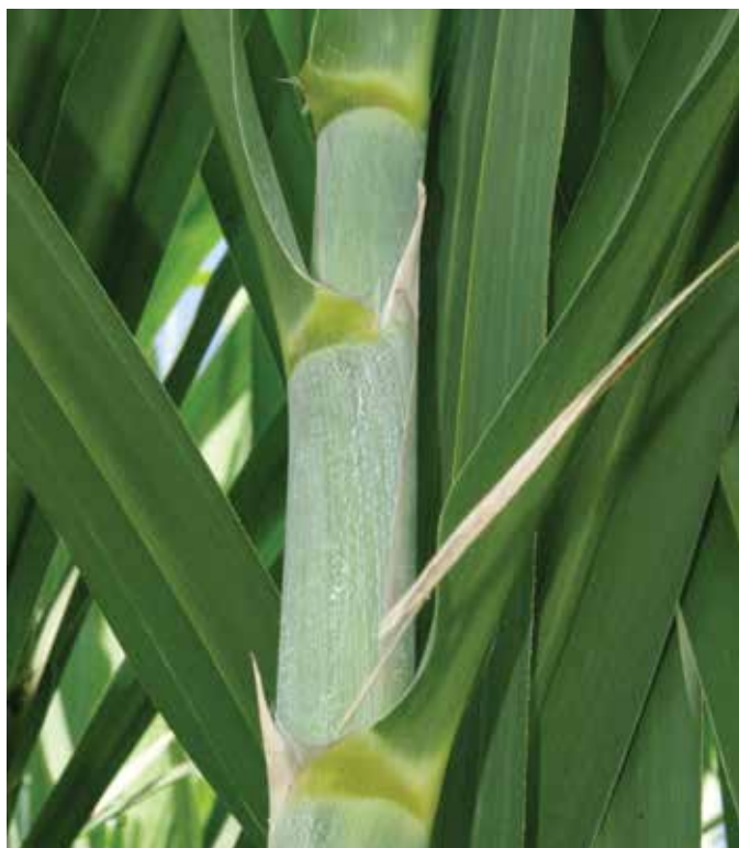
6. Dewlap – very light olive green.