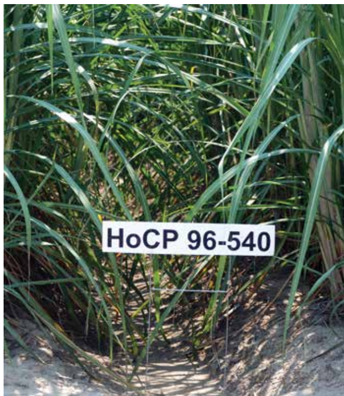
8. Distinguishing Characteristics – The heavy wax layer and non-necrotic leaf margin help to distinguish this variety from HoCP 04-838. HoCP 96-540 tends to have reddish-pink leaf sheaths.