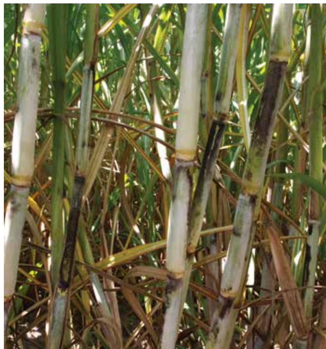
2. Stalk Appearance – Heavy wax layer.