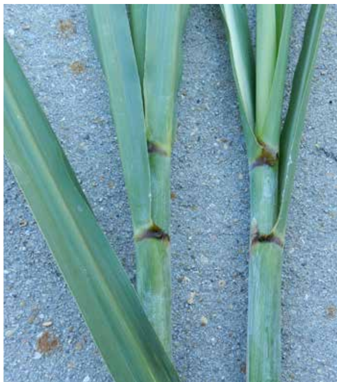
6. Dewlap – dark brown (with reddish hues).