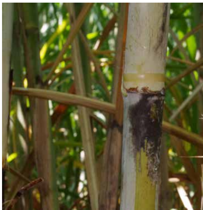
3. Stalk color under the Wax Layer – predominantly green with yellowish hues.