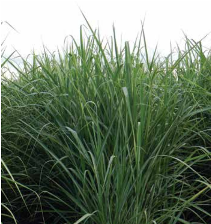
1. Canopy – erect; slight more erect and darker green than HoCP 96-540 and HoCP 04-838.