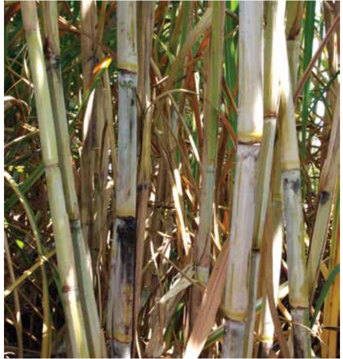
2. Stalk Wax – moderate wax layer.