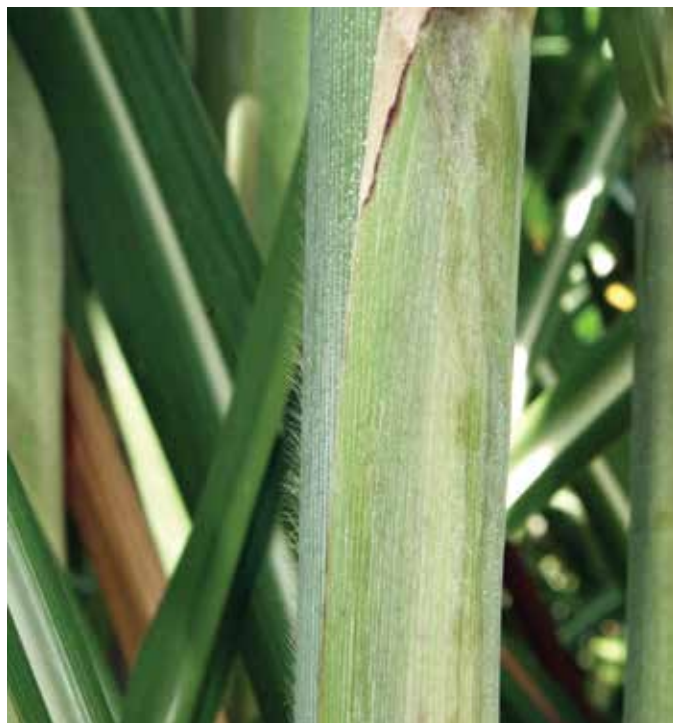
4. Leaf Sheath – moderate amount of pubescence (not as much as LCP 85-384).