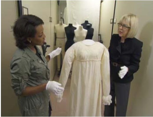
LSU Textile & Costume Museum Curator examining an early 1800s Louisiana dress from holdings.