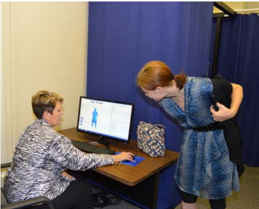
Two TAM graduate faculty examining results from the departmental 4-D body scanner.