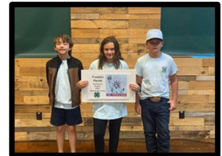
4-H Challenge Camp