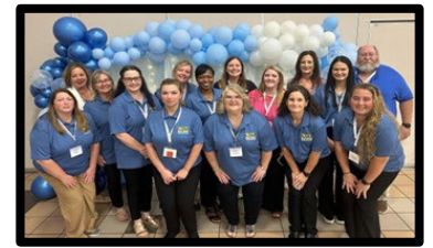
4-H State Association Convention