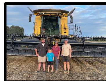
Soybean Variety Demo Campbell Farms