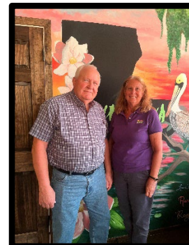
Franklin Parish Rotary Club

The corn and soybean on-farm variety demonstrations were harvested. Yields were good for both demonstrations. Producers use the data from these on-farm demonstrations to make planting decisions for the next year.