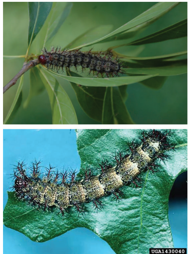
Fig. 2. Mature buck moth larva on oak foliage. Top: dark form; bottom: light form. Note the multiple rows of branched spines.

The buck moth is typical of univoltine, tree-feeding saturniids. However, unlike most saturniids, the buck moth often attracts