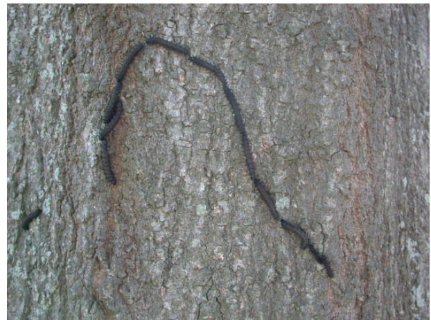
Fig. 3. Processionary chain of buck moth larvae descending live oak tree.

attention during localized outbreaks and in urban areas, primarily as a result of stings. Foliage quality and mortality agents are apparently the primary factors regulating buck moth populations, although abiotic variables, such as temperature and photoperiod, also are important (Foil et al. 1991, Hoven 2009). Mating and reproduction require conditions favorable to pheromone communication.