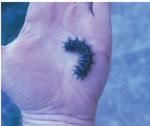
Fig. 6. Buck moth stings. Note the double row of red welts on the right-hand side corresponding to the double row of spines on the larva.

perhaps the introduced C. concinnata have been identified as primary factors threatening buck moth populations (Boettner et al. 2000, Wagner et al. 2003, Rubinoff and Sperling 2004, Hoven 2009, Elkinton and Boettner 2012). Thinning and prescribed fire to restore pine barrens to historic conditions may benefit buck moth populations in New England by improving host nutritional quality and by reducing C. concinnata parasitism (Hoven 2009).