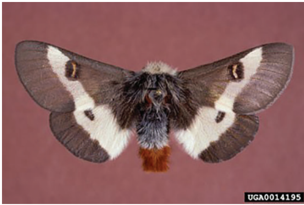
Fig. 4. Adult buck moth, male.