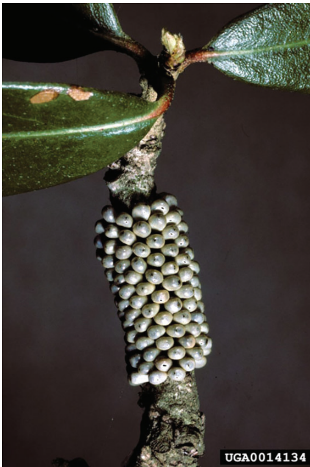
Fig. 1. Buck moth egg mass on oak twig.

Larvae typically complete development by mid-April–May in the South and by August in northern portions of the range (Drooze 1985, Foil et al. 1991, Hoven 2009). When mature, caterpillars descend to the ground to pupate, often forming long chains of individuals (Fig. 3). Larvae pupate under 3–5 cm of soil during late May to early June in the South and enter a summer diapause (Foil et al. 1991, Martinat et al. 1997). In New England, larvae mature and pupate in August (Hoven 2009). Pupae may overwinter for more than a single season (Wagner 2005), providing insurance against local extinction owing to adverse environmental conditions.