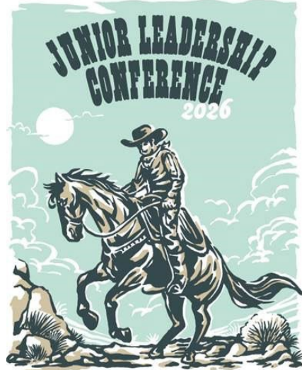
Wrangle your potential

Start marking your calendars and counting down the days for this fun, unforgettable week!