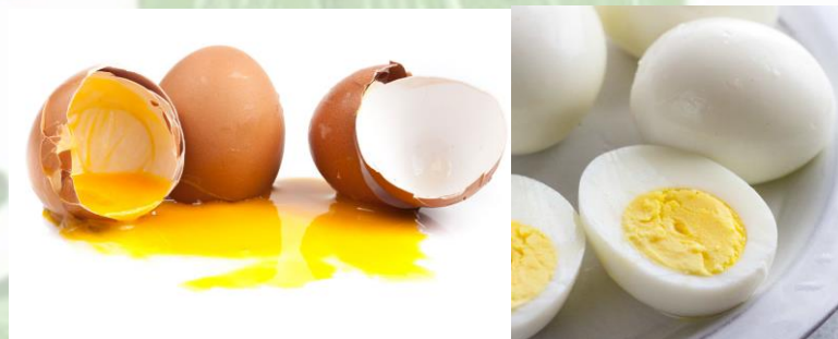
Whole eggs raw or cooked