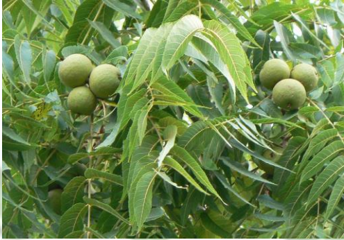
Black Walnut Parts