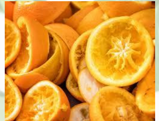
Citrus Peels ?