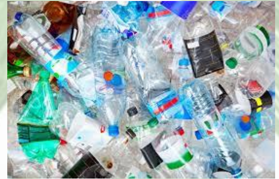
Plastic or Plastic Coated