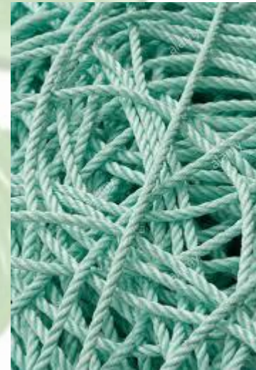
Synthetic Materials (nylon, polyester, etc.)