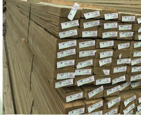
Pressure Treated Wood