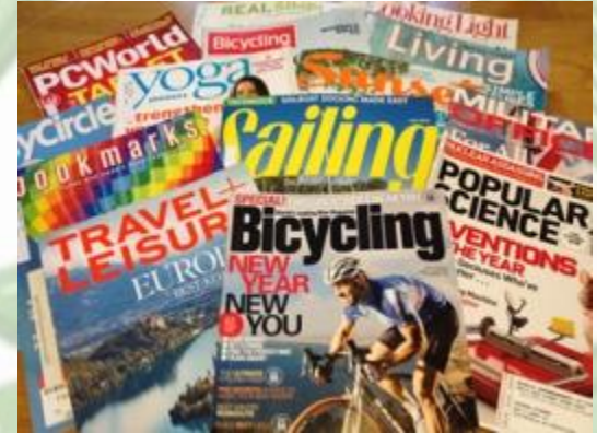
Colored Glossy Paper