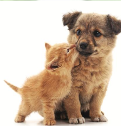
Dog & Cat Wastes/Litter