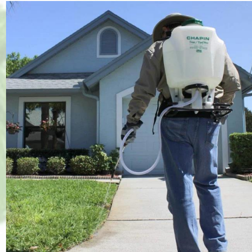
Plant Material Treated w/ Pesticides