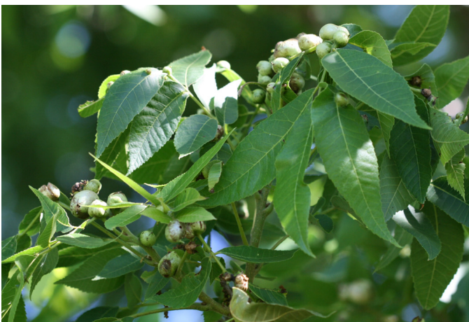
Figure 1. Phylloxera gall mass.

Galls can remain on the twigs for several years. Because of this, some growers refer to pecan phylloxera as stem phylloxera. High infestation levels of this insect cause the current season's shoots or twigs to become deformed, reducing their rate of growth. In some cases, severe infestations can lead to dieback of the current season's shoots. Galls also can form on the nuts, causing nut deformity and premature nut loss. Galls formed by pecan phylloxera are an alternate host for larvae of the hickory shuckworm, Cydia caryana Fitch.