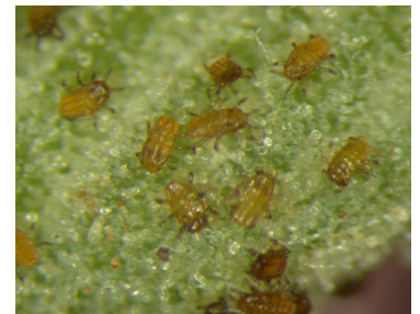
Figure 3. Stem mothers feeding on opening buds.

The overwintering eggs begin hatching in early spring at about the time the pecan buds are beginning to open. In northwestern Louisiana, this begins about mid-March. Upon hatching, the nymphs (stem mothers) move from the overwintering sites to the opening buds (Figure 3). The emergence period is approximately 50-60 days in length.