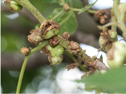
Figure 5. Galls splitting open releasing the winged migrants.

May (Figure 5). They disperse within the tree or, with the aid of the wind, are carried to other trees within the orchard. Soon after emergence, egg laying takes place. The small, light-yellow eggs are deposited on the upper and lower leaf surfaces (Figure 6). When infestation levels are high, the leaves often take on a yellowish tint because of the high numbers of eggs deposited on the leaves. The eggs deposited by the winged migrants hatch into sexual males and females.