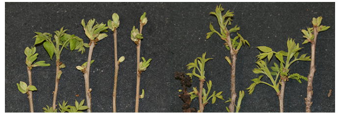
Figure 7. Suggested stages of bud development when insecticide applications should be made for phylloxera control.

If phylloxera are present, insecticide applications should be made between the stages of bud development, where the leaves have begun to unfurl, and early leaf expansion (Figure 7). It is suggested that one insecticide application be made per year. If galls are found, another insecticide application can be made the next year. Insecticide applications need to be made prior to gall formation, because once the insects are enclosed in the galls, control is no longer possible.