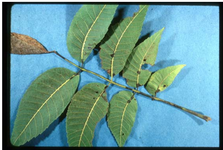
Figure 5: Vein spot lesions

Vein spot disease on pecan is caused by the fungal pathogen Gnomonia nerviseda . The fungus survives the winter in leaf debris remaining from the previous year. In early spring, spores of the pathogen are produced in this leaf debris on the ground and can infect the current year's foliage following rainfall in the spring and early summer. Defoliation of infected leaves occurs from late in the summer through fall. Infections that occur from April through June cause the most defoliation. Vein spot lesions are always located on leaf stems, leaflet stalks, leaflet midribs, or leaflet veins (Figure 5). These lesions are easily mistaken for scab lesions but can be distinguished because they have a smooth shiny surface as opposed to the sunken fuzzy appearance of scab lesions. The vein spot pathogen does not infect nuts but causes economic damage by reducing the food production capacity of trees through significant leaf loss. The disease can be controlled by preventative fungicide applications made prior to rainfall events in the spring.