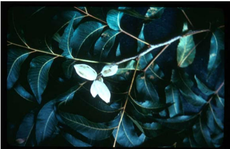
Figure 12: Early appearance of powdery mildew

Powdery mildew disease of pecan, caused by the fungus Microsphaera penicillata , occurs primarily on the surface of nut shucks. The disease first appears as a whitish powdery covering on shucks (Figure 12). In a few weeks, the whitish fungal growth fades away, and the infected shucks develop a brownish cast over the typical green tissue (Figure 13). The disease is most prevalent following periods of several days of high humidity with mild temperatures. There is not much data that supports an economic effect of this disease but severe infection can apparently reduce nut size. Some of the fungicides used for pecan scab control are more effective than others at reducing the severity of powdery mildew. However, because the disease is sporadic in occurrence and not considered a significant economic problem, specific fungicide application for powdery mildew is not usually recommended. If this disease is a consistent problem on your pecans, consult with your local county agent or the LSU AgCenter Pecan Station for the best fungicides to use.