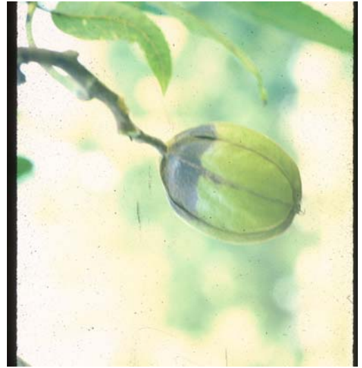
Figure 7: Anthracnose