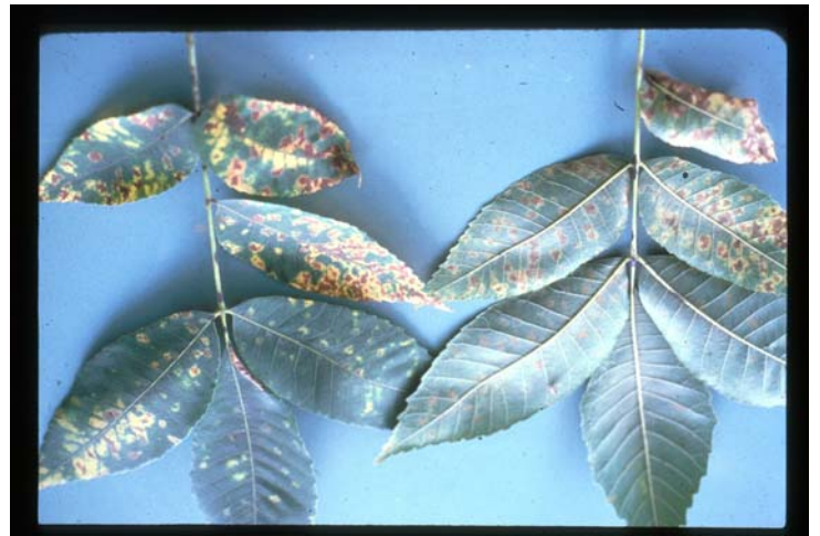
Figure 9: Older lesions