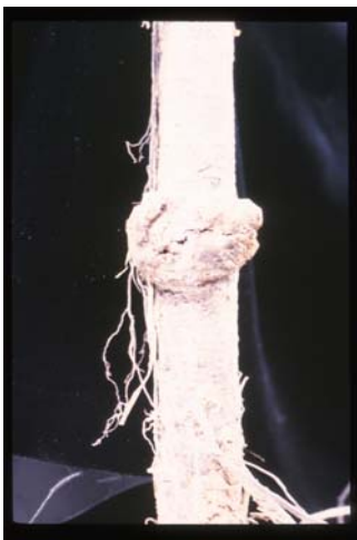
Figure 15: Galls on crown of young tree

The bacterium is common in heavy clay soils and infects pecan trees through wounds on the roots or crown area of trees. Once infection has occurred, there is no practical control. The bacterium can be spread from infected tree sites to other areas by transfer of soil on equipment. The root systems of trees purchased for transplanting should be examined carefully before planting to try to avoid planting infected trees. Practices such as discing are not recommended in pecan orchards because the roots can be wounded providing an avenue for infection if the bacterium is present in the soil. Likewise, care should be taken to avoid wounding the base of young trees with mowing equipment. If one area of an orchard has trees with crown gall, care should be taken to avoid transporting soil particles from the infested area into areas without the disease.