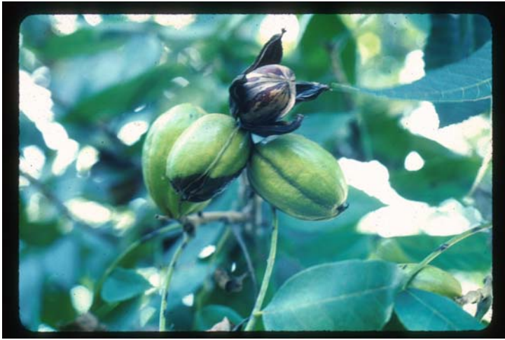
Figure 6: Shuck dieback