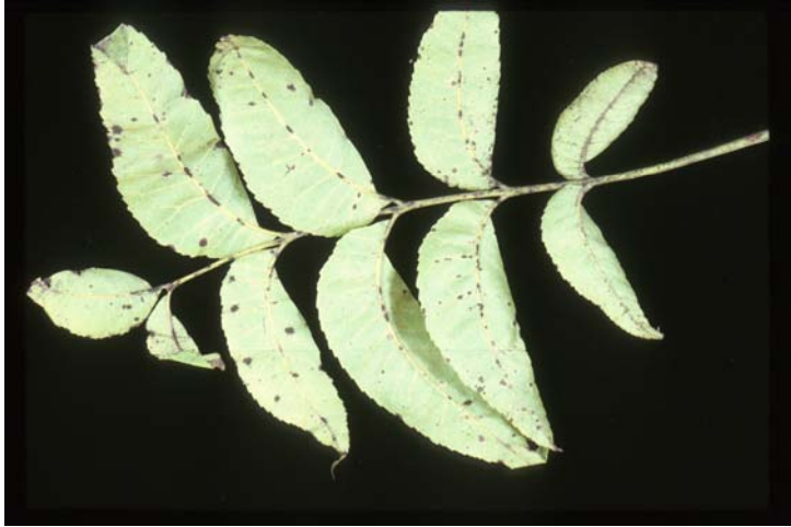
Figure 1: Scab lesions on leaves