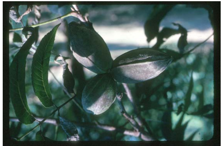
Figure 13: Older stage of powdery mildew