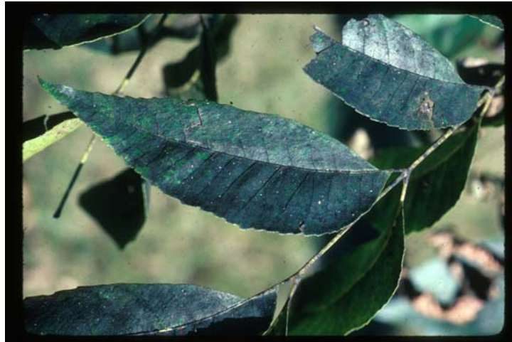
Figure 14: Sooty mold on leaf surface

Sooty mold occurs when various fungi grow on the sugary excrement of aphids that feed on pecan leaves. This substance is usually referred to as “honeydew” because it has a sticky consistency that covers surfaces it is deposited on. The fungi that form sooty mold do not grow into the leaves but live on the honeydew on the leaf surface. The sooty mold fungi produce a black coating on leaves (Figure 14) that can block sunlight from the leaf surface and reduce food production by trees. The economic effect of sooty mold is not known, but reduction in food storage levels in pecan trees is known to reduce kernel growth in the current year and nut production in the next year’s crop. Sooty mold growth can be reduced by limiting the development of aphids on the leaves.