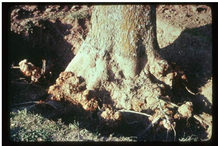
Figure 16: Galls on a mature tree