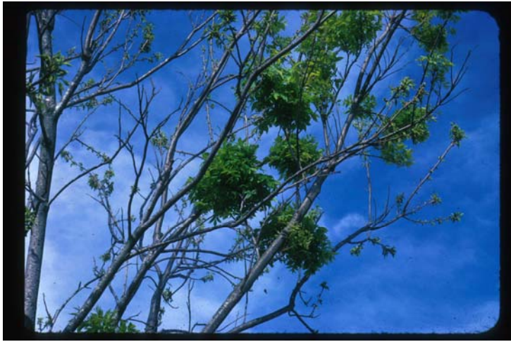
Figure 10: Shortened bunched appearance of terminals