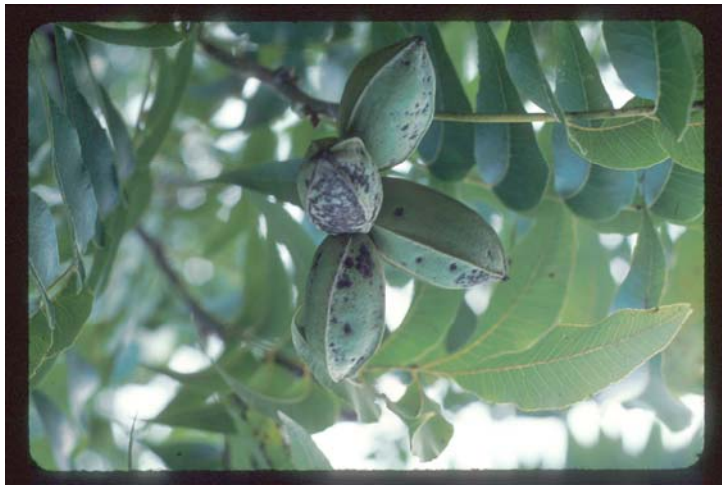
Figure 2: Scab lesions on nuts