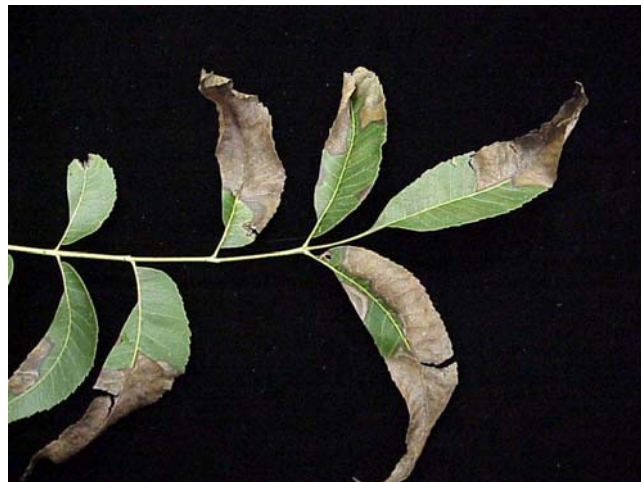
Figure 4: Pecan bacterial leaf scorch

The bacterium can be transmitted through grafts when infected trees are used as a source of scion wood. Infection is apparently permanent and the disease is chronic, tending to occur at varying levels of severity each year. In other hosts, this bacterium is transmitted from plant to plant by leafhoppers, spittlebugs, and cicadas; however, insect vectors for pecan have not been identified. The bacterium does not kill pecan trees as it does some other hosts but severely affected trees can suffer yield loss almost every year. Once a tree is infected there is no control for the disease. Currently, over 20 cultivars (varieties) are recognized as susceptible to bacterial leaf scorch, but this number is likely to increase as more becomes known about this disease.