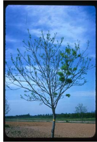
Figure 11: Early spring development of bunch