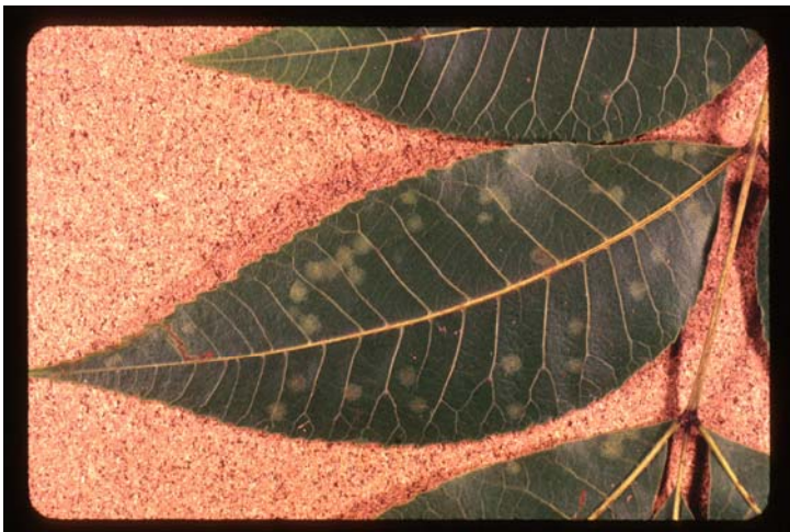
Figure 8: Young downy spot lesions

Downy leaf spot is a foliar disease caused by the fungus Mycosphaerella caryigena . During the spring, the pathogen produces spores in leaf debris on the ground left from leaves that had downy spot the previous year. Leaves are infected in the spring, and whitish “frosty” lesions develop on the lower side of the leaflets (Figure 8). These spots become yellowish brown later in the summer (Figure 9). Infected leaflets will drop prematurely during the summer. In Louisiana, downy spot most often occurs on the cultivar Stuart, particularly in high humidity situations such as overcrowded orchards and orchards in river floodplains. In most years, downy spot is not an economic problem but it can occasionally warrant control effort. The disease can be controlled with the same preventative fungicide applications used for scab disease.