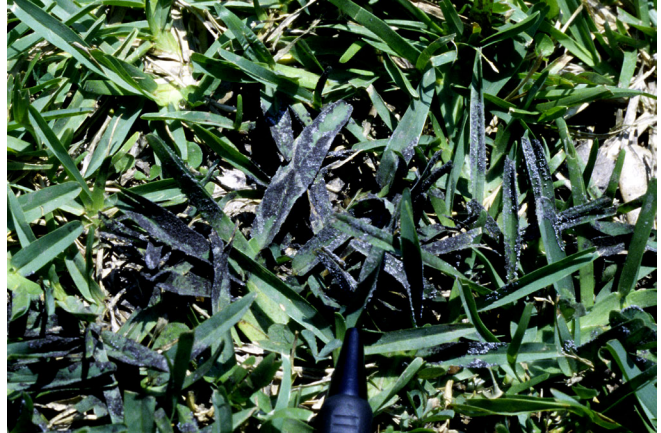
Slime mold organism's fruiting (sporangium) stage.

Slime molds are harmless, primitive fungi of the Myxomycetes. There are five genera and about 100 species that form slime molds, but only Physarum, Fuligo and Mucilago genera are commonly found in Louisiana. Some unusual species like the northern 'Dog Vomit Slime Mold' ( http://botit.botany.wisc.edu/toms_fungi/june99.html ) are interesting to find.