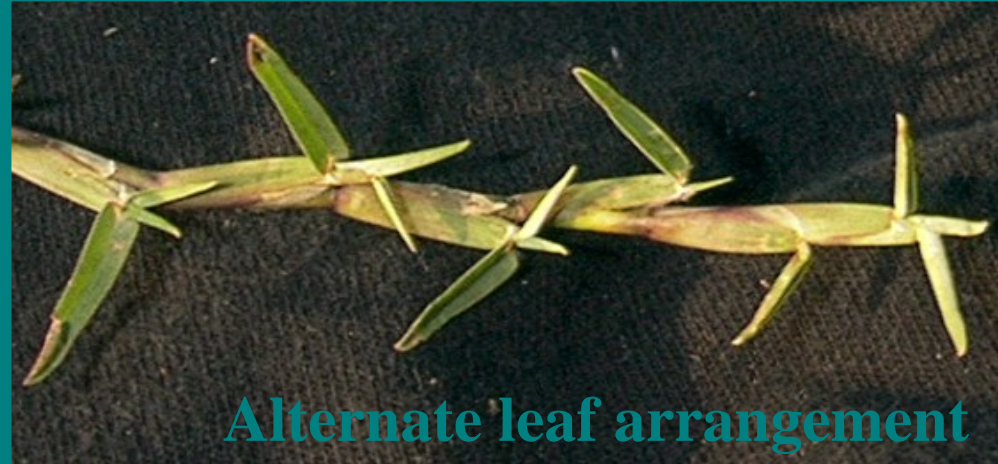
Alternate leaf arrangement