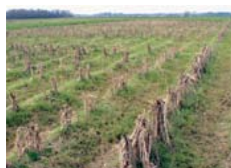
Favorable over-wintering habitat, standing corn stubble