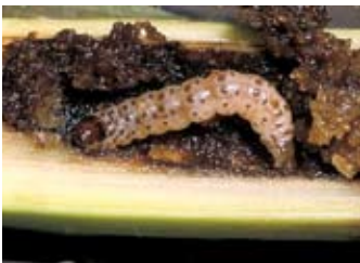
Sugarcane borer larva