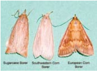
Adult corn borer moths