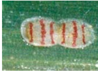
Southwestern corn borer egg mass