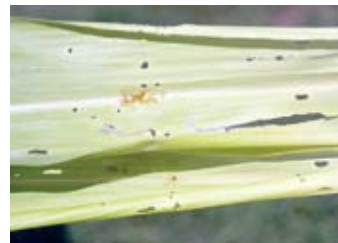
Young borer feeding signs in whorl stage corn