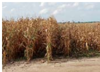
Bt corn (L) vs. Non-Bt corn (R) with lodging from borer damage