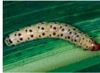
Southwestern corn borer larva