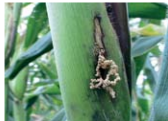
Sugarcane borer entrance hole, with frass, into an ear shoot