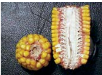
Borer feeding in corn cob, through the shank