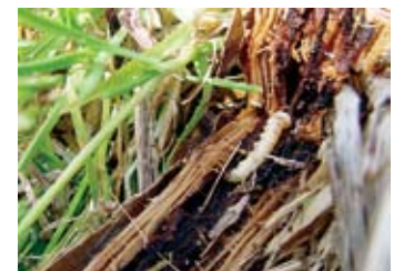
Sugarcane borer larva over-wintering in corn