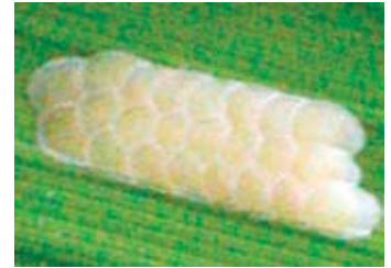
Sugarcane borer egg mass