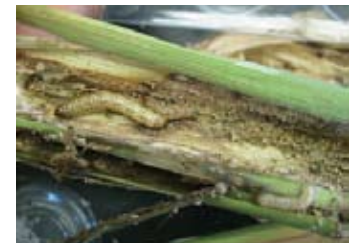
Sugarcane borers and stalk damage