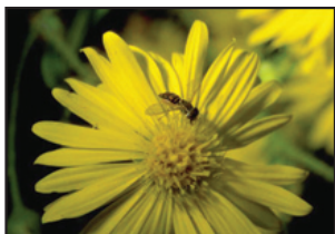
Syrphid - adult