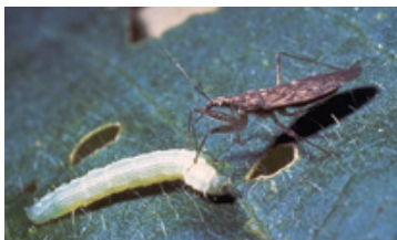
Damsel Bug - adult

Minute Pirate Bugs ( Anthocoridae ) – These are small (2-5 mm) oval bugs with many species sporting black and white markings. These true bugs feed on small insects and insect eggs and are found on flowers and in leaf litter.