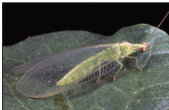
Green Lace Wing - adult