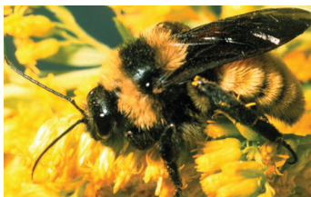
Bumble Bee - adult

Fig Wasps ( Agaonidae ) - The fig wasp's life cycle is closely tied to the fig trees they inhabit with the fig tree relying exclusively of this insect for pollination. The female wasp pollinates the fig tree when laying her eggs usually losing her life in the process.