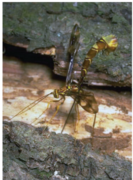
Ichneumonid - adult

( Ichneumonidae ) – These wasps vary in size, coloration, and form but tend to look slender with long, many-segmented antennae and a long ovipositor that can be longer than the insects body. The female wasp uses her long ovipositor to penetrate plants