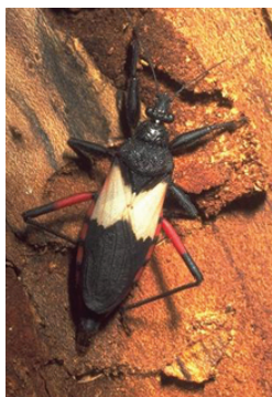
Assassin Bug - adult

Syrphid Flies or Flower Flies ( Syrphidae ) – Many species of syrphids are predacious on other insects (chiefly aphids) during their larval stage. The larvae are long, slender and “maggot-like” in appearance. The adults are important pollinators for a variety of backyard plants.