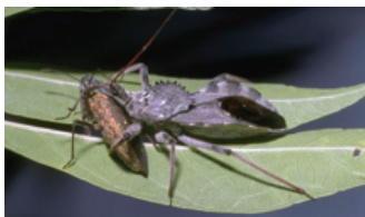
Wheelbug - adult

a painful bite and should not be handled. These insects inhabit a diverse number of habitats in the environment (field crops, leaf litter, orchards, flowers and garden plants).