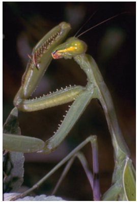
Praying Mantids - adult

( Mantodea ) – These are long slender insects with modified raptorial front legs. These insects feed on a variety of insects including other mantids. They usually lay in wait for their prey with their front legs held in a characteristic upraised position. This behavior has given the rise to their common name “praying mantids.”