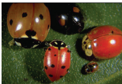
Lady Bug - adult

( Coccinellidae ) – These are small, convex, oval and often brightly colored beetles (many have distinct patterns used for identification). Both the larval and adult stages are predacious on small, soft-