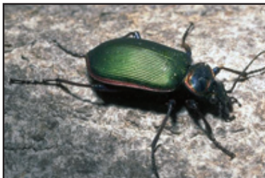
Caterpillar Hunters - Carabids - adult

Ground Beetles ( Carabidae ) – This family encompasses a large number of species (2,200+) that range in size and color and can be found in a multitude of habitats (under stones, logs, leaves, bark). Both larvae and adults are generalist predators and feed on a wide assortment of insects. One of the most common carabids seen is the metallic-colored beetles belonging to the genus Calosma and often called caterpillar hunters.