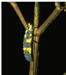
Lady Bug - larvae

bodied insects (whiteflies, thrips, mites, small caterpillars), most notably aphids.