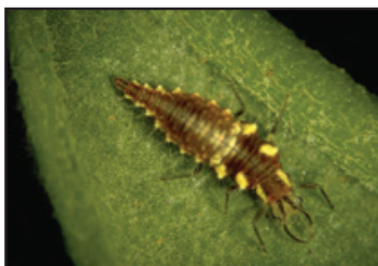
Green Lace Wing - larvae

( Chrysopidae and Hemerobiidae ) – At larval stage this insect is predacious on a number of soft-bodied insects, chiefly on aphids (the larvae are often called aphid lions). The larvae are long, slender insects equipped with large, sickle-shaped mandibles that they use to actively hunt prey. Some adults are predacious but most feed on pollen or honeydew. Some species can be obtained from commercial sources to augment the local populations.