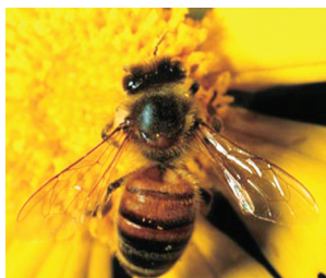
Honey Bee - adult

Honey Bees and Bumble Bees ( Apidae ) - These insects belong to an extremely important family that provides pollination for a number of fields crops and orchards as well as backyard plants. Bumble bees are larger, more robust and are characteristically black and yellow. Honey bees are smaller and are typically golden brown and black.