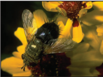
Tachinid - adult

Tachinids ( Tachinidae ) – These insects belong to a diverse family of flies that consists of 1,300+ species. These flies most commonly deposit their eggs directly on the host’s body. The eggs hatch, and the larvae burrow into the host’s body and feeds internally usually resulting in the death of the host.