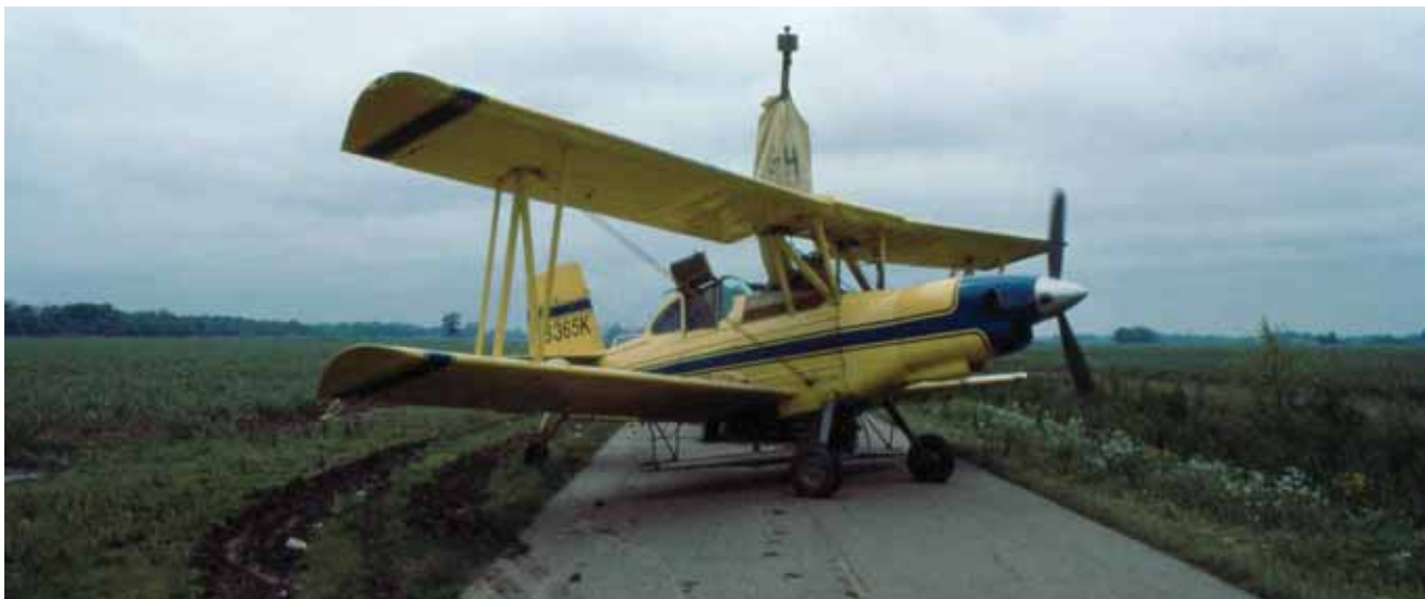
Fig. 1-11. Loading aircraft with seed.