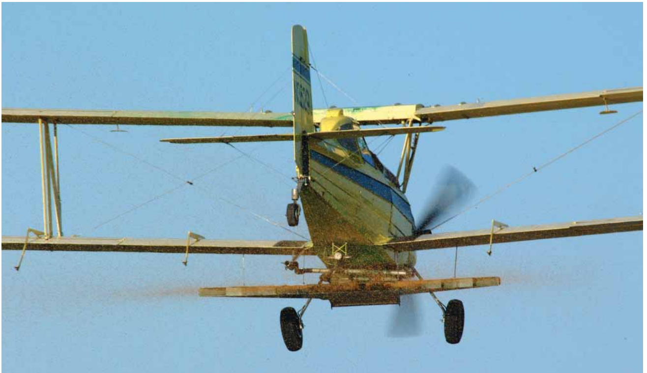
Fig. 1-8. Aircraft sowing seed.

A rough seedbed will minimize seed drift following seeding and facilitate seedling anchorage and rapid seedling development. Seed and seedling drift is often quite severe, especially in large cuts common