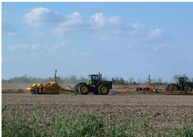
Fig. 1-3. Laser leveling.

buckets, are equipped with laser receivers and a computer. The computer is programmed according to the needs of the grower and field. As the tractor travels over the field, the implement removes soil from the high areas and deposits it in low areas creating either a gradual slope or completely level field depending on the programming and intended farming practices. On silt loam soils with a distinct hard pan the procedure may be done while the field is flooded and is termed water leveling (Fig. 1-4).