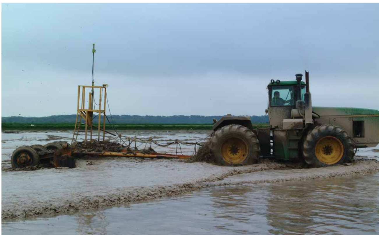
Fig. 1-4. Water leveling.

Rice can be grown successfully on many different soil textures throughout Louisiana. Most rice is grown on the silt loam soils derived from either loess or old alluvium that predominate the southwestern region and, to a lesser extent, the Macon Ridge area of northeast Louisiana. The clay soils in the northeastern and central areas derived from more recent alluvial deposits are also well adapted to rice culture (Fig. 1-5). Deep, sandy soils are usually not suitable for rice production. The most important soil characteristic for lowland rice production is the presence of