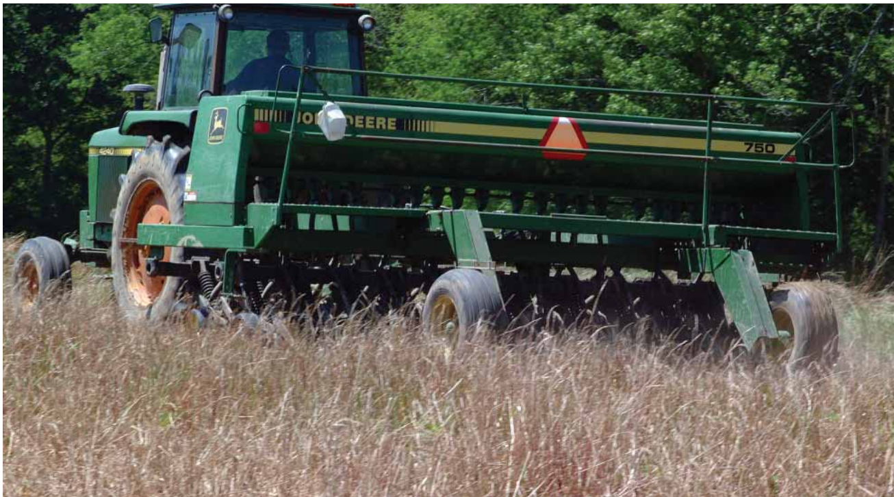
Fig. 1-13. Drilling seed into standing vegetation.

Water management. Inadequate stand establishment is a common problem in water-seeded, no-till rice, especially in a pinpoint flood system. Delaying permanent flood establishment for 2 to 3 weeks after