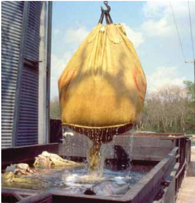
Fig. 1-9. Soaking seeds.

Water seeding may be done with dry or presprouted seed (Fig. 1-9). Presprouted seed offers the advantages of higher seed weight and initiation of germination because the seed has already imbibed water. Presprouting is accomplished by soaking seed for 24 to 36 hours followed by draining for 24 to 36 hours prior to seeding (Fig. 1-10). These periods may need to be extended under cool conditions. A disadvantage to presprouting is that seed must be planted shortly after presprouting or deterioration will occur (Fig. 1-11).