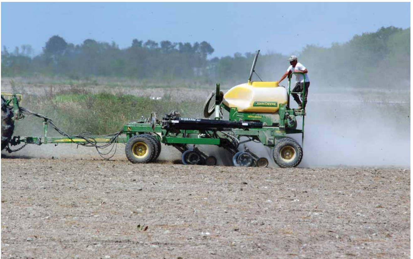
Fig. 1-7. Drilling seed into prepared seedbed.