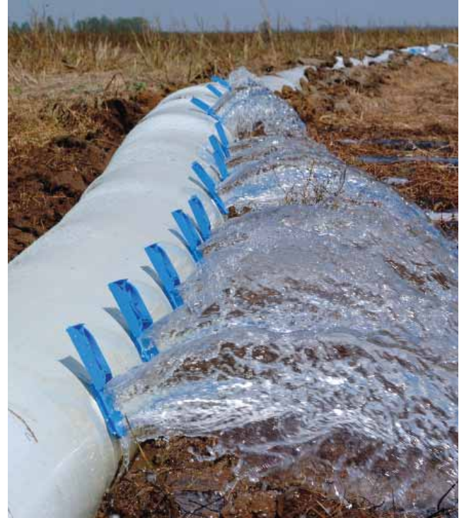
Fig. 1-6. Using poly pipe for irrigation.

On zero grade fields, flooding and drainage are accomplished by constructing the field so that at least two sides are bordered by deep trenches. Most often,