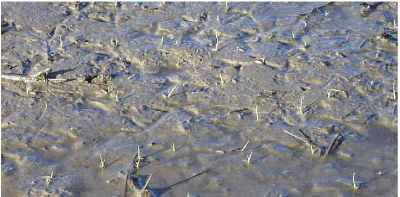
Fig. 1-12. Emerged seedlings ready for pinpoint flood.

If the N requirement of a particular field is known, all N fertilizer should be incorporated prior to flooding and seeding. Otherwise, one-half to two-thirds