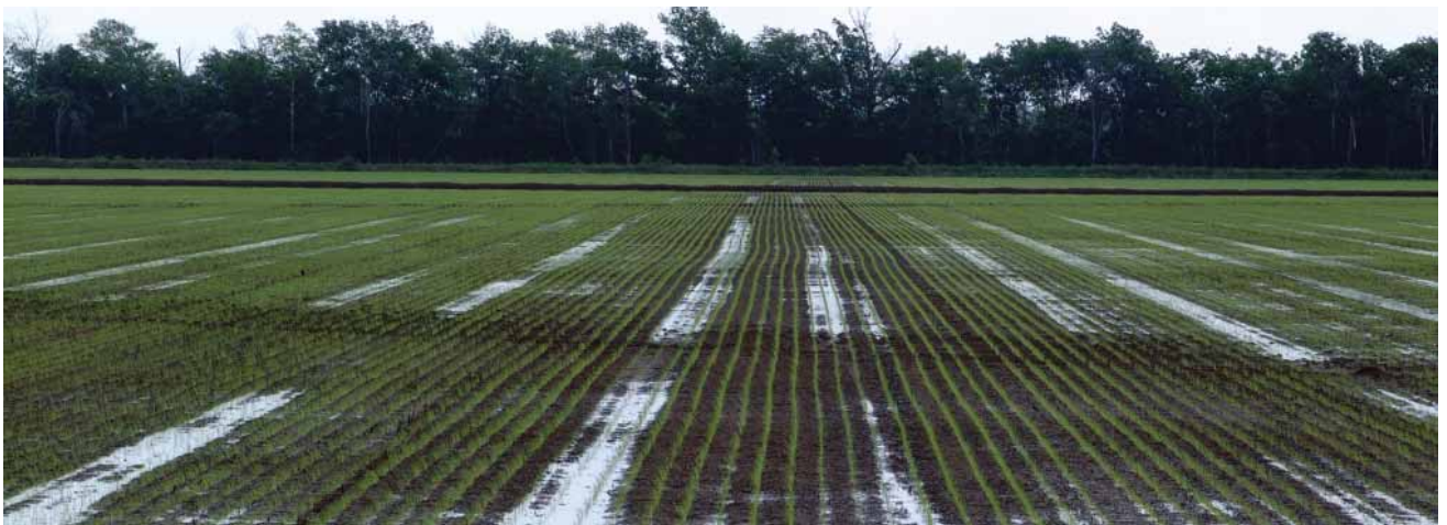
Fig. 1-2. Zero grade field.

In the past, leveling land was done first by identifying the natural slope or contour in fields using standard surveying methods. Then, levees were constructed following contour lines with a 0.2-foot elevation interval. The development of laser-leveling equipment has drastically improved both accuracy and efficiency of land forming (Fig. 1-3). A laser emitter is set up on a stationary platform. Tractor-drawn implements, ranging from a simple straight blade to massive dirt