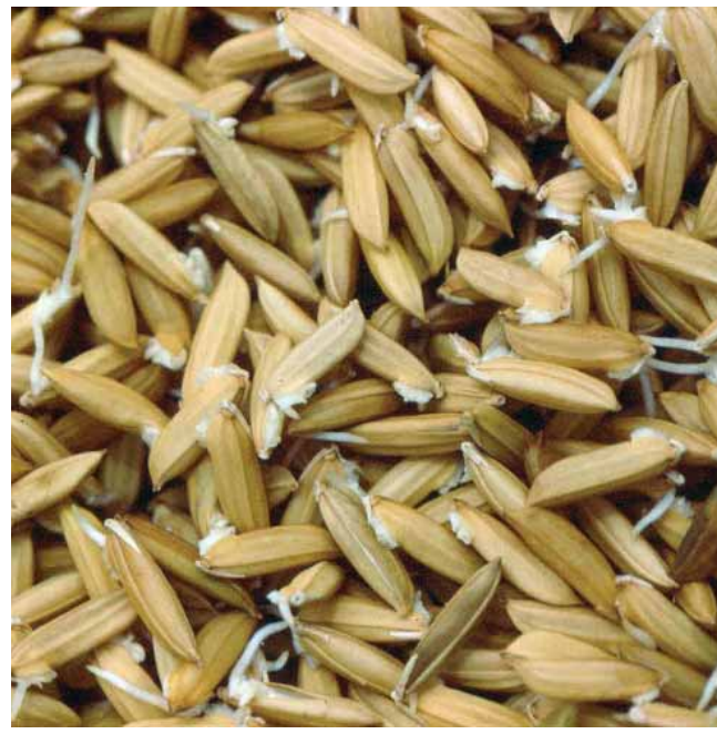
Fig. 1-10. Presprouted seeds.