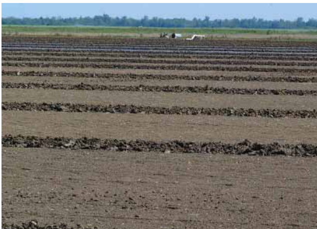
Fig. 1-1. More slope requires more levees.

Rice is grown under flooded conditions; therefore, it is best produced on land that is nearly level. Level tracts of land minimize the number of water-retaining barriers or levees required per unit of area (Fig. 1-1). Some slope is required, however, to facilitate adequate drainage even though the practice of growing rice on “zero grade” or level fields has gained in popularity (Fig. 1-2). Generally, a slope of less than 1 percent is adequate for water management. Most of Louisiana’s rice-growing areas are well-suited for rice