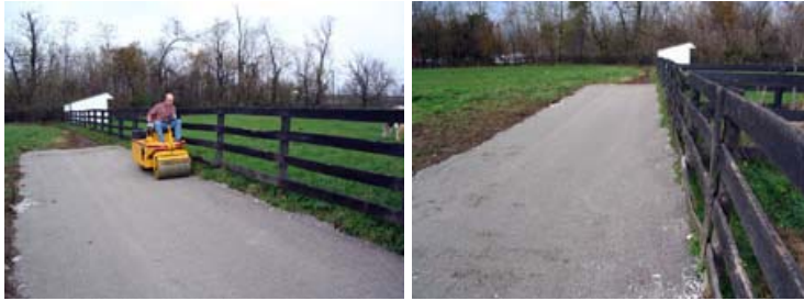
Figure 9. Compaction with drum roller.

desired level and create a durable surface (Figures 9 and 10). Wetting the DGA before rolling will aid in compaction.