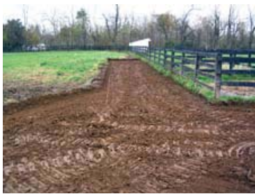
Figure 2. Excavation through the topsoil to stable soil beneath.

The first step in the construction process is the removal of soil from the affected area. The area should be excavated through the topsoil layer until stiff, stable soils are encountered. Extremely muddy areas may require overexcavation to reach a solid layer. Before removing the topsoil, excavate a few test holes in the area to determine how deep you will need to go. Typically, about 9 inches of soil must be removed from the area to reach a solid subbase for pad construction. Knowing beforehand how much topsoil will be removed will allow you to determine how much rock will be needed. The excavated soil may be used to landscape other areas on the farm to aid in water flow control. Be aware that excavated soil expands to a greater volume than does compacted soil. Also remember to cut away soil directly under fences to give clean, distinct lines for placing the fabric and rock.