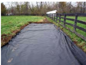
Figure 3. Geotextile fabric in place after excavation.

Geotextile fabrics are commonly used in construction projects such as roads and highways for subgrade stabilization. The geotextile, which is used to separate the soil from the rock layers, is a key element for successful long-term performance of the traffic pad (Figure 3). If the geotextile