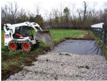
Figure 5. Base layer of crushed stone.

The base layer of crushed stone creates space for the storage and drainage of water (Figure 5).