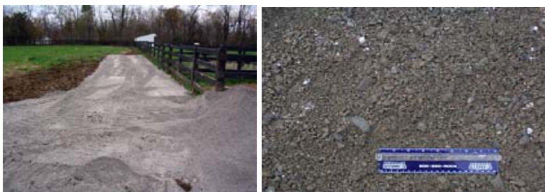
Figure 7. Surface layer of crushed stone

A layer of densely graded aggregate (DGA) (Figures 7 and 8) is used as the final surface material on the pad.