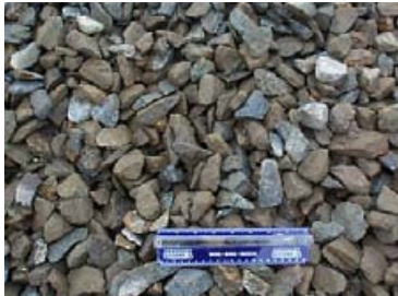
Figure 6. No. 4 crushed limestone.

The rocks must be large enough to provide adequate pore space for the water but small enough for easy handling and placement. No. 4 or No.2 crushed limestone rock (Figure 6)