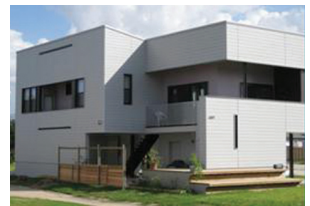
Green/Modern Showcase Milne Blvd.