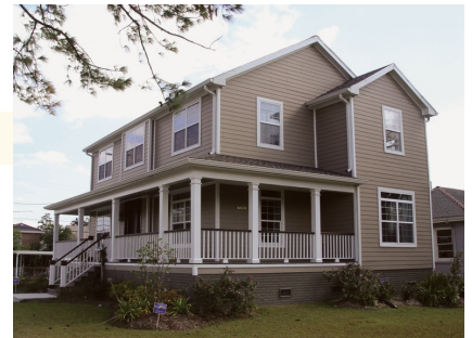
Raised Floor Living Showcase Canal Blvd.

Select Exhibits from Universities and the National Floodproofing Conference